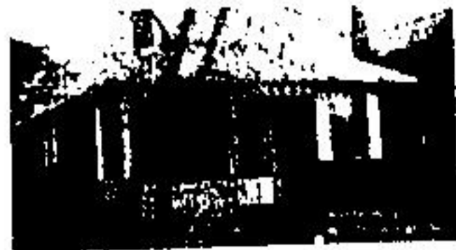
PRICE $45,000.00 Brick bungalow, broadloomed throughout.