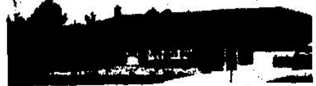
PRICE $71,900.00 Country Ranch Bungalow