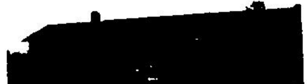
PRICE $79,900.00 Country bungalow with walk out from dining room, fenced yard and above ground pool.