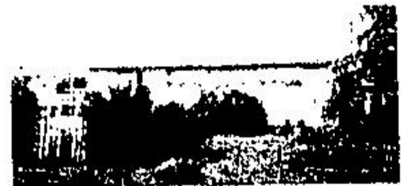
PRICE $79,900.00. 9 acres. Ideal hobby farm.