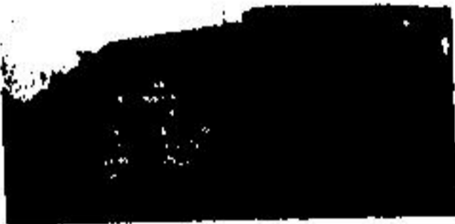
COMMERCIAL PROPERTY Price $115,000.00. Lot 100' x 150'. Good highway location in the heart of Georgetown.