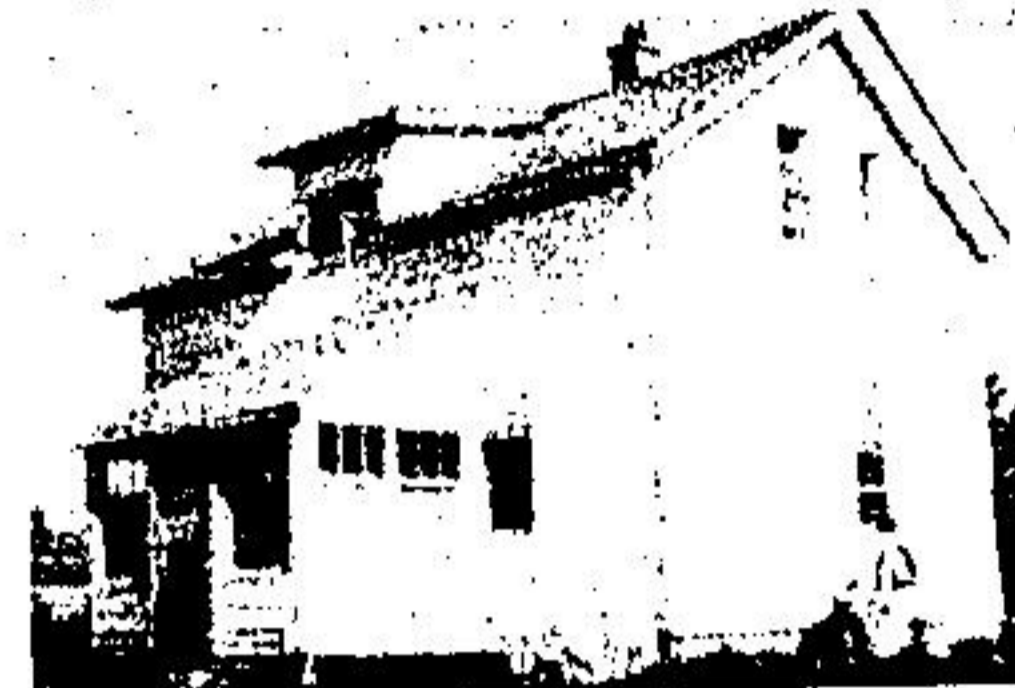
PRICE $39,900.00 Lot 124' x 75'. 1 1/2 storey home with 3 bedrooms