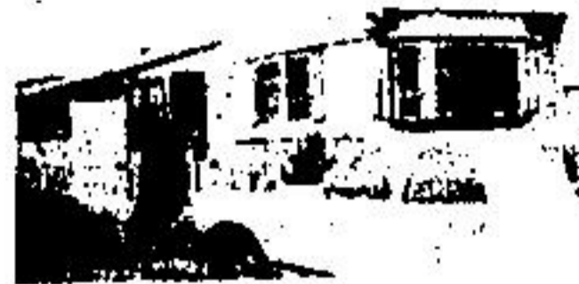
MOBILE HOME $20,500.00. Fully fenced lot.