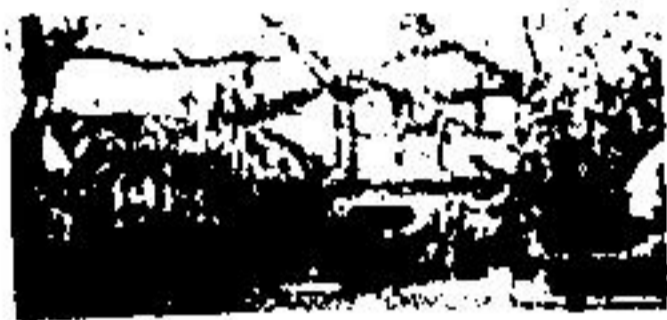
PRICE $65,900.00 Lot 100' x 200' 3 bedroom sidesplit