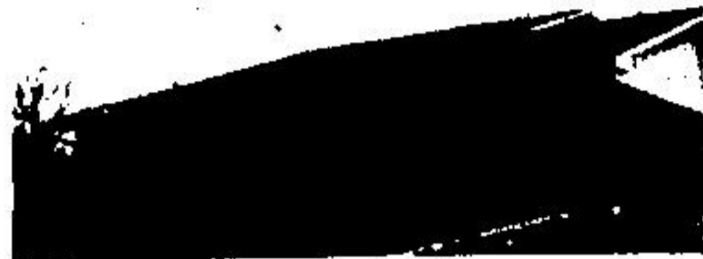
PRICE $87,900.00 Lot 68' x 155' Backsplit in exclusive area of Georgetown.