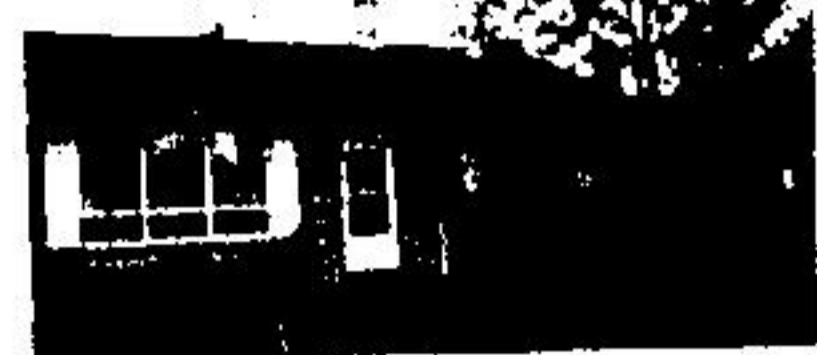
PRICE $53,500.00 3 bedroom backsplit situated on quiet court in Geor- town.