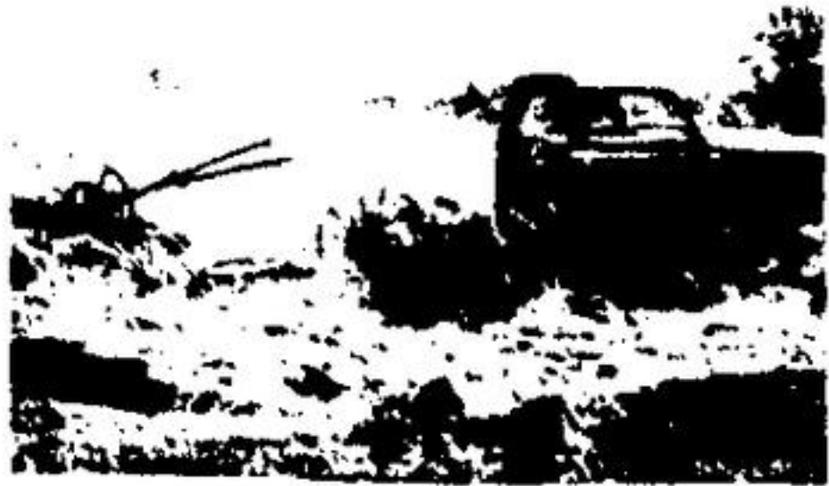
First tractor made from old car