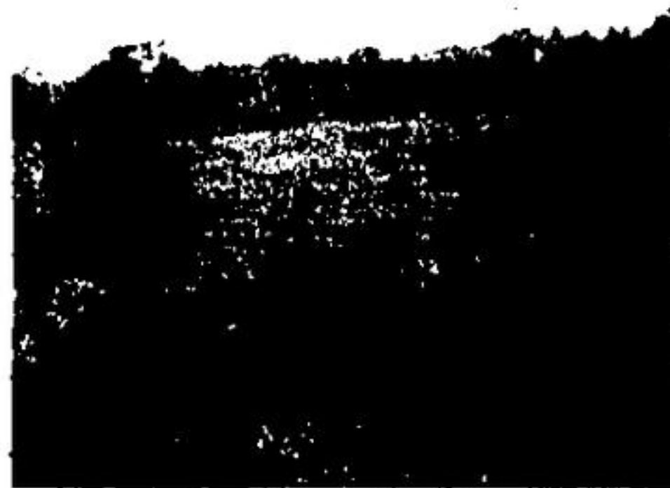
View from hill 1959