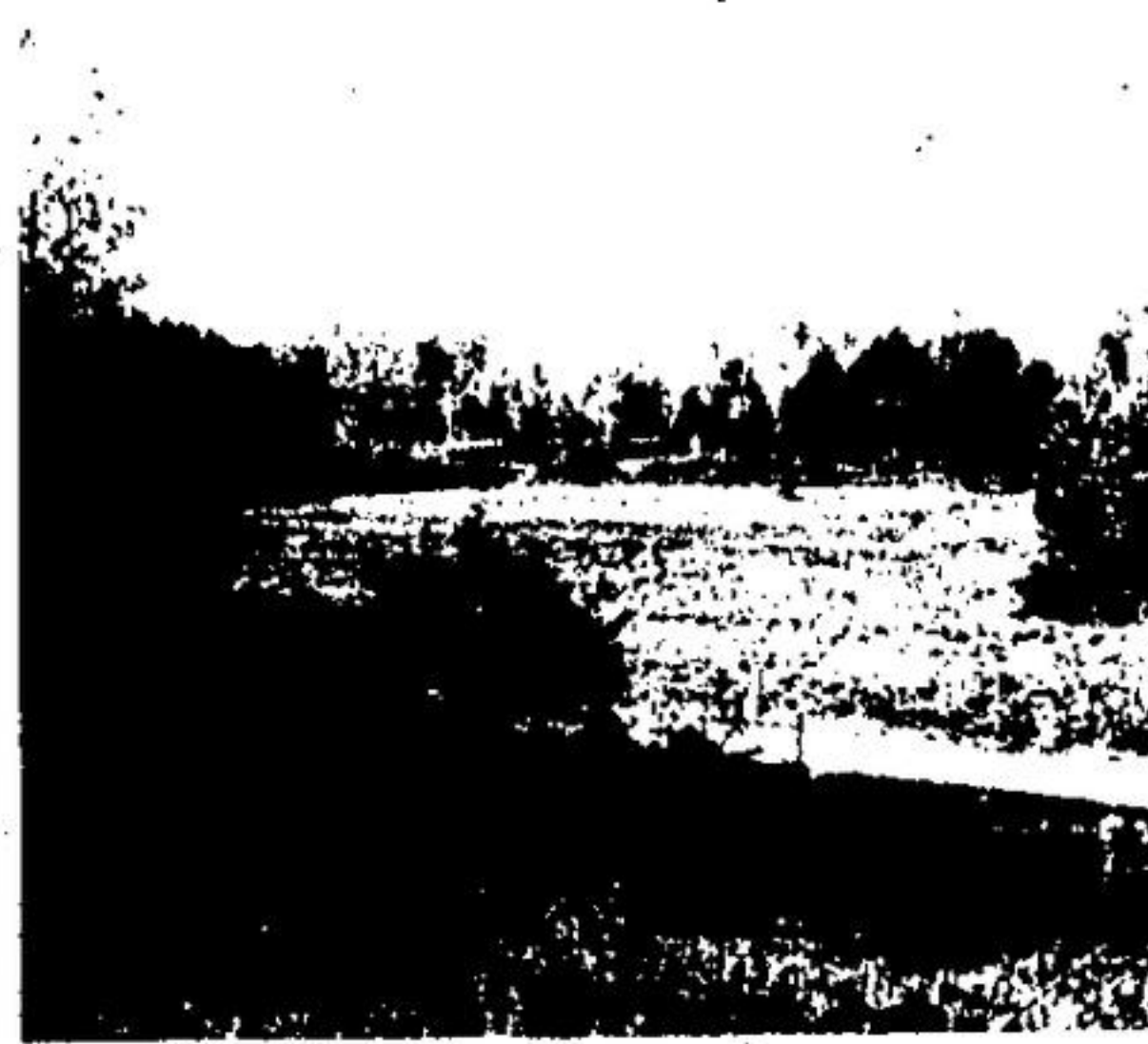
View from hill 1975