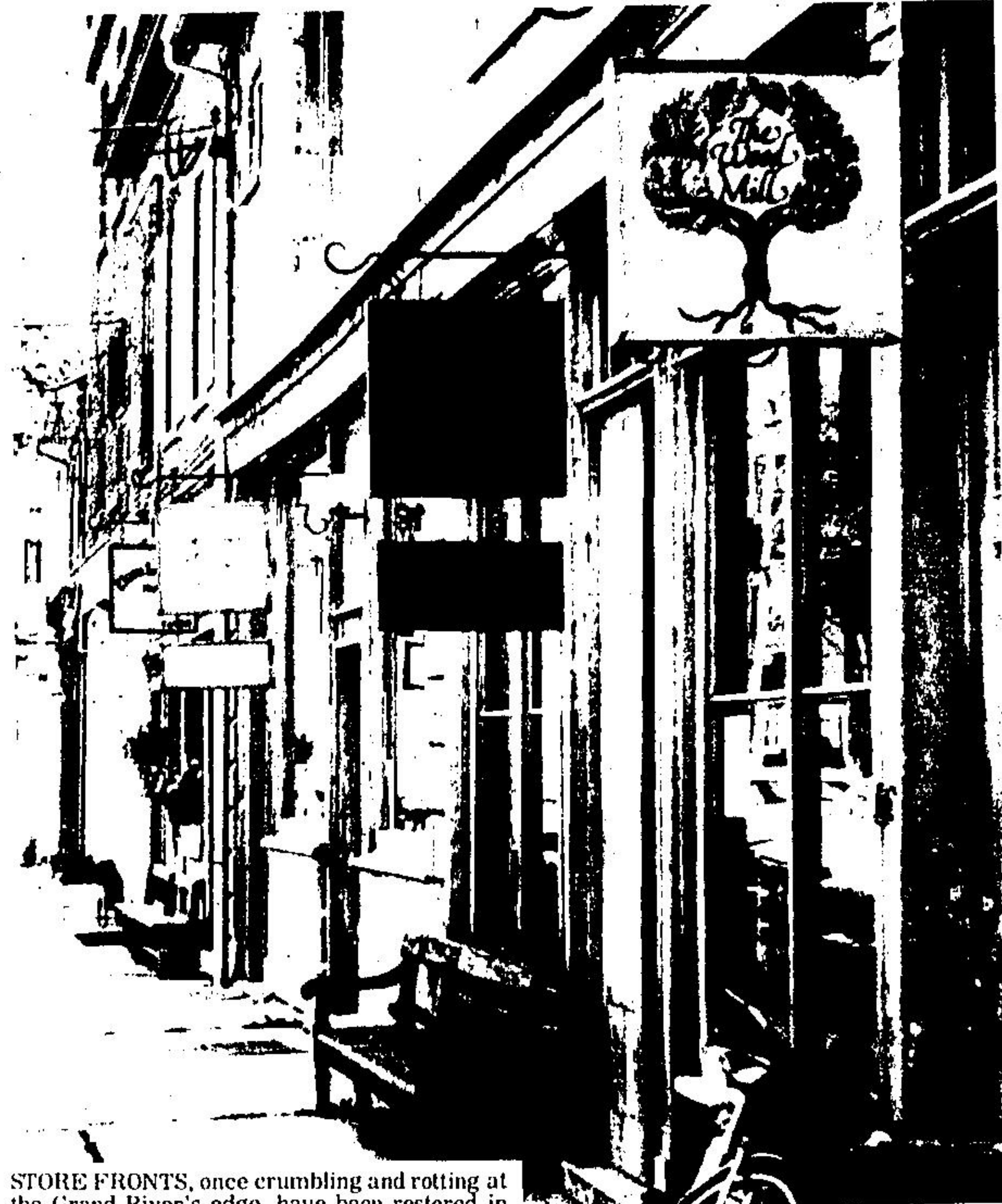
STORE FRONTS, once crumbling and rotting at the Grand River's edge, have been restored in Elora, creating a little bit of Old Ontario, and creating a mecca for shoppers who look for unusual items, often hand made, a few yards up the street the village also has modern stores and places of business creating a blend of old and new cultures.