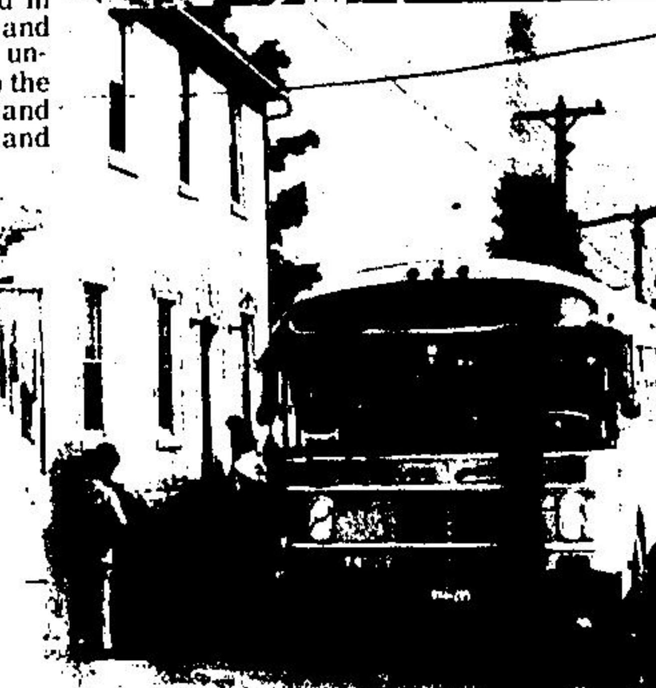
BUSLOADS OF TOURISTS continually tour through Elora taking in sights of interest such as this house being decorated in Pennsylvania Dutch fashion.