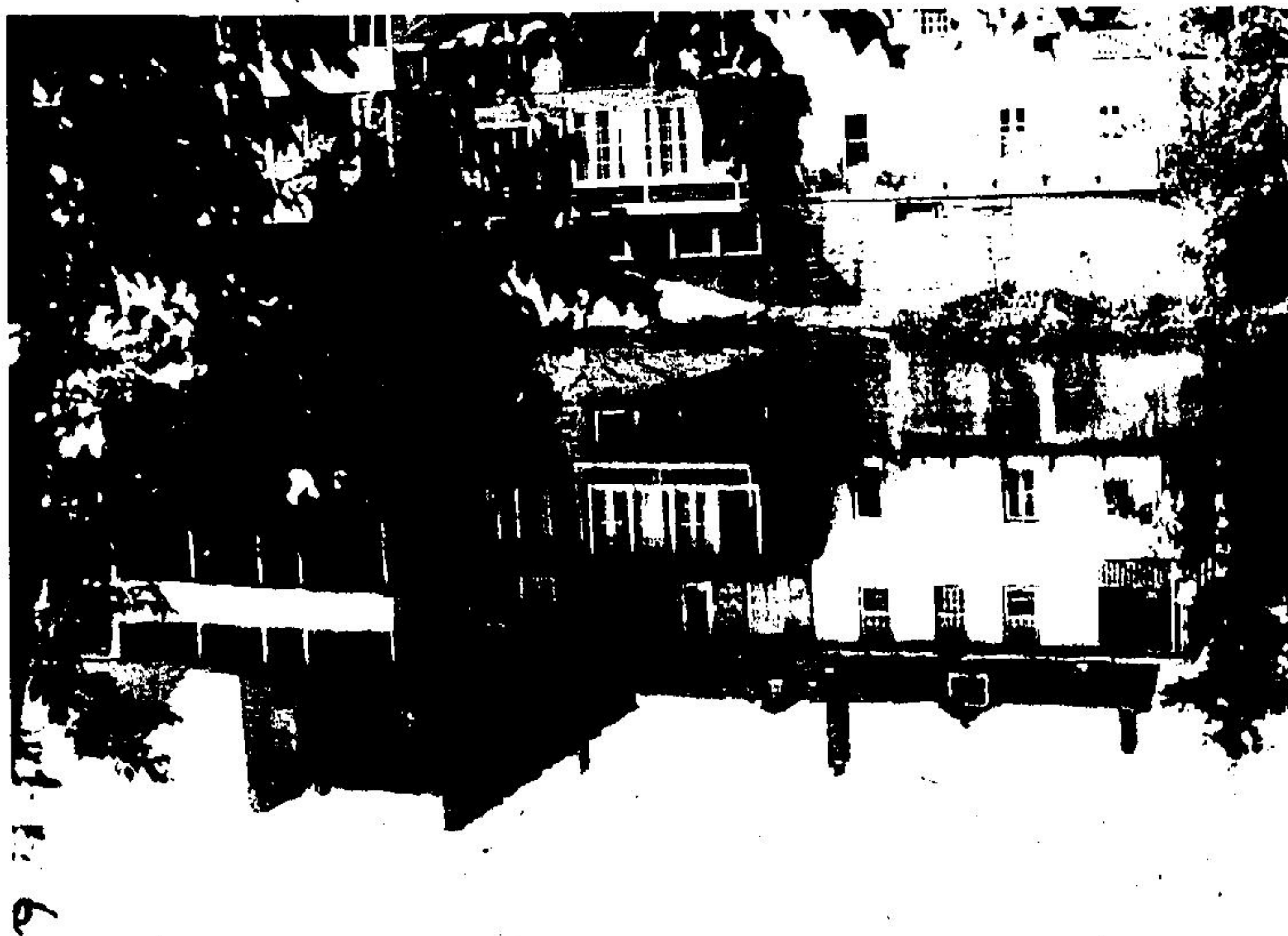
REFLECTION AT THE BACK of old store fronts along with Grand River in the heart of the village, add a unique feature in Elora which renovations to the old section of the river settlement compliments.