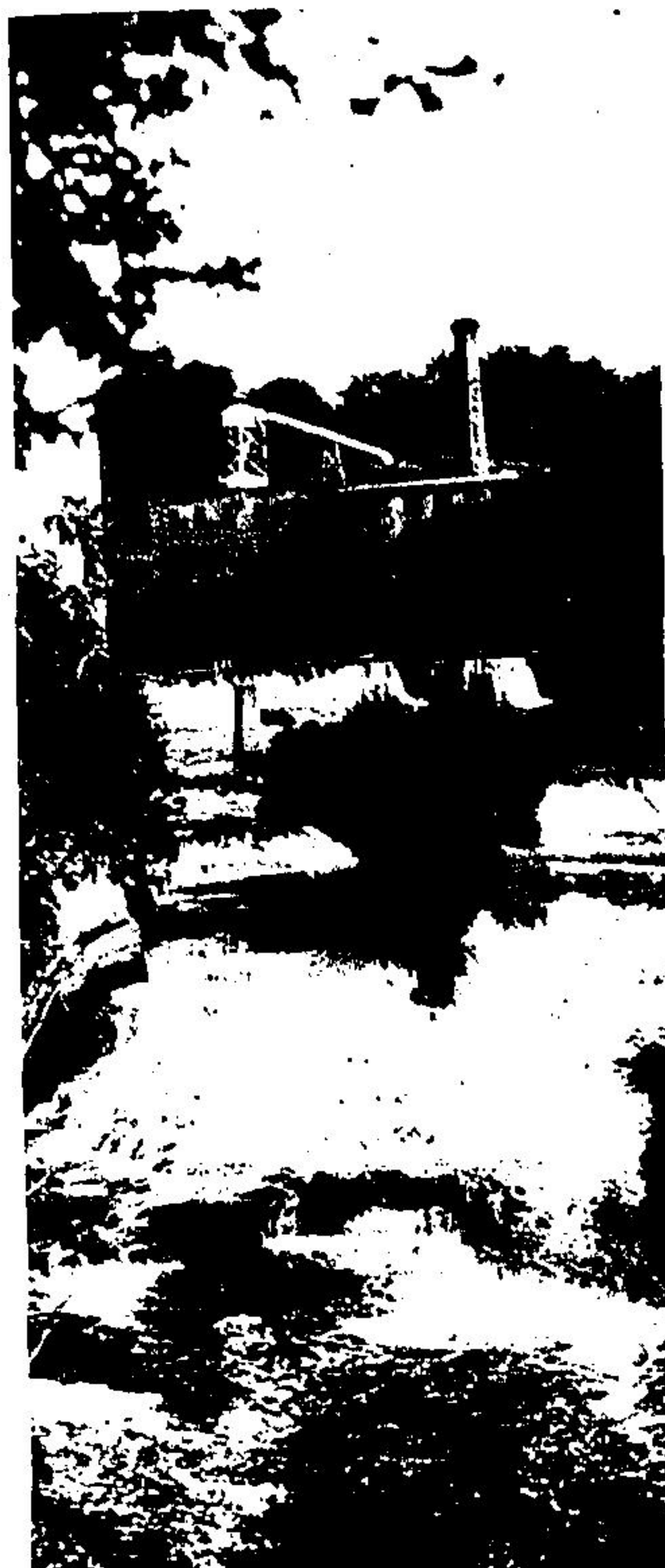
THIS ISLET CARVED by the Grand River before plunging into more placid waters is the symbol of the village of Elora.