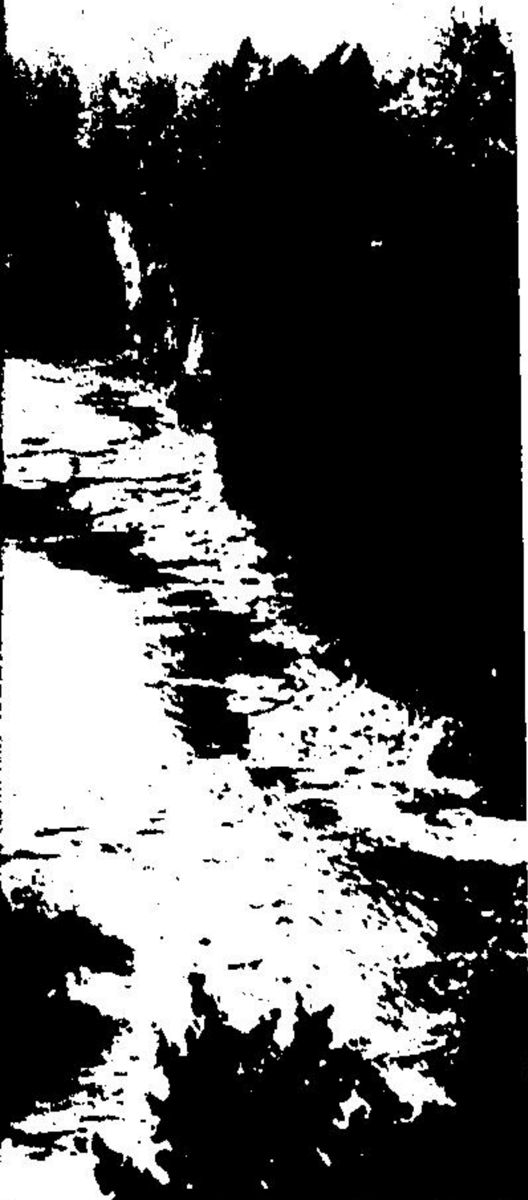
THE IRVINE RIVER'S confluence with the Grand River takes place in Elora Gorge. Both rivers are carved into a bed from chalky limestone rock that breaks into precipitous cliffs.