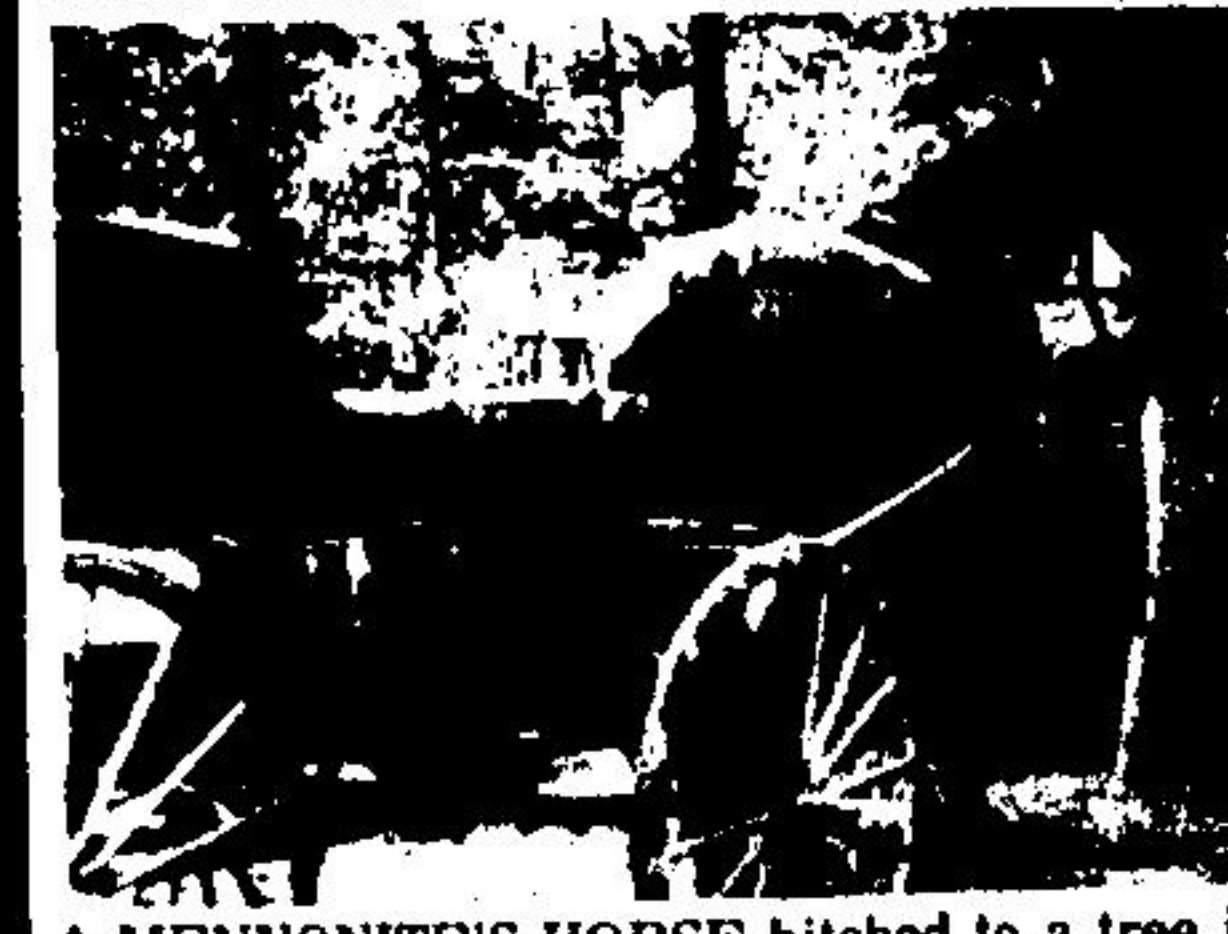
A MENNONITE'S HORSE hitched to a tree is not an uncommon sight in the village. Settlers of the Amish faith live in considerable numbers around Elora and add another "old world" dimension to the village.