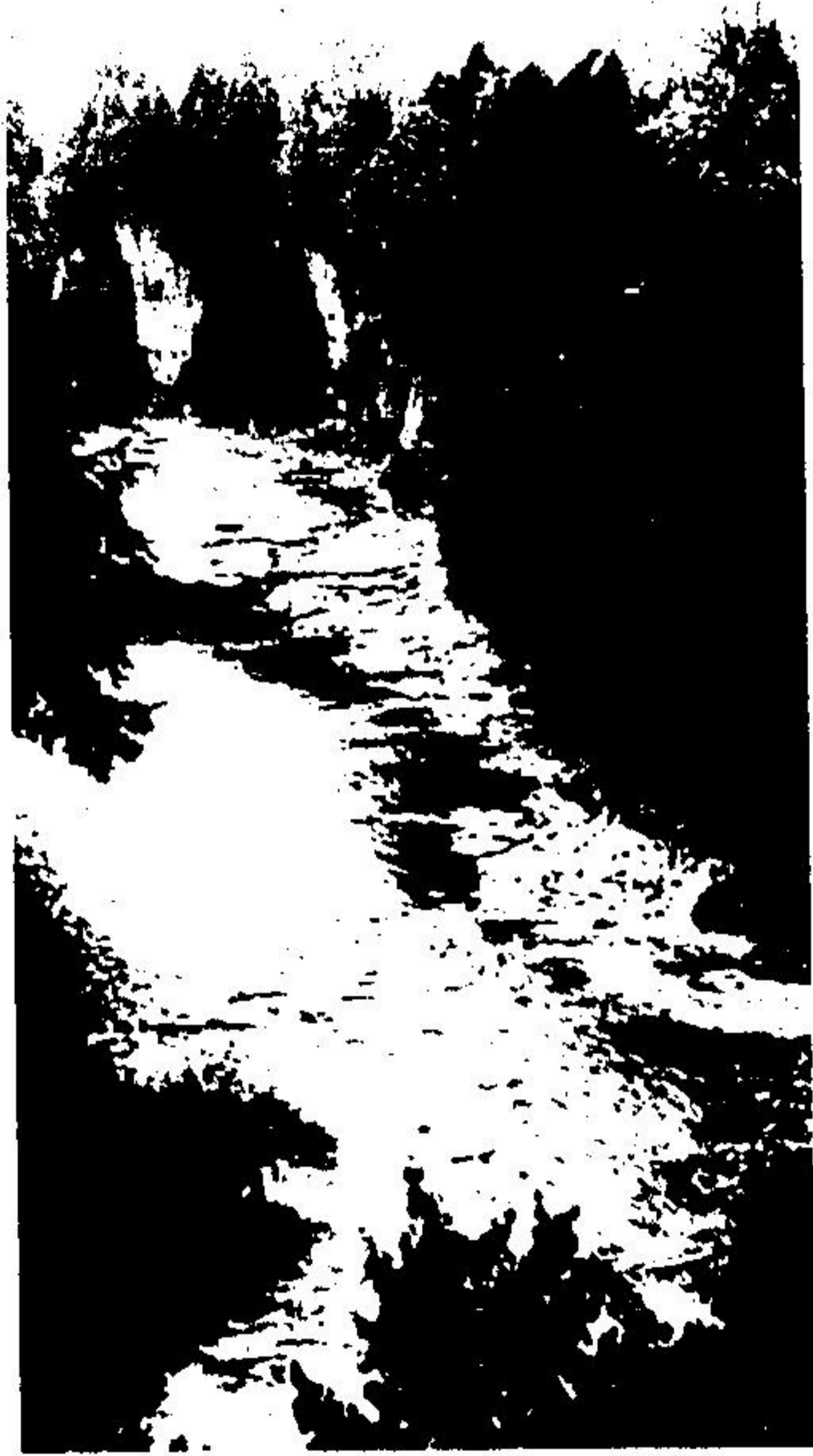
THE IRVINE RIVER'S confluence with the Grand takes place in Elora Gorge. Both rivers carved a bed from chalky limestone rock that have worn into precipitous cliffs.