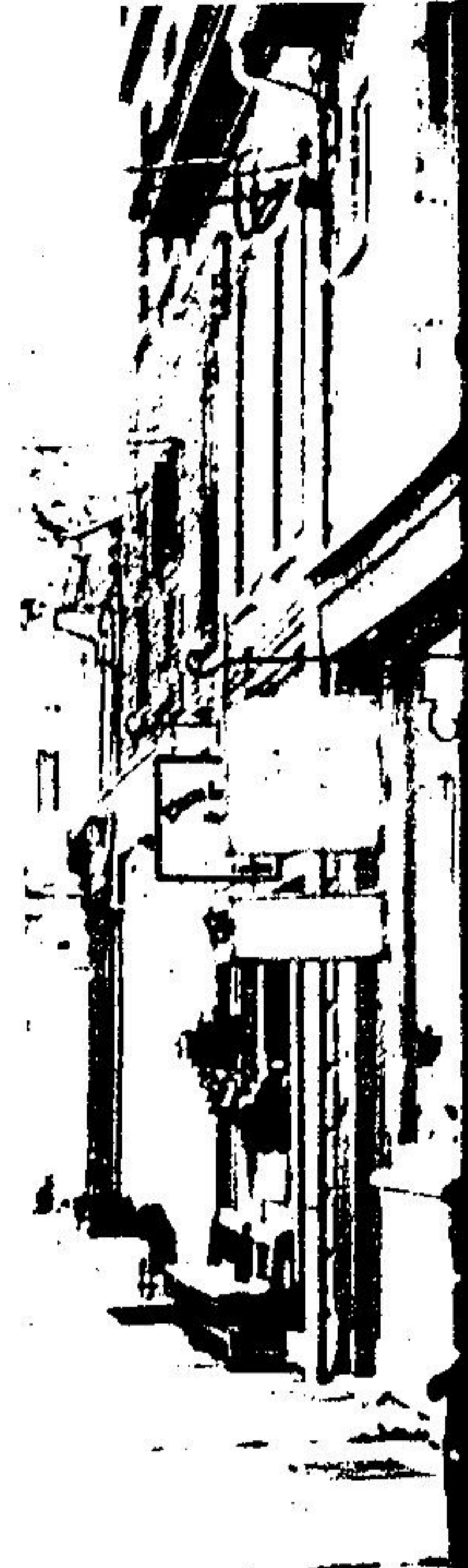
STORE FRONTS, once crumpled the Grand River's edge, have Elora, creating a little bit of creating a mecca for shoppers usual items, often hand made, a street the village also has m places of business creating a new cultures.