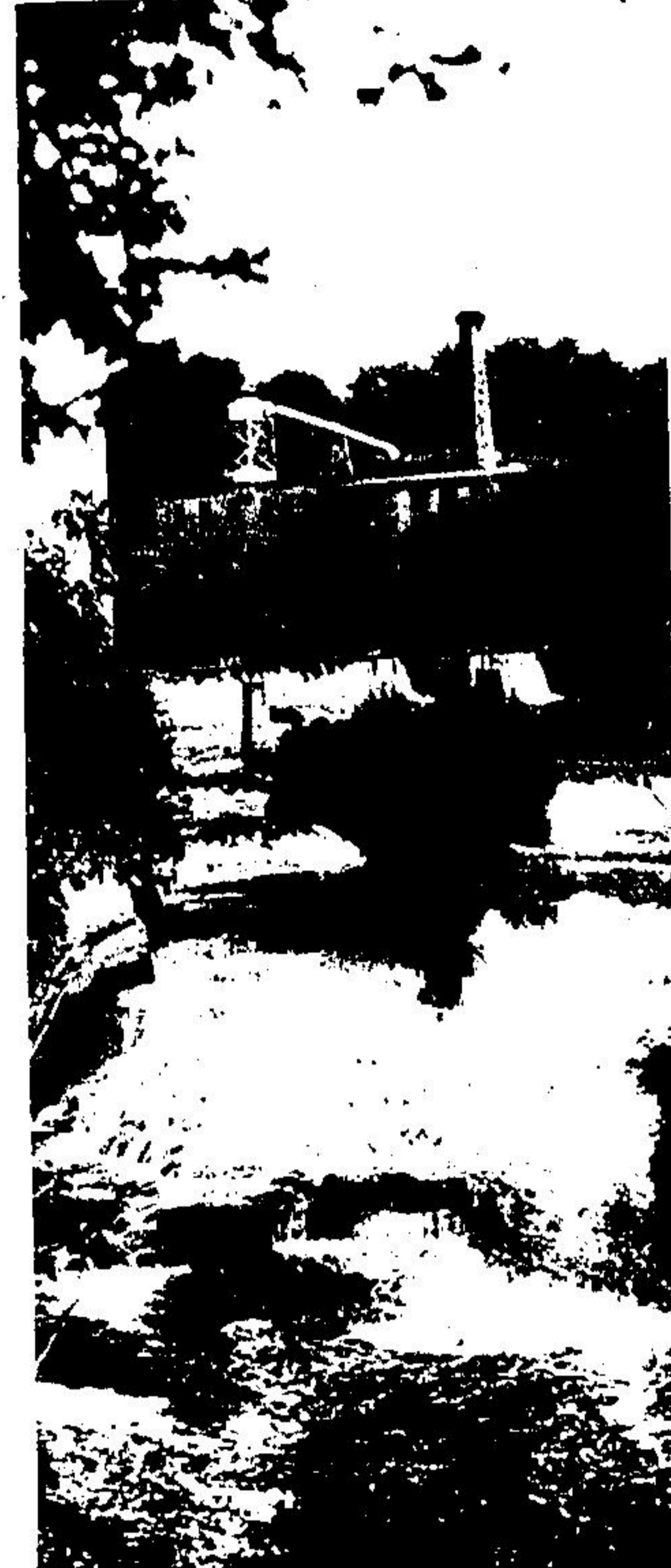
THIS ISLET CARVED by the Grand River before plunging into more placid waters is the symbol the village of Elora