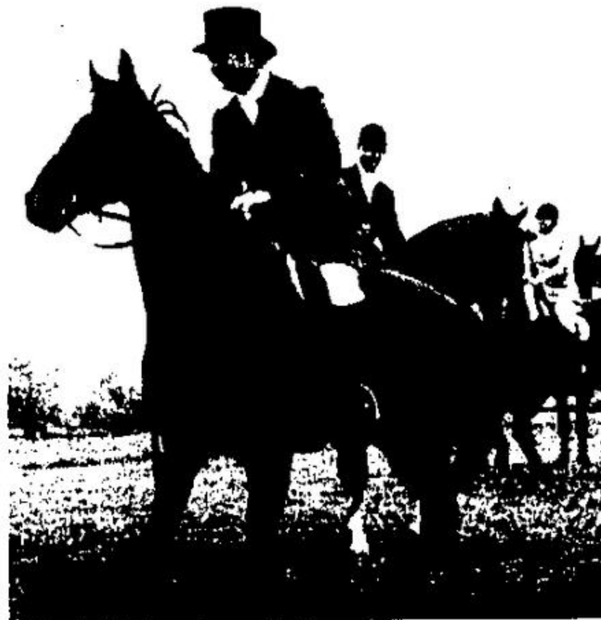
DECKED OUT in their hunting pinks, riders get ready to give chase to the fox.