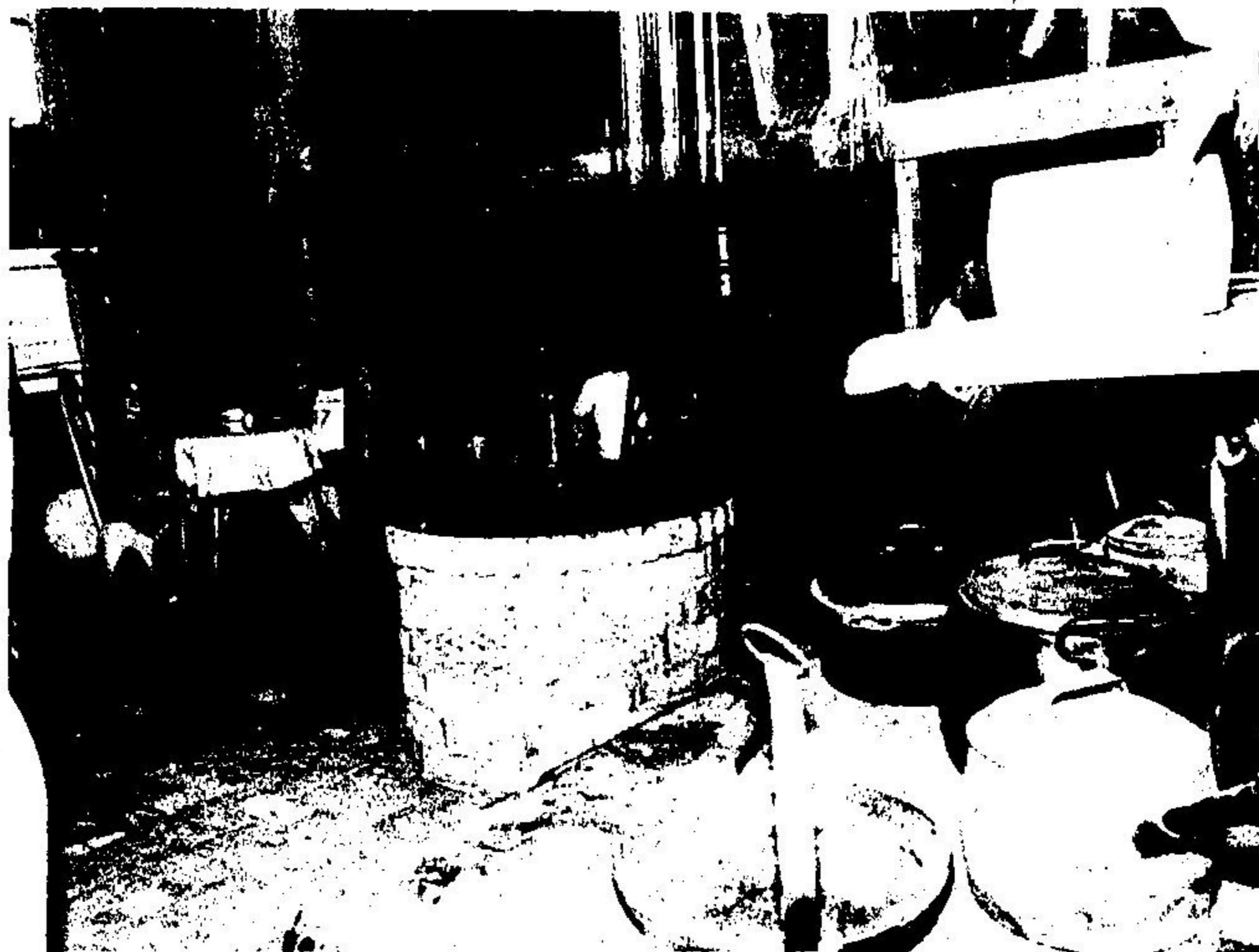
Inside the Slaughterhouse home-cooked meals are served.