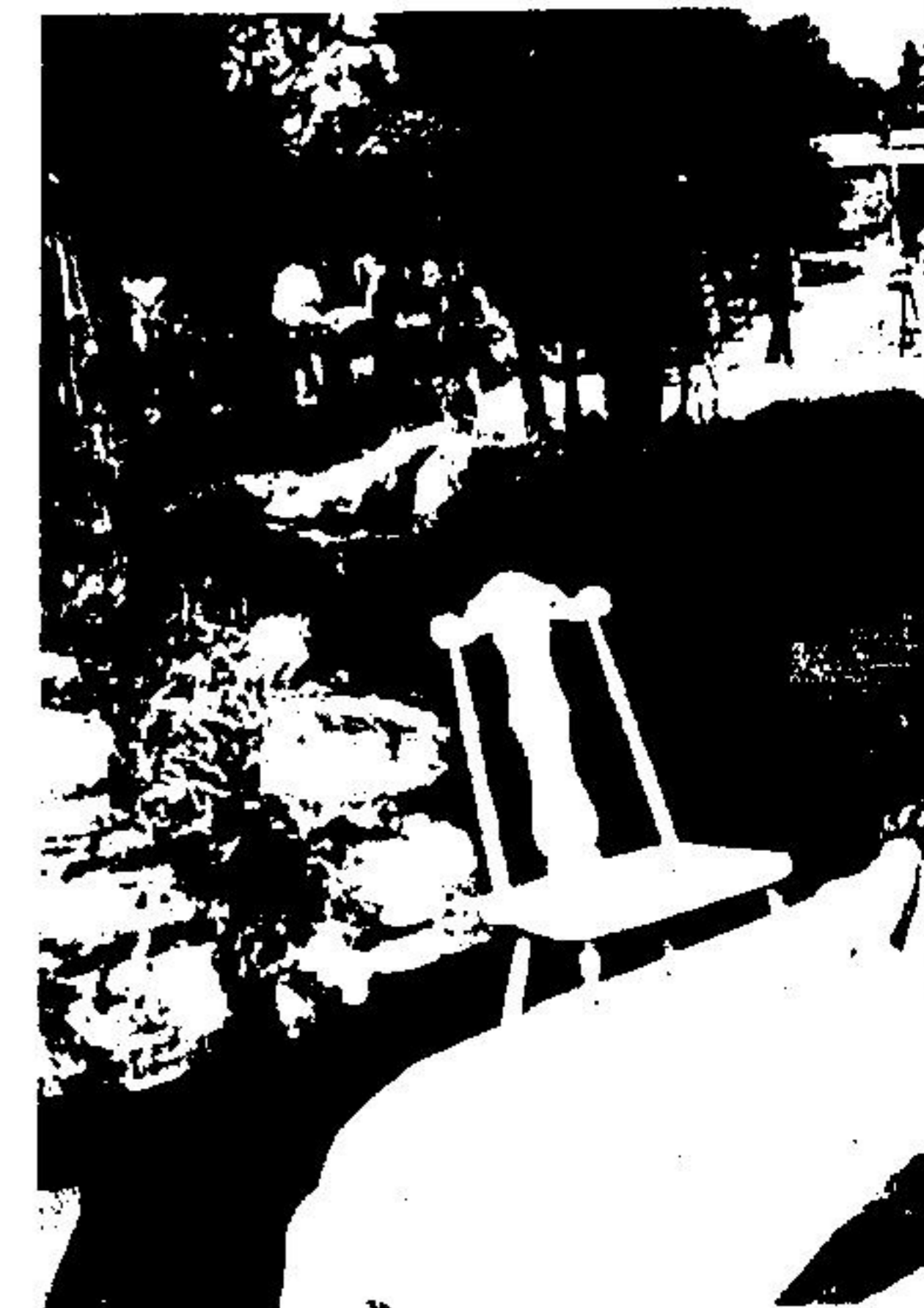
The setting is perfect for strolling and trying out an old bath