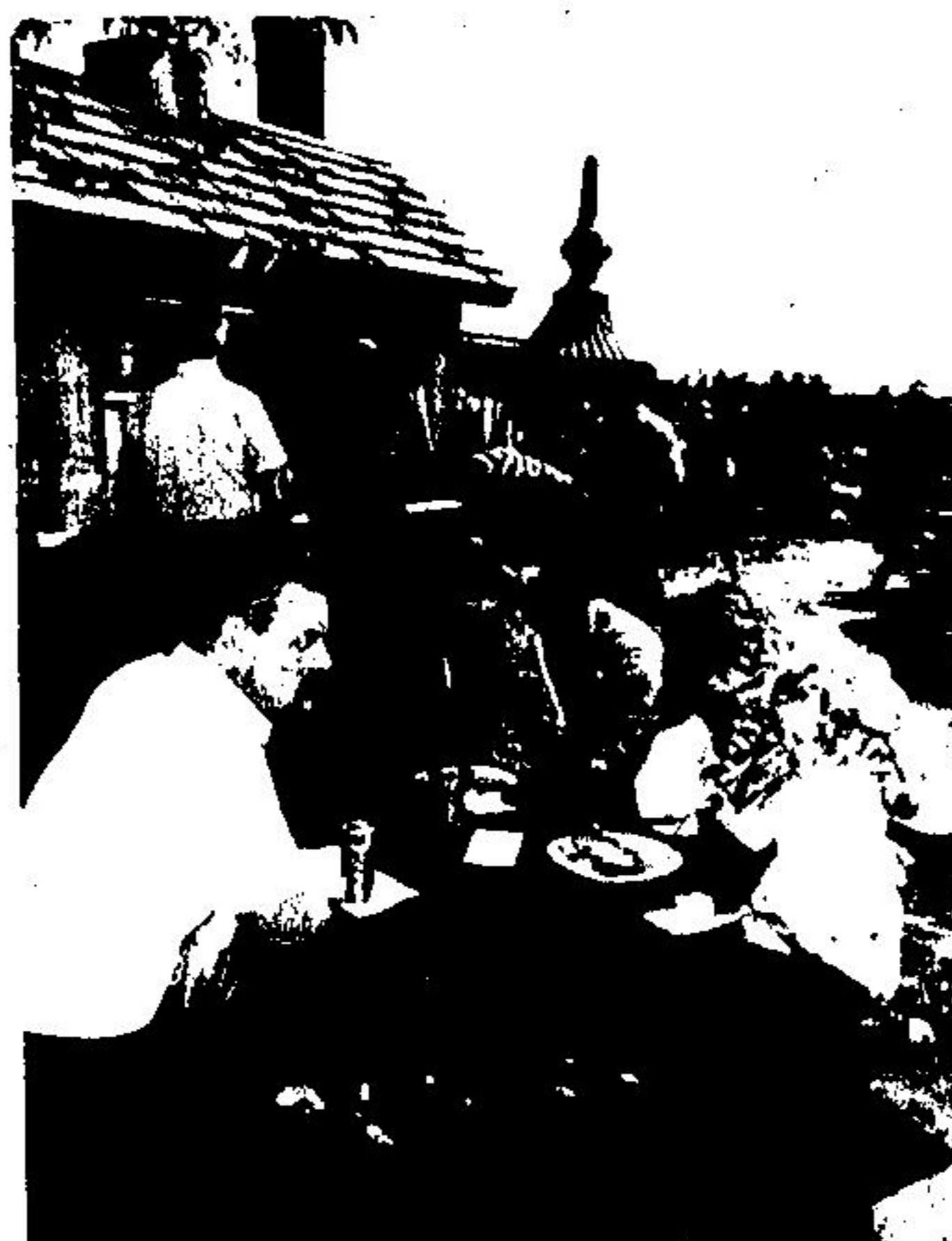
Fresh corn on the cob tastes good when eaten outside.