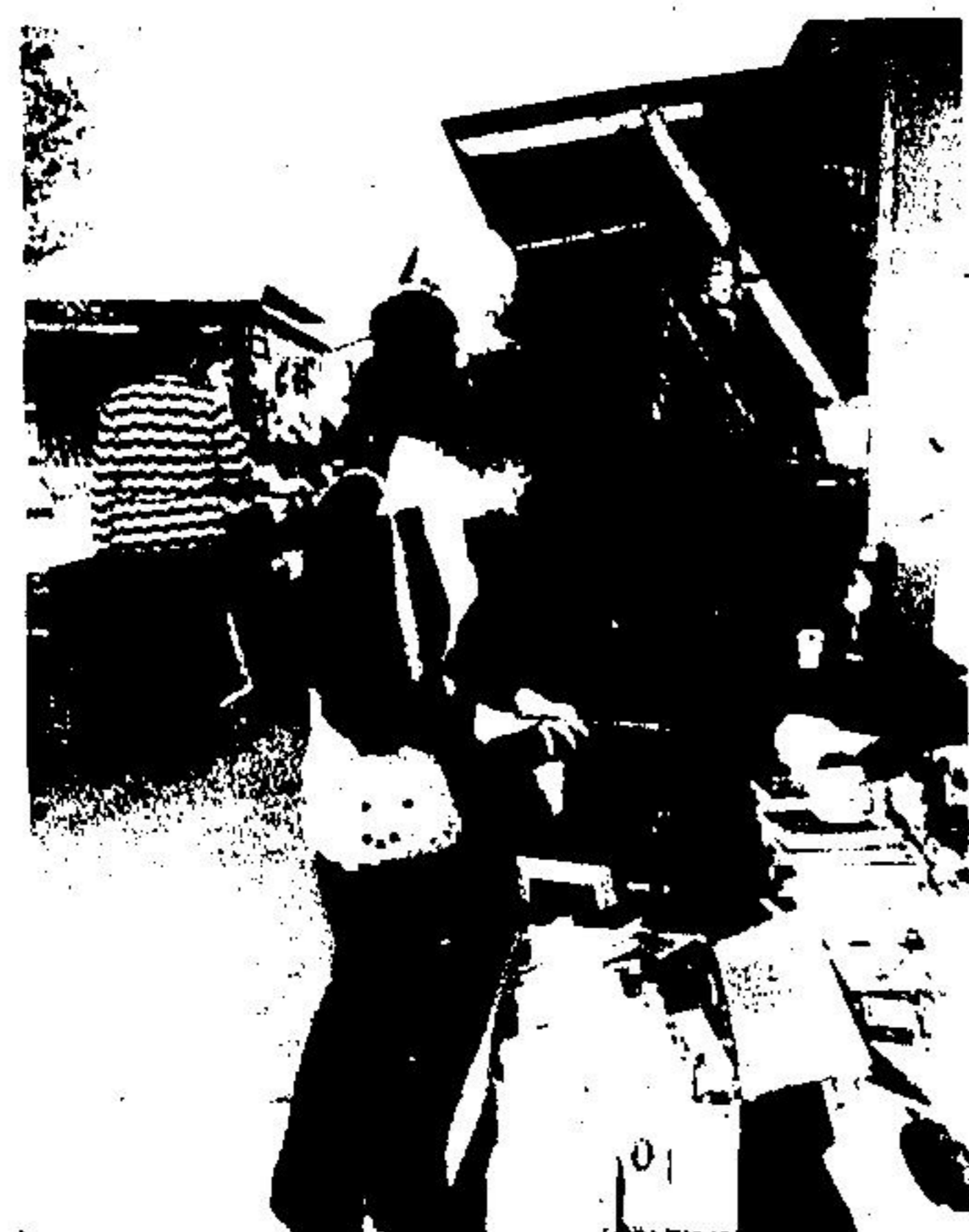
Looks like she's found something interesting in that old pile of books and records.