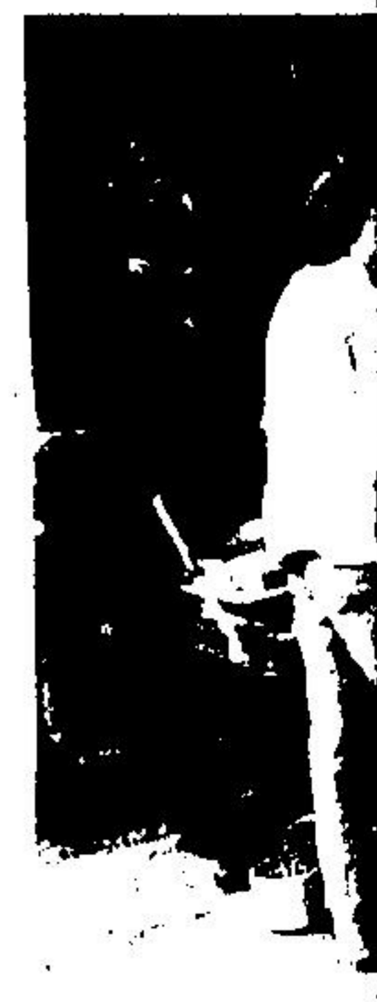
Fresh fruit and vegetables