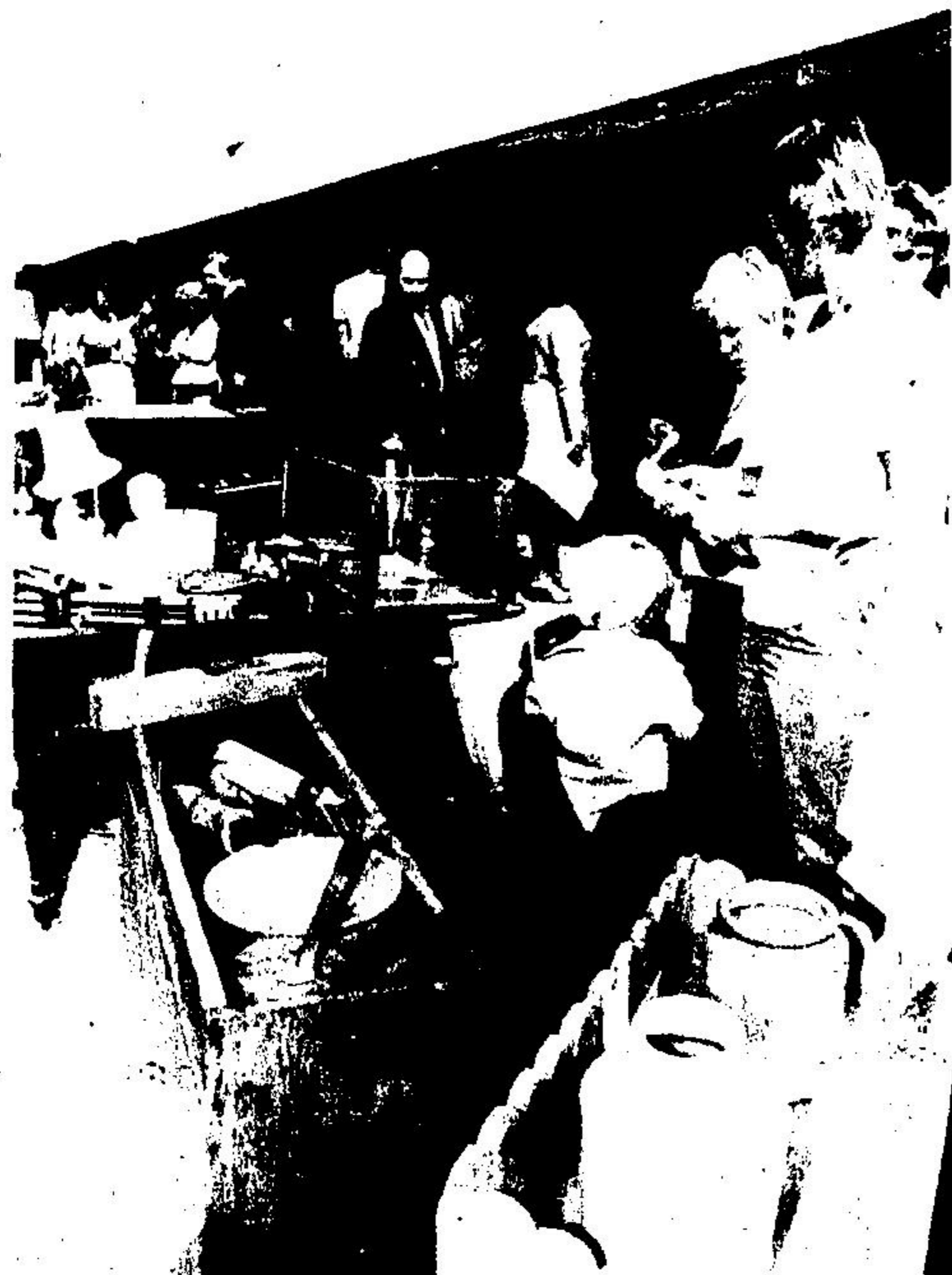
The kids enjoy an afternoon at the market hunting amid the old treasures.