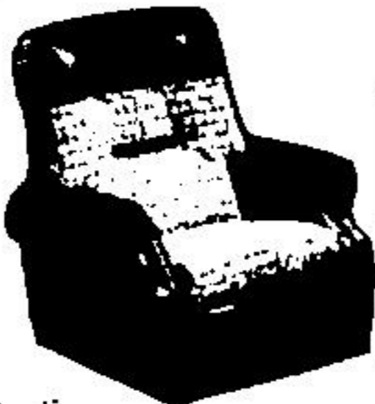
Model 605 WH 3 position Recliner