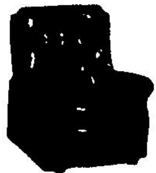
Model 620 WH 3 position Recliner