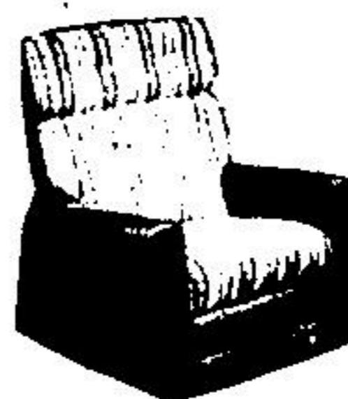
Model 645 WH 3 position Recliner