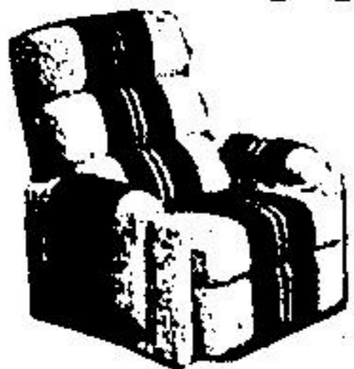
Model 870 RCL 3 position Recliner