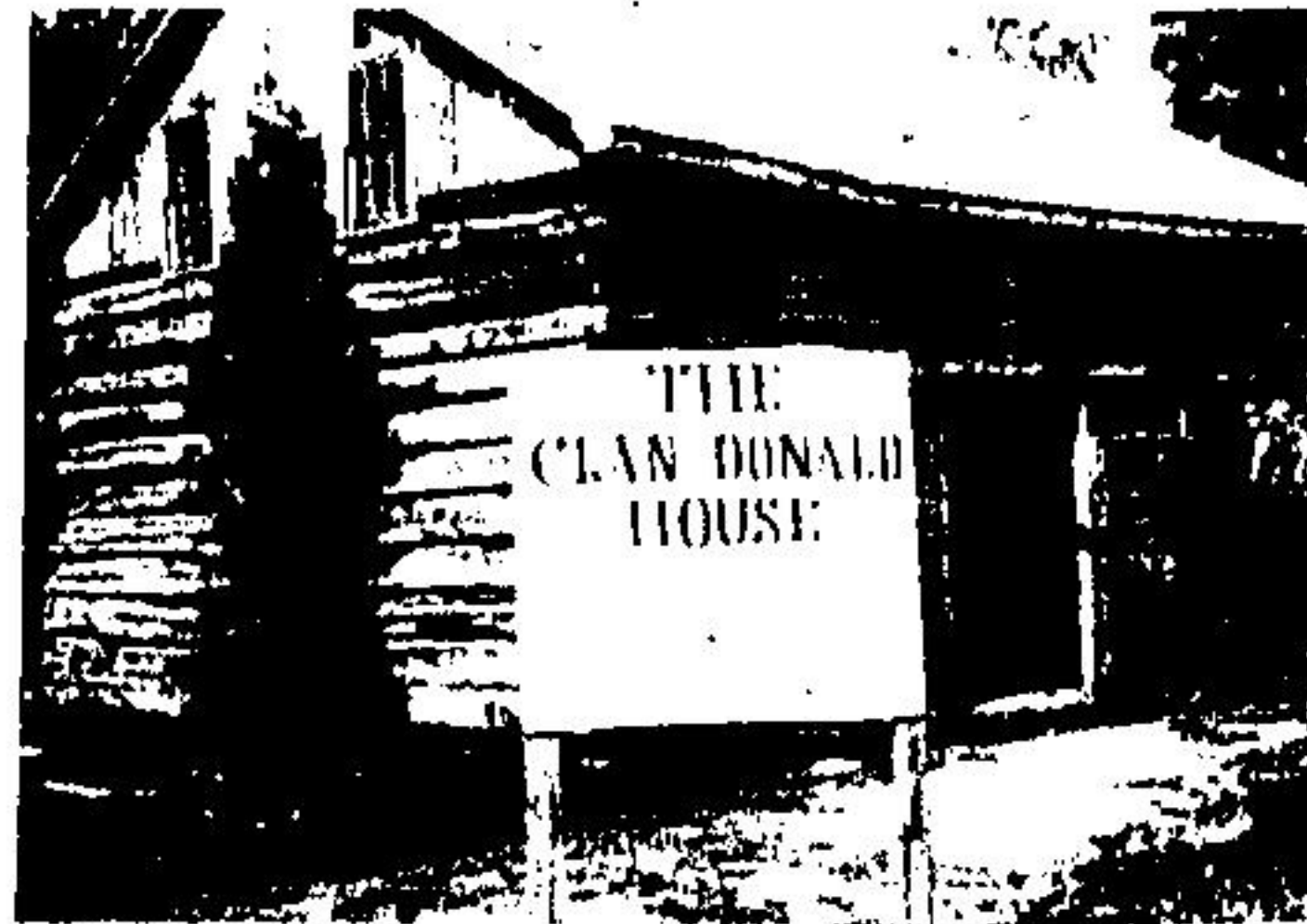
CLAN DONALD HOUSE 1850. Being erected by the Grand River Branch of the Clan Donald Society of Canada. From Puslinch Township, on the Currie farm, restoration represents an early pioneer Scottish home.