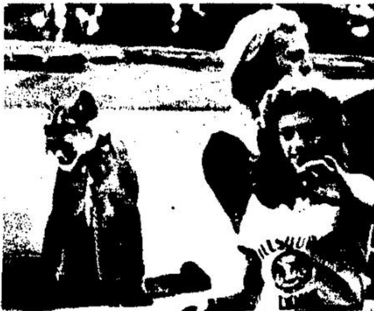
ONE OF THE parade's highlights was Bartholomew, the cougar on the Lions club float.