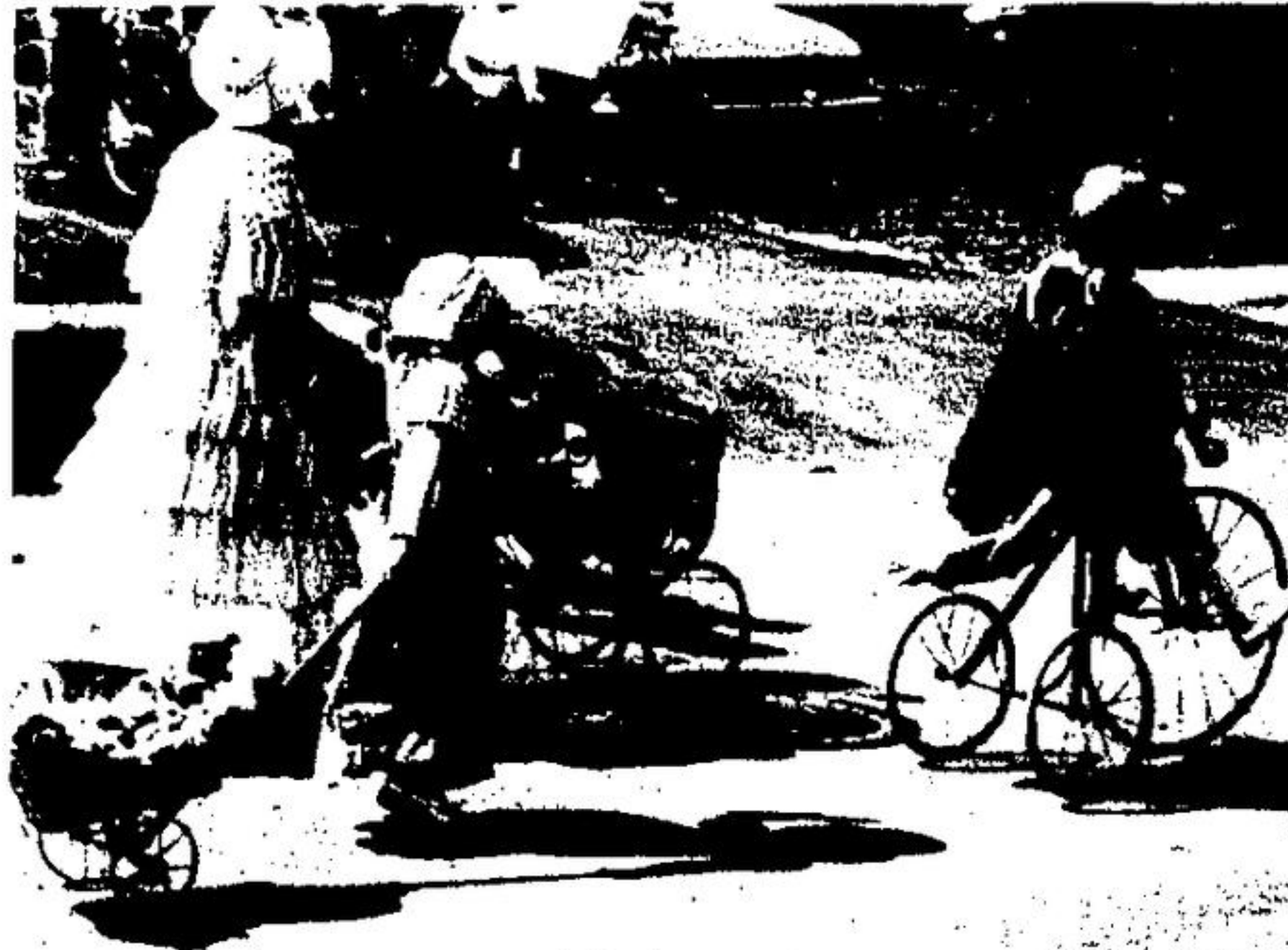
MANY ENTRIES were dressed in old-fashioned and pioneer costume at the Hillsburgh potato fest parade.