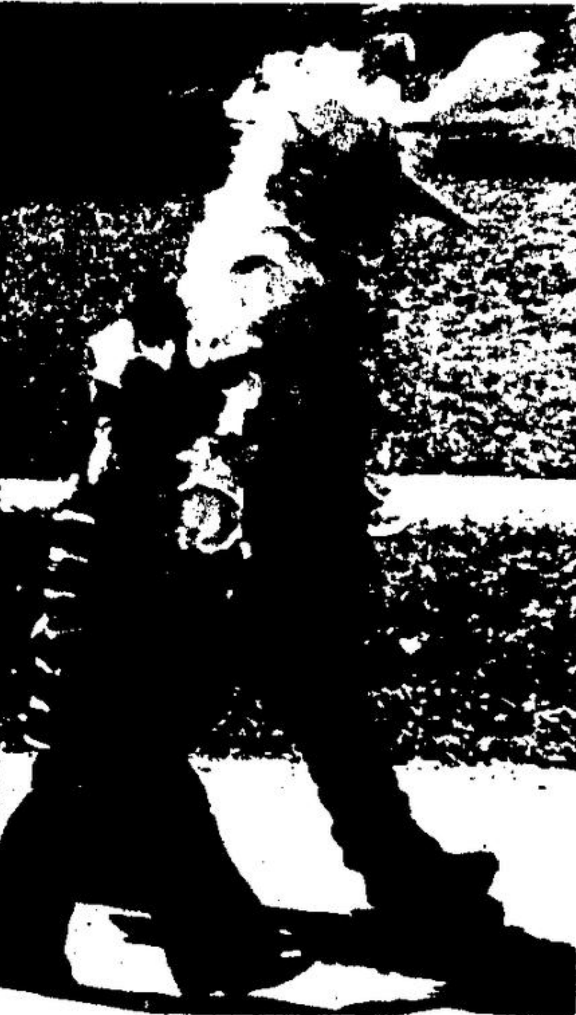
TWO FUZZY THINGS from Sesame Street joined in the Hillsburgh potato fest parade.