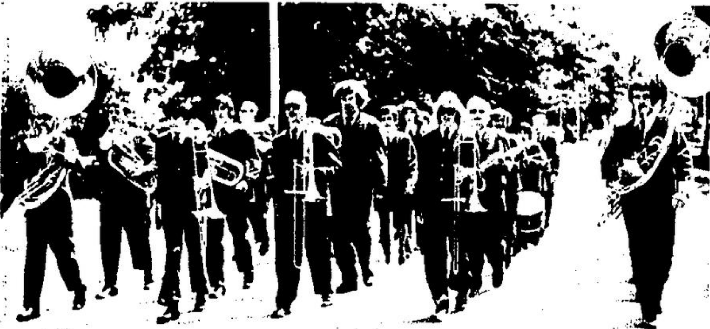
ONE OF the bands in the parade was Acton Citizens red-coated congregation. They marched Saturday afternoon in the impressive parade.