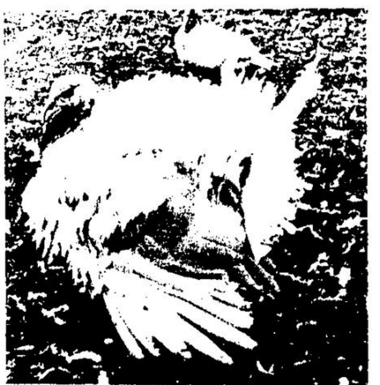
UNAWARE THAT he is being shipped to market the next day, this gobbler puts on a show for visitors. Birds like this used to disappear often till the erection of a higher fence made it difficult for passers-by to help themselves.

The Acton Free Press, Wed., September 10, 1975 B9