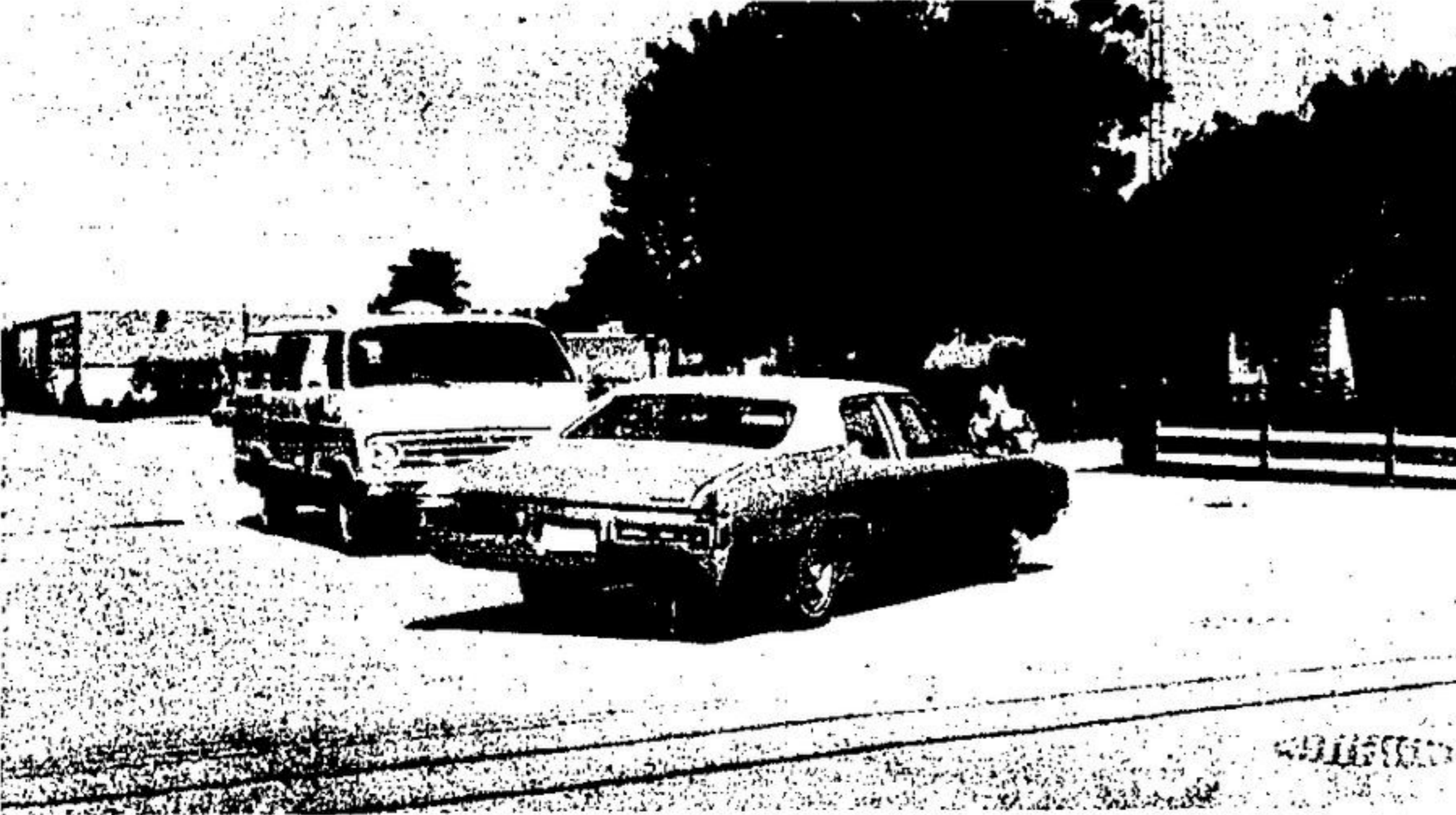
CONFUSION CORNER. The intersection of Peel and Acton Blvd. has been causing problems lately with automobile and student traffic.

Halton Hills council are taking action and erecting four way stop signs to increase the safety factor at the intersection.