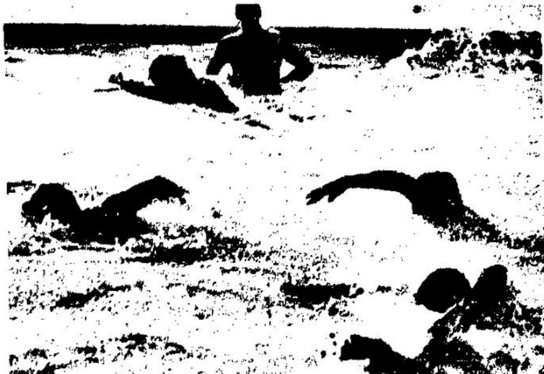
ACTON SABRES engaged in another workout at Lions' pool following dry land training. This is the first year the team trained off the ice first. Sabres will begin ice workouts in Georgetown.

On the ice training sessions will begin September 14 at Georgetown and will operate from eight to 9 p.m.