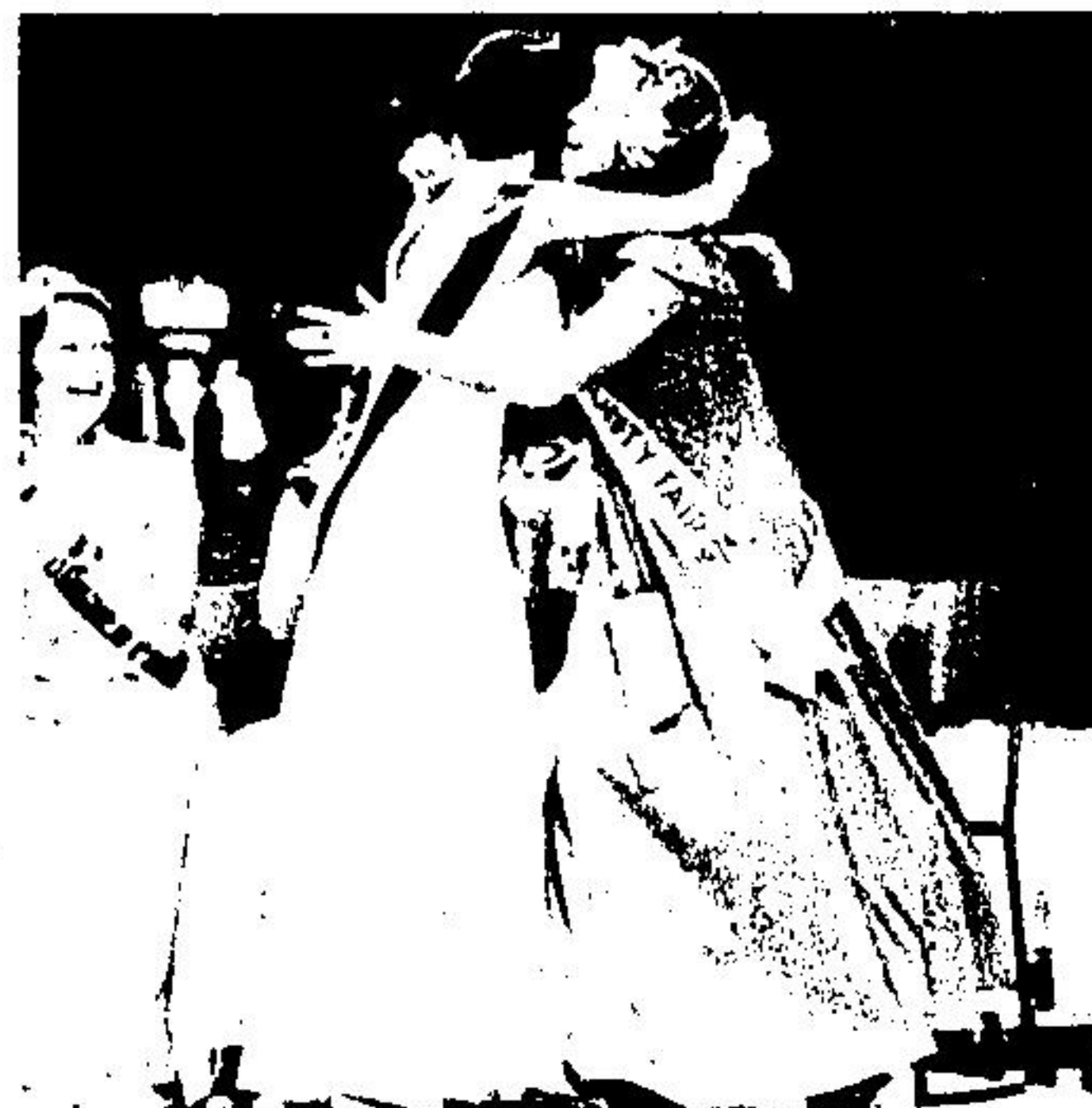
The excitement of winning Miss CNE