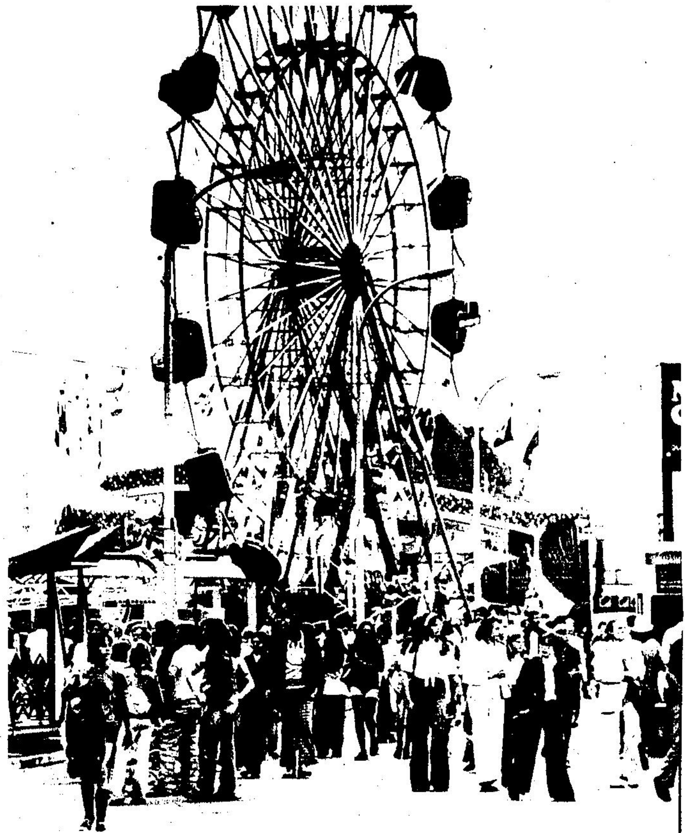
Seeing what the world of rides and games has to offer.

What the opening day of The Canadian National Exhibition had to offer.