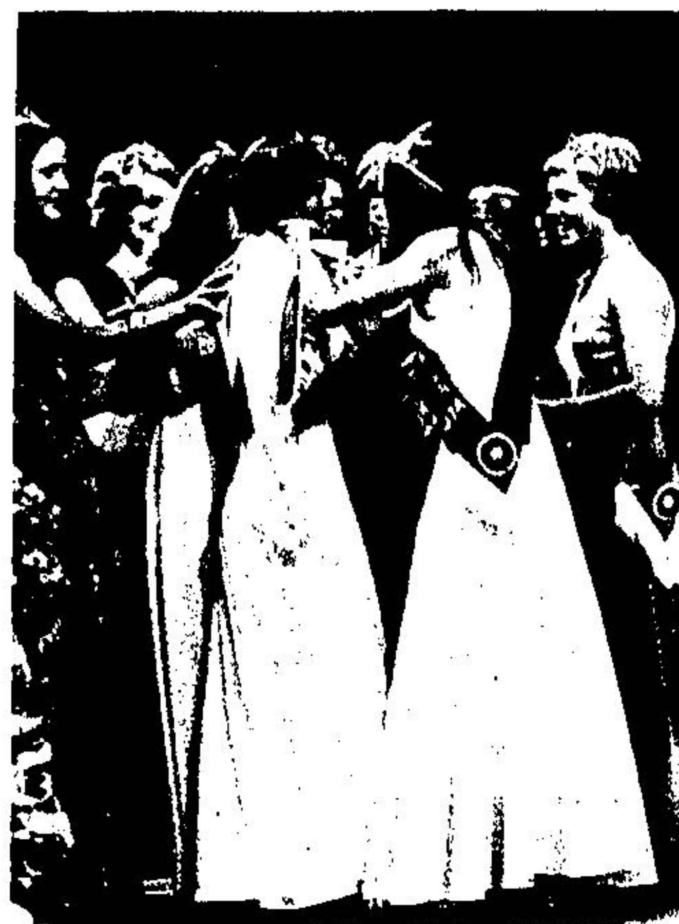
Having people make a fuss.