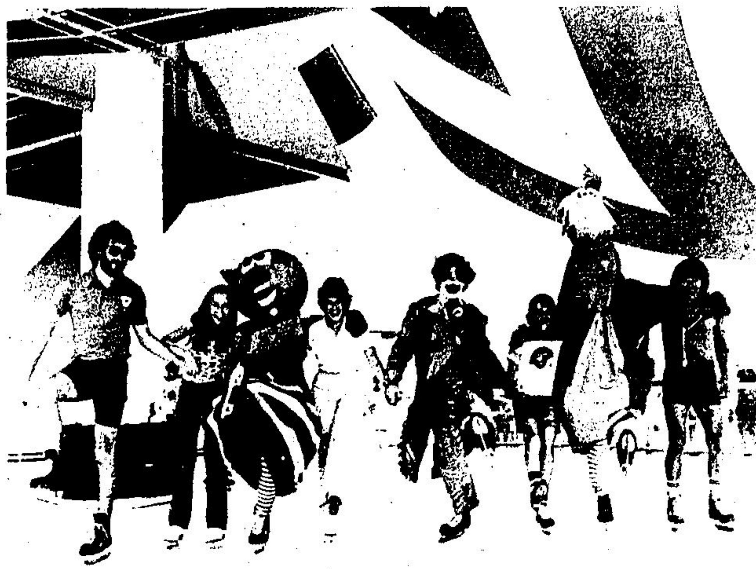
SUN SKATE, A PLASTIC SKATING RINK, OPENS AUG. 12