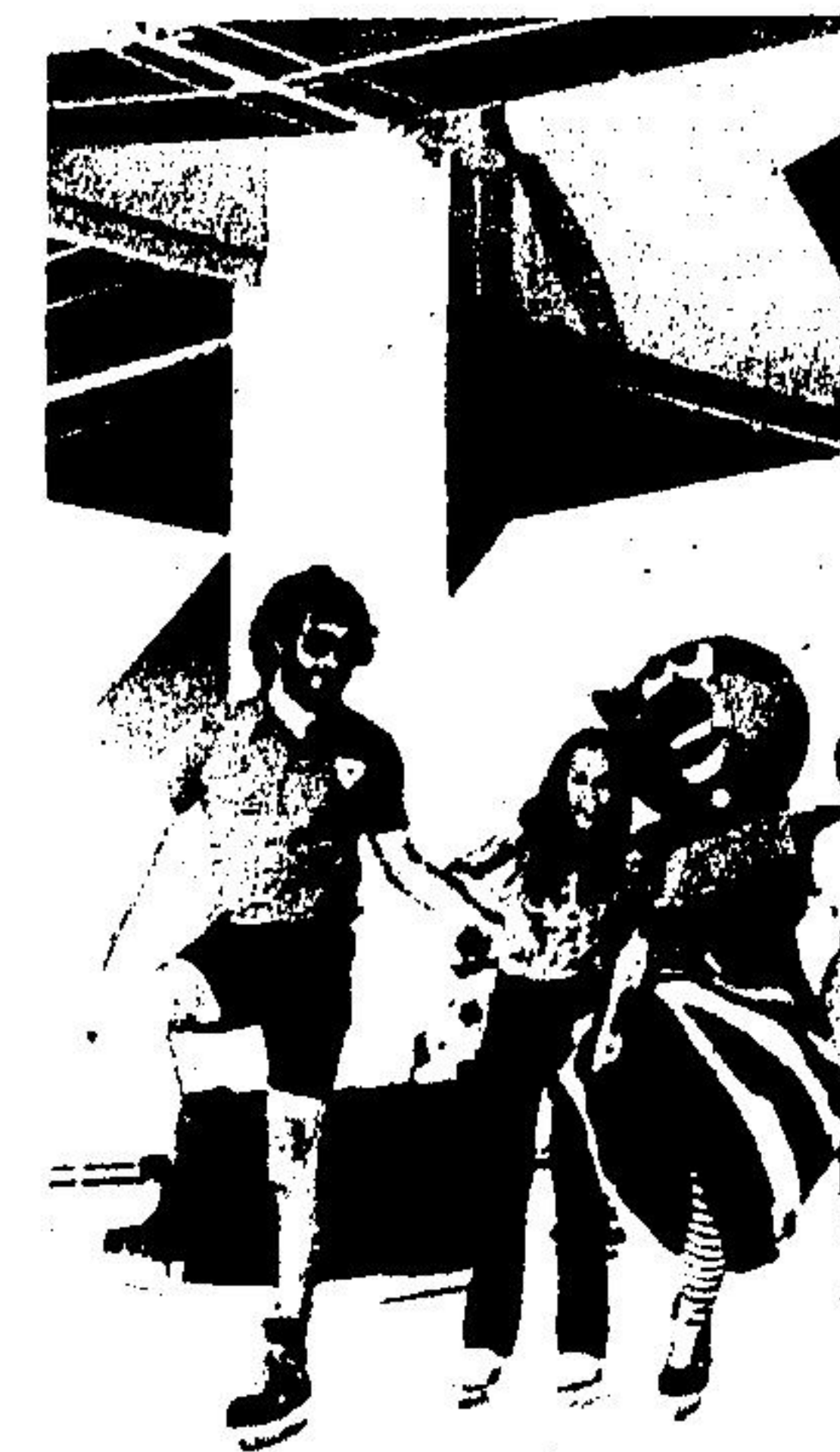
SUN SKATE, A PLASTIC SKATING RINK.