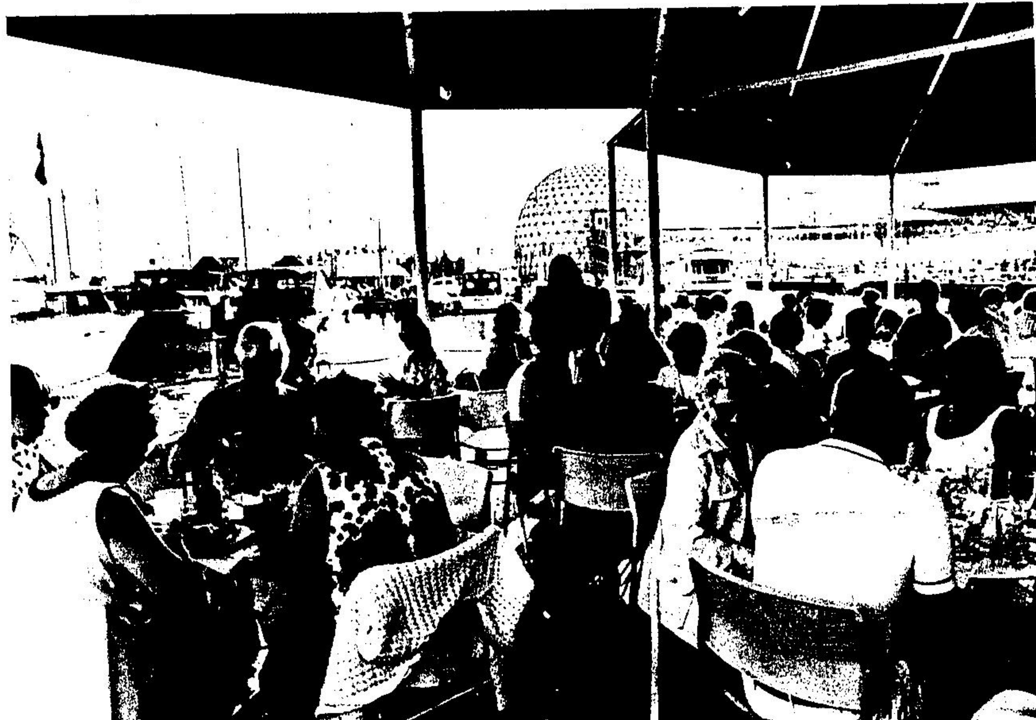
AN OPEN AIR RESTAURANT BESIDE THE PICTURESQUE MARINA AT ONTARIO PLACE.