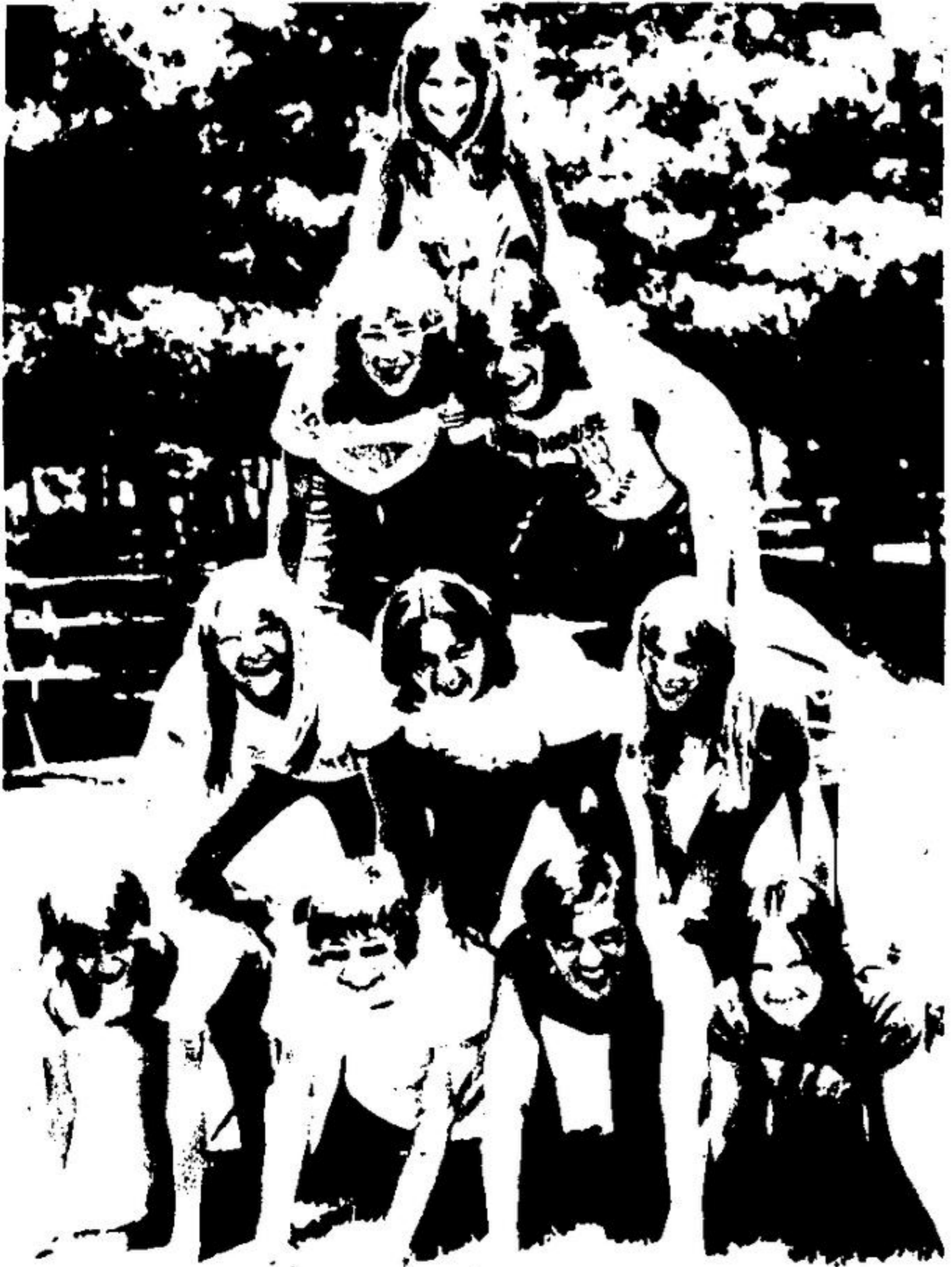
FRIENDS OF several years standing portray a human pyramid at the beachfront of Smallwood Acres last Saturday afternoon. Many of the campers are old-timers at the camp who have been making the Fairy Lake site their special summer headquarters for 13 years since it was first started.