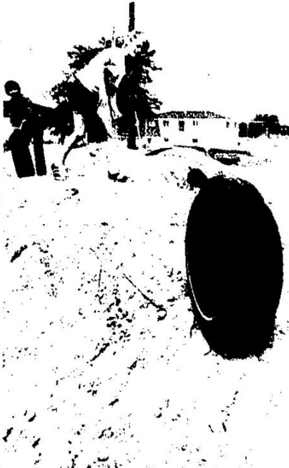
ROLLING TIRES down the dirt hills at the creative playground Grant Clarke let 'em fly. This one happened to knock over the ten speed bike of Vincent Lee.