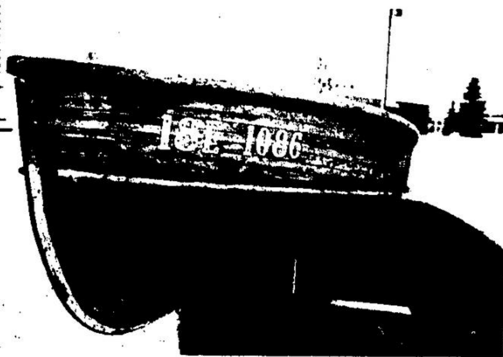
A MOTORBOAT which has long been retired from service serves the child's imagination in the creative playground at M. Z. Bennett school. The spacious grassy field could be used as a lake. Couldn't it?