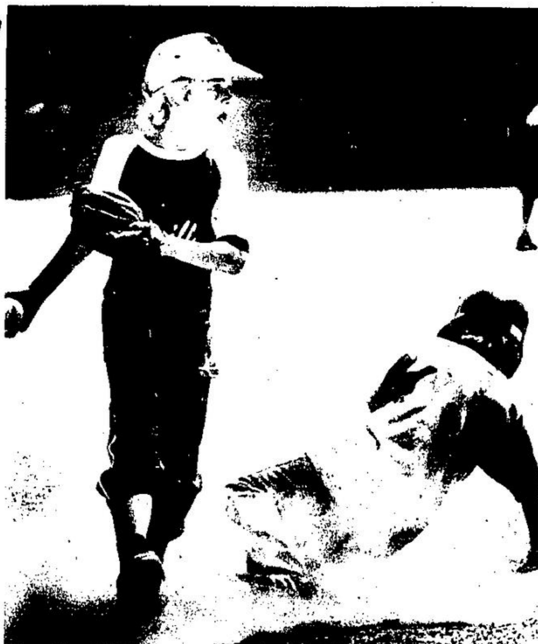
TEAMS OF THE ACTON rural minor softball Association are in gear for playoffs. Atoms begin their playoffs next week and another Acton minor team have a bye into the finals. Acton player slides to third base as Lowville player watches the play with ball in hand.