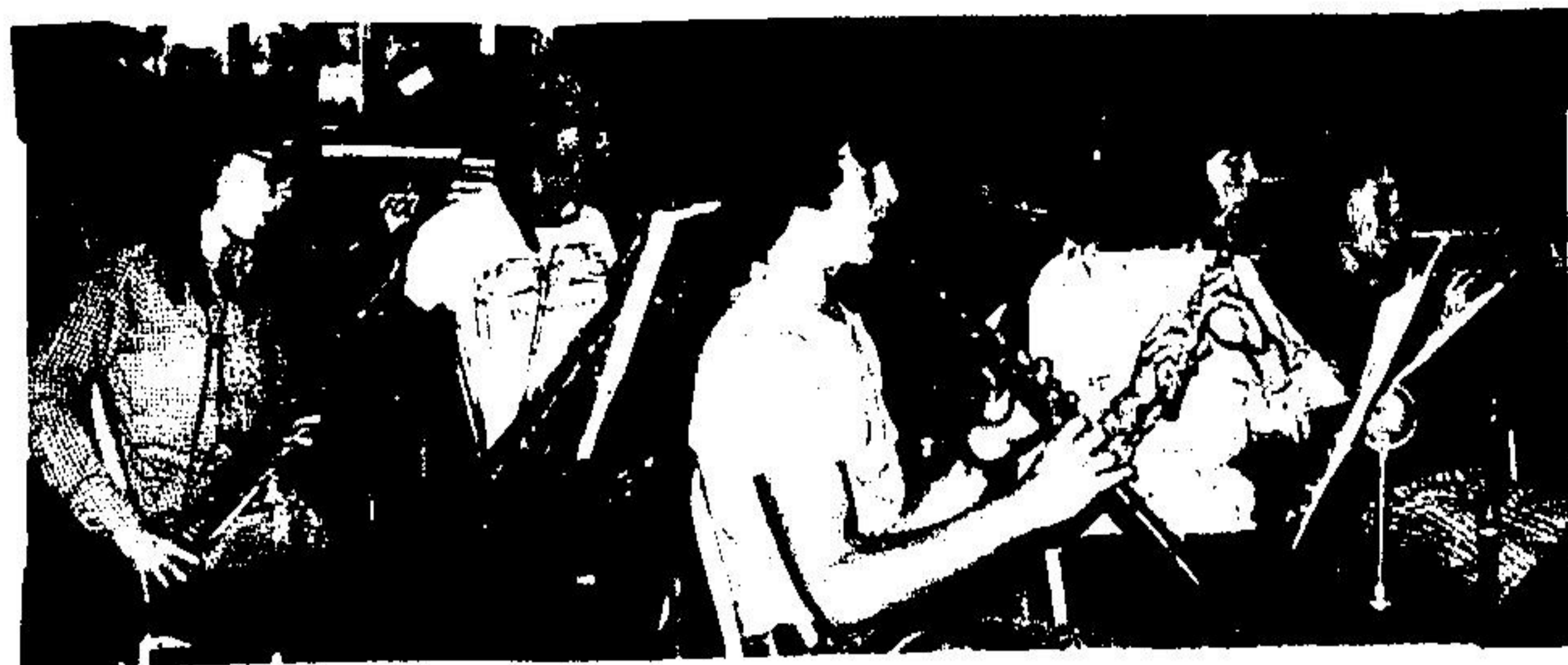
Acton's Children's Band participants do their thing.