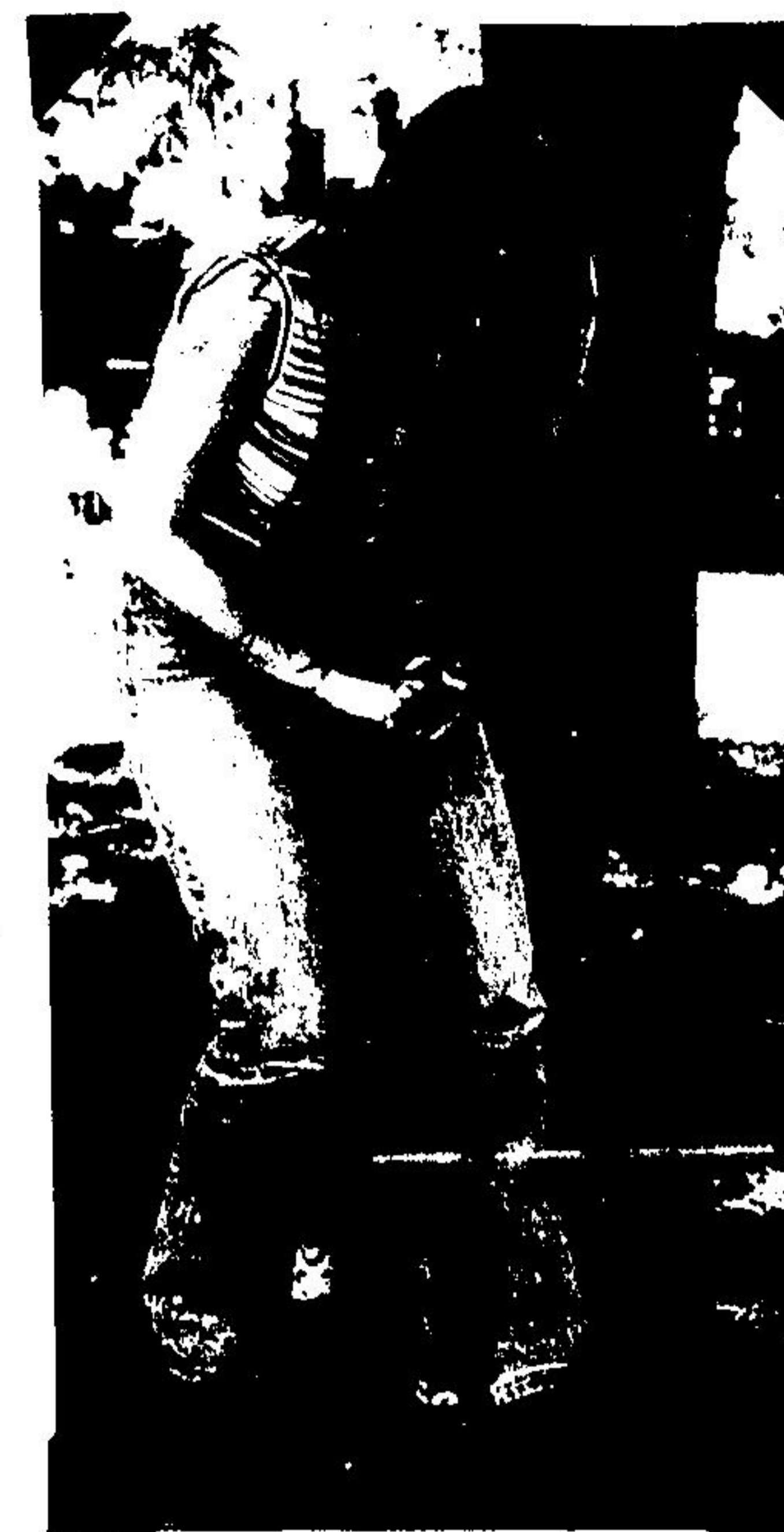
S.C.A.P. worker digs a flower bed.