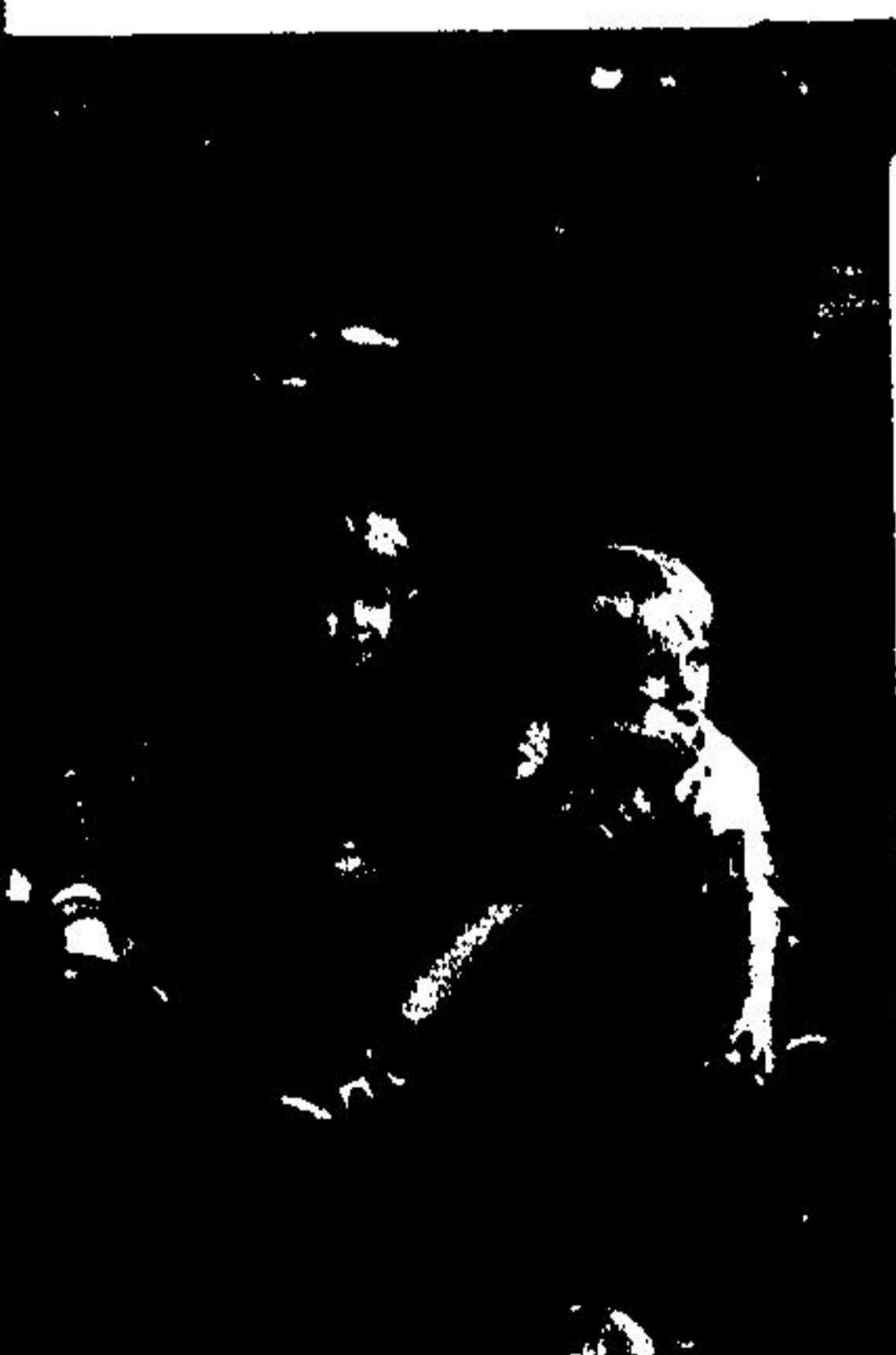
in C.A.P. '75.