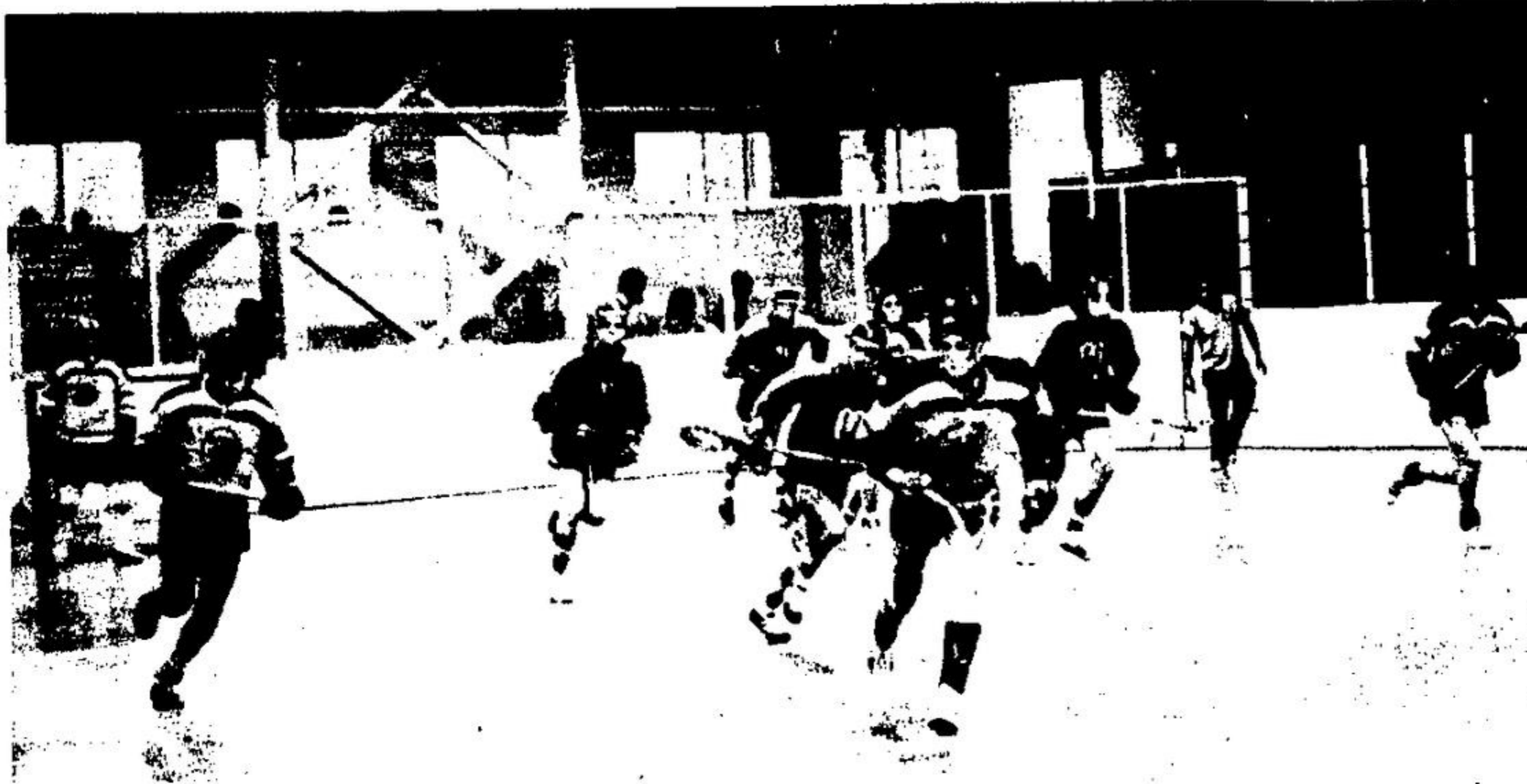
HALTON HILLS RAMS return to the Acton Community Centre to play out the remainder of their regular season schedule. Rams still have a chance of making the final spot for the playoffs with four games to play.

In a smashing home town debut, the Halton Hills Rams romped over the Owen Sound Satellites 11-8 to please their 218 fans attending the game in the refurbished Acton Community Centre.