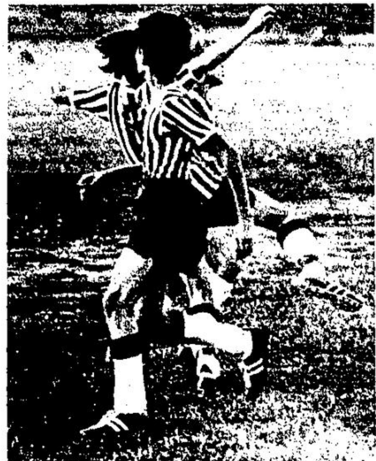
THE PELE PRANCE or another new dance craze? Acton peewees of the Halton and Peel inter-district soccer league seem to be having difficulty getting their bearings in a game against Pineview last Thursday. Acton went on to win, however, 5-3.