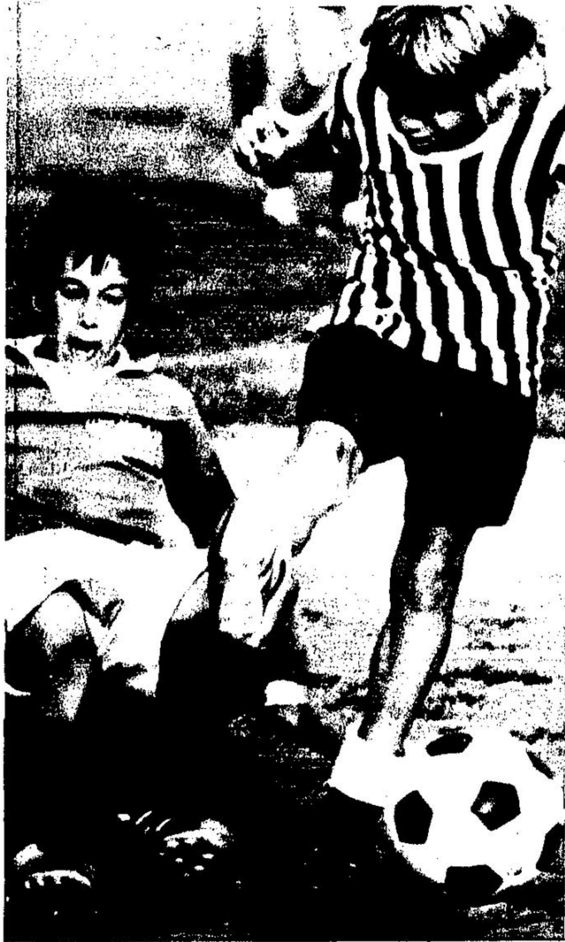
ACTON ATOMS A put up a tough fight in the second round of Ontario Cup Soccer championship play but fell to Burlington 7-0. The Acton team ousted London in the first round of play. The Ontario cup game was played at the Acton High School soccer field last Saturday evening.

BAZ MOTORS LTD. VOLKSWAGEN - PORSCHE - AUDI - HONDA Sales and Service 199 Guilph St., Georgetown 877-5286 or 676-1813