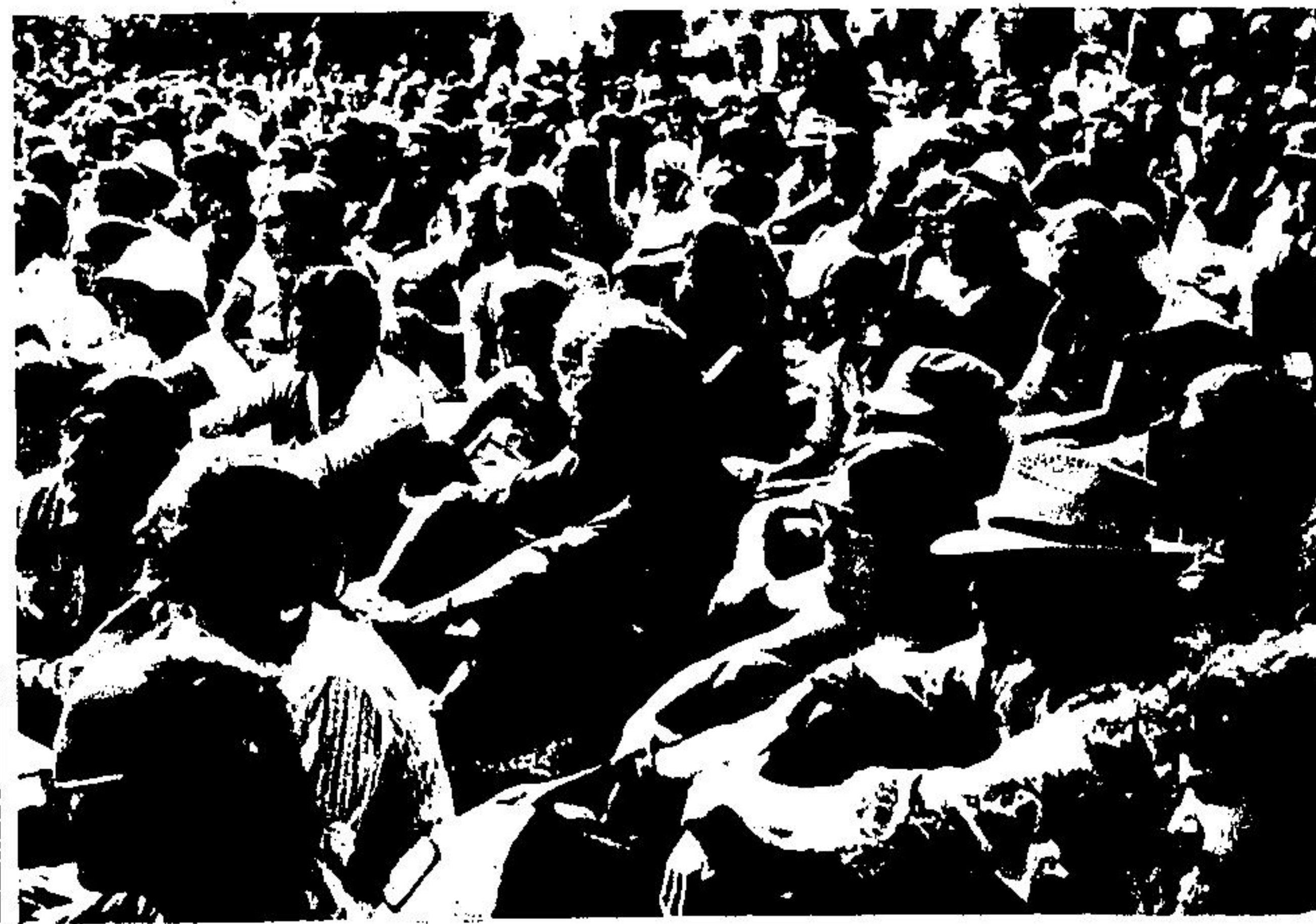
Performers draw crowds to six stages