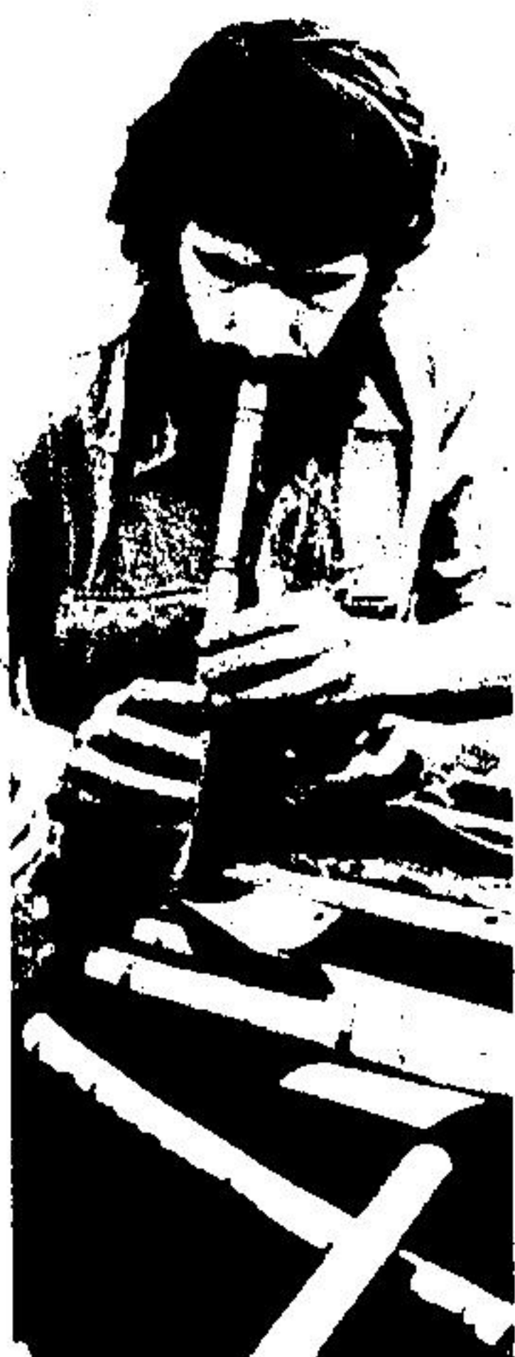
Flute maker performs