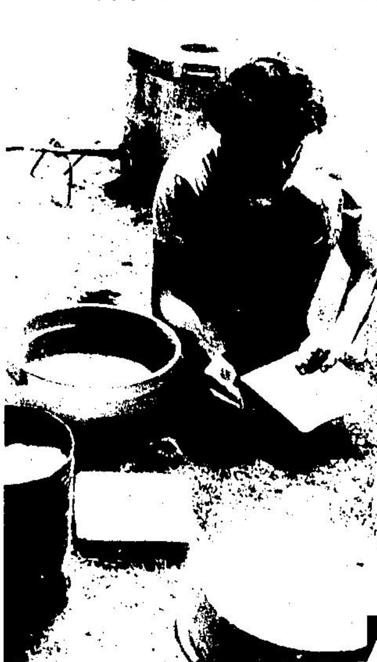
Pottery and crafts