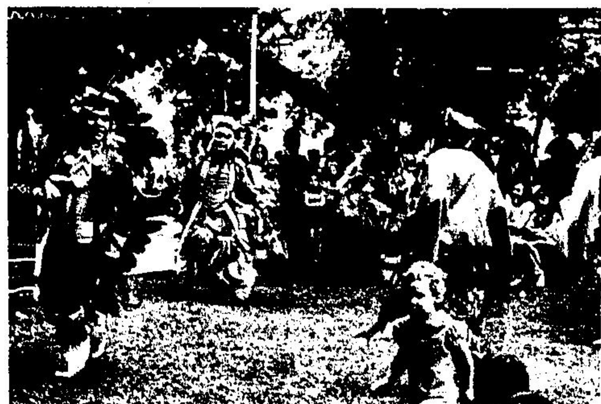
Bird Dance by Native Peoples