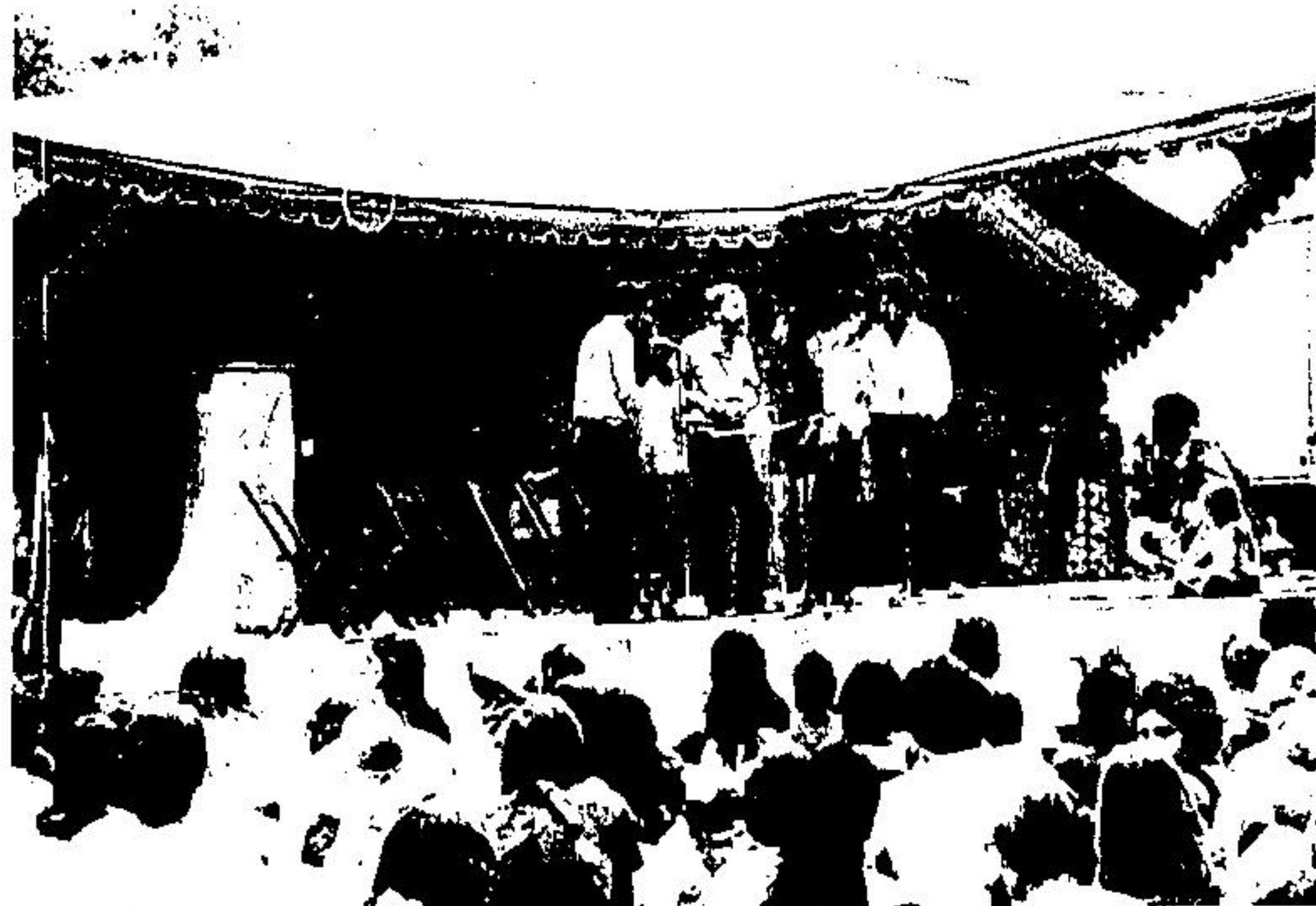
Audience enjoys familiar music by well-known performers

Spirit of the festival was one of camaraderie as whole families congregated and young and old of multi-backgrounds mingled in a phenomenal display of brotherhood and goodwill.