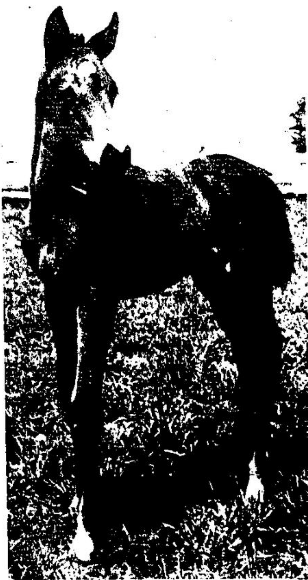
"BARCREST" - the first foal at Barcrest Farms in Milton surveys his 200-acre domain. When construction of stables and indoor arena is complete the farm will house 75 of the best show horses in Ontario.