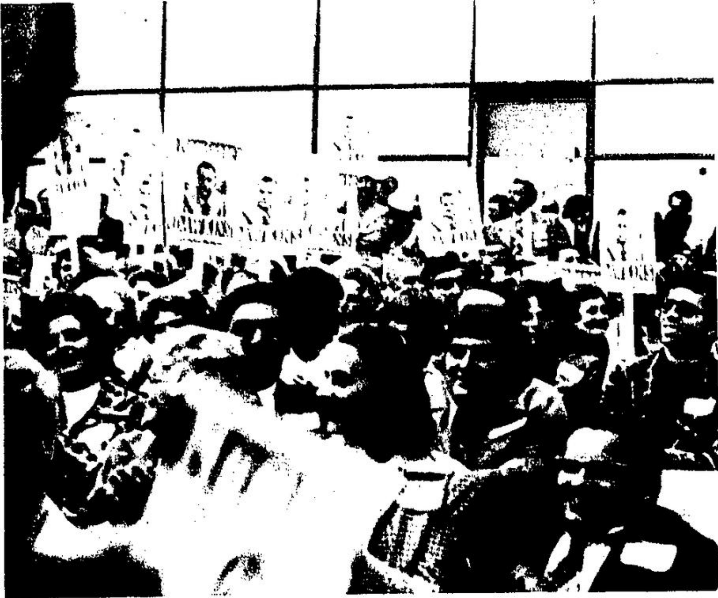
MORE THAN 600 people packed the auditorium at the Ernest C. Drury school Thursday night for the Progressive Conservative nomination meeting.