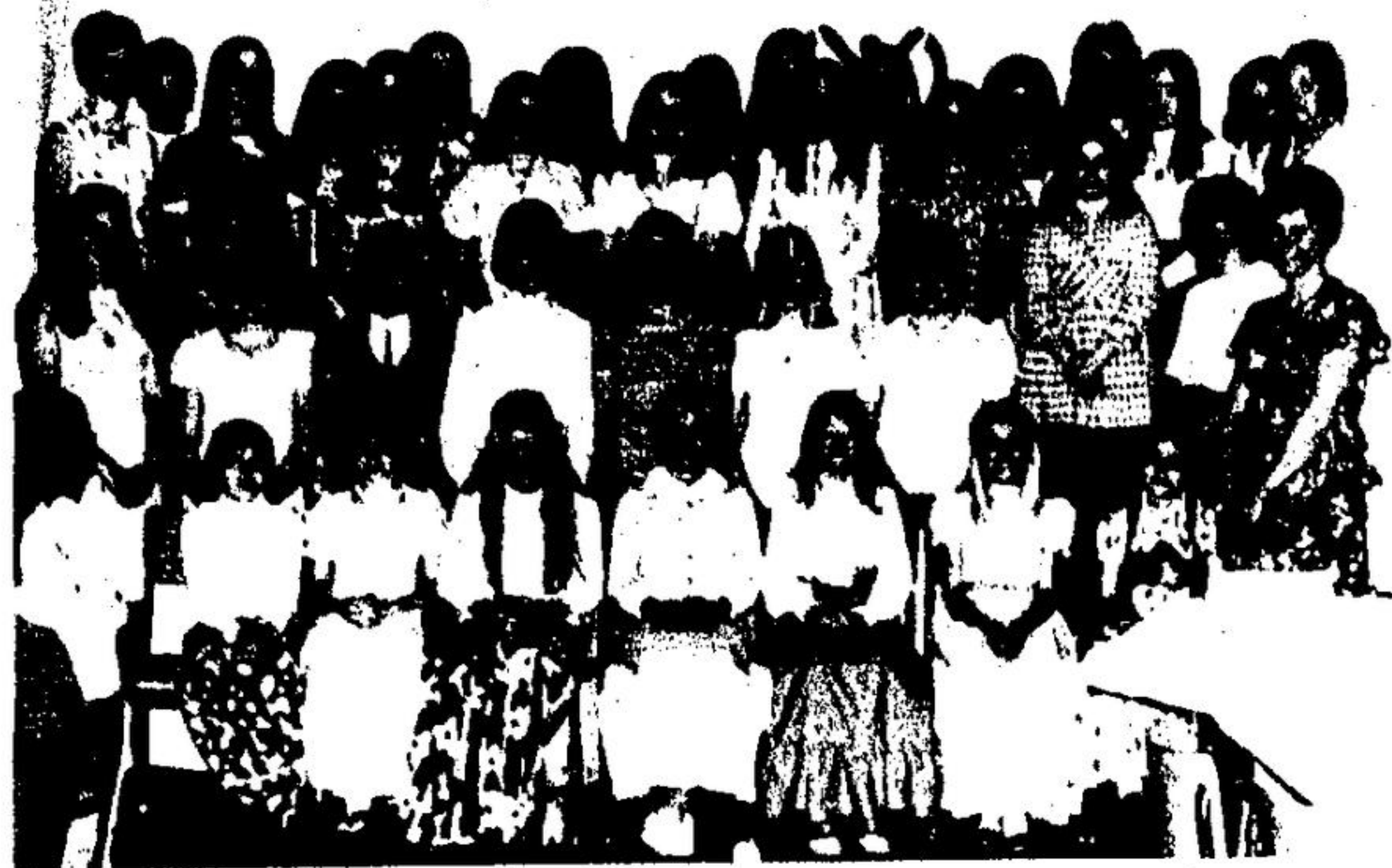
CALVINETTES HELD their annual mother and daughter banquet Friday evening in the basement of Beth-El Christian Reformed

church. The girls put on skits, dancing and singing for their proud mothers.