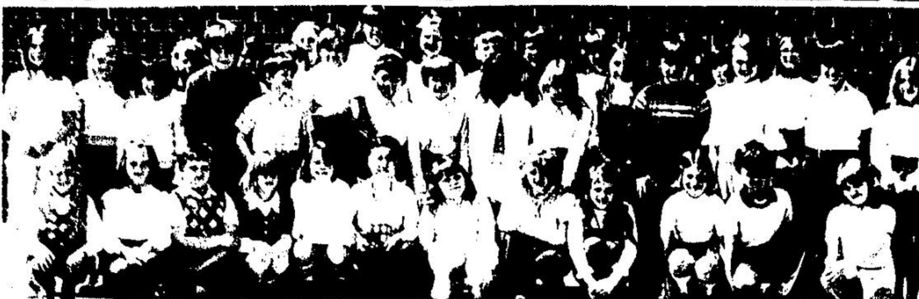
ROBERT LITTLE SCHOOL entry in the Class 2, Junior Choir division at the North Halton Music Festival held at M. Z. Bennett on May 7 won first prize. The