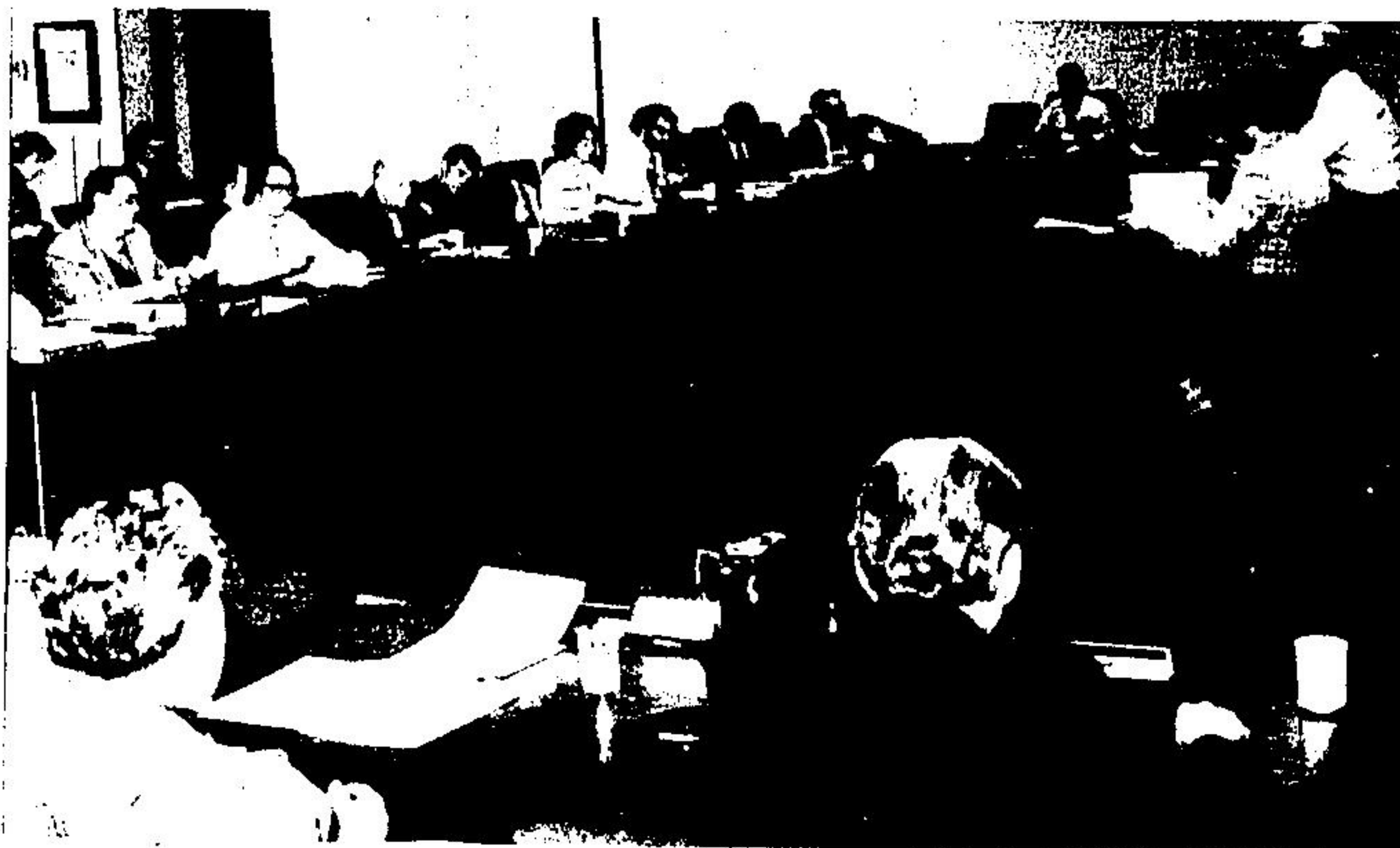
ACTIONS OF THE REGIONAL staffers are guided by Halton Region's 25 person council. Councillors meet twice a month in regular council and twice a month in committees to formulate policy for the region.

museum is situated at Kelso Conservation area.