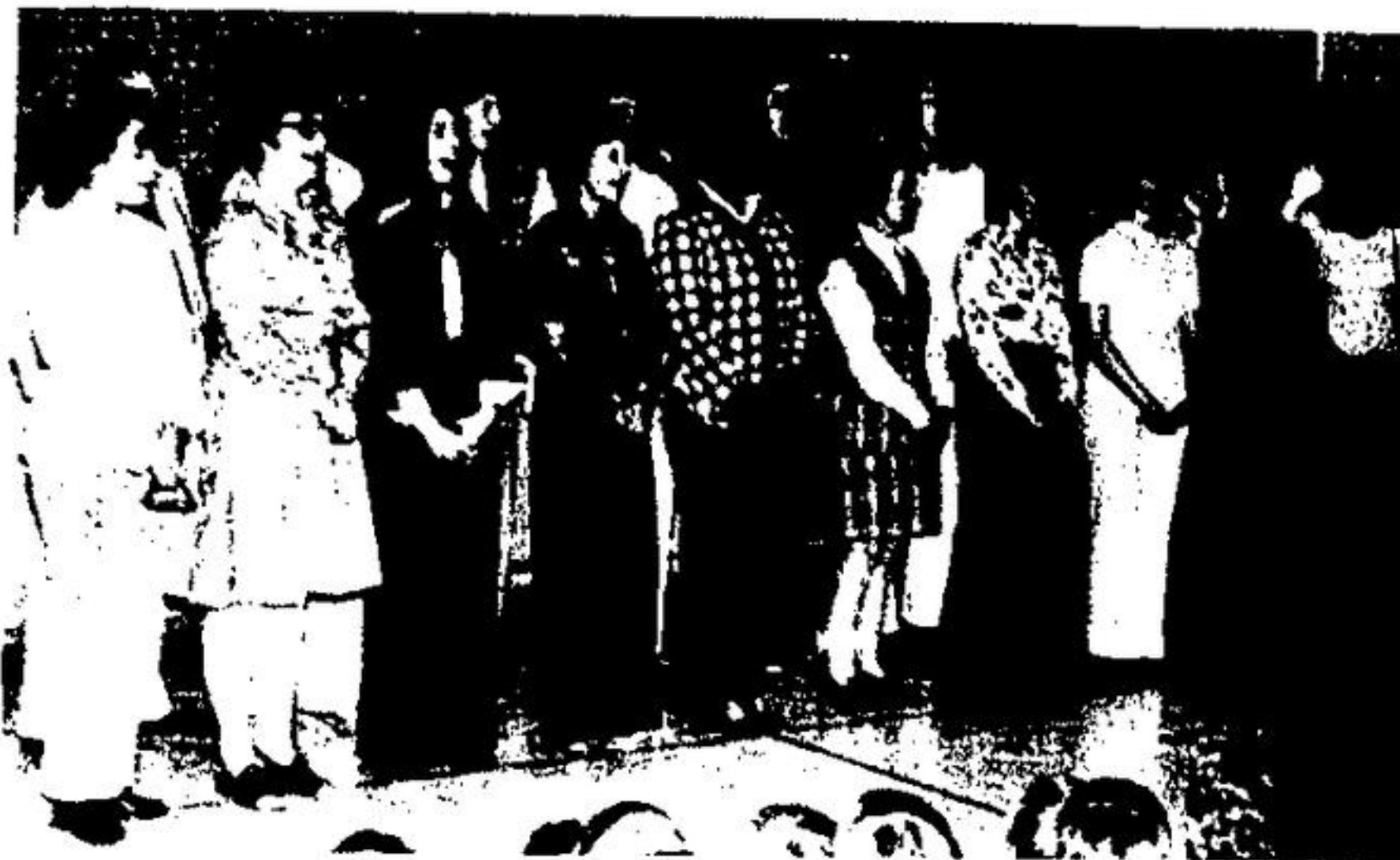
AFTER SCHOOL choirs rehearsed for the music festival, a surprise entry delighted M.Z. Bennett students Friday. Singers were the entire staff.