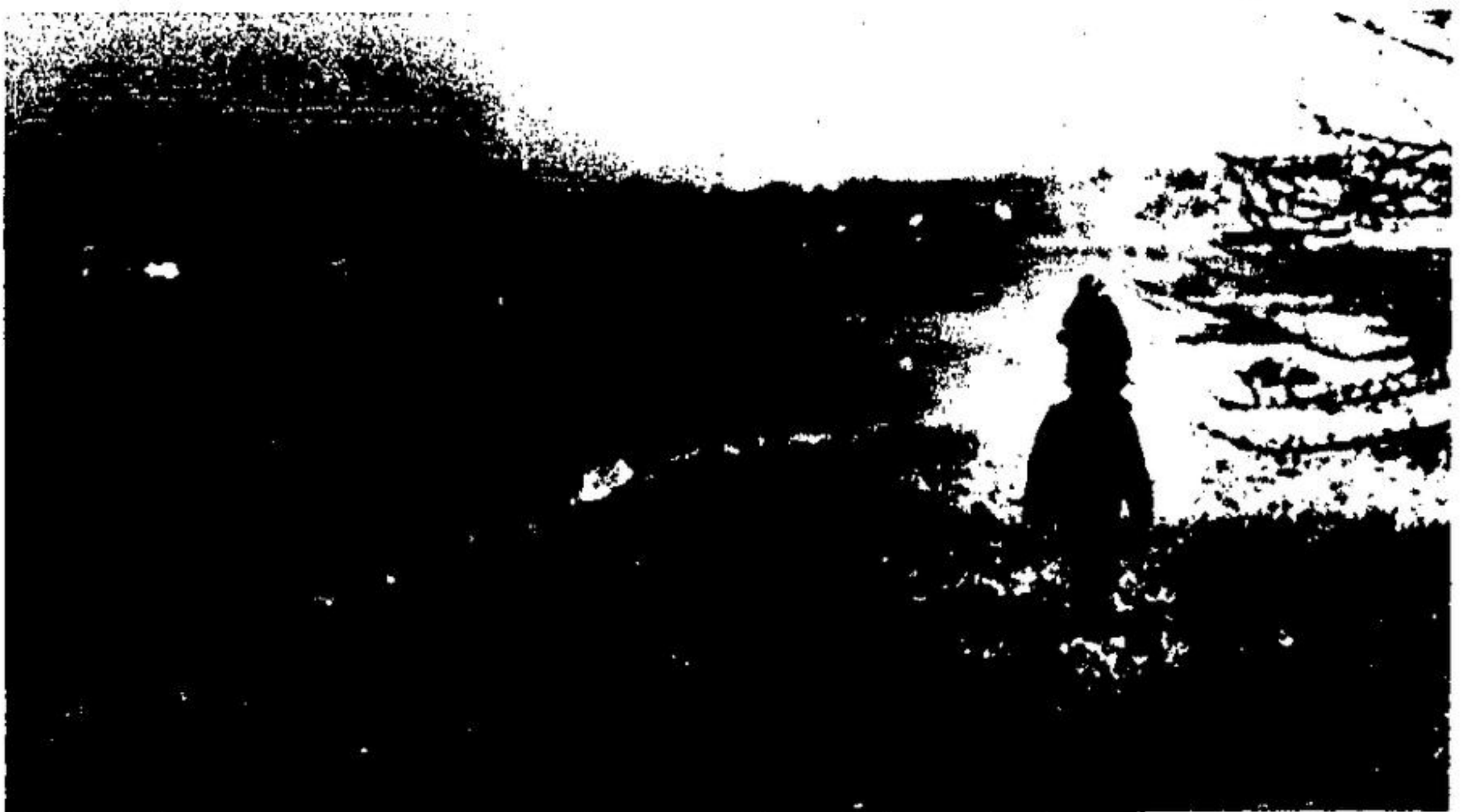
SMOKE COULD BE SEEN from the Lakeview subdivision (background) as Acton Volunteer Firefighters fought a grass fire on the First Line, Acton yesterday (Tuesday) at suppertime. It

Plans are still underway to locate a rest home in the former Legion hall. An application to extend the existing residential zoning is going before the Committee of Adjustment.