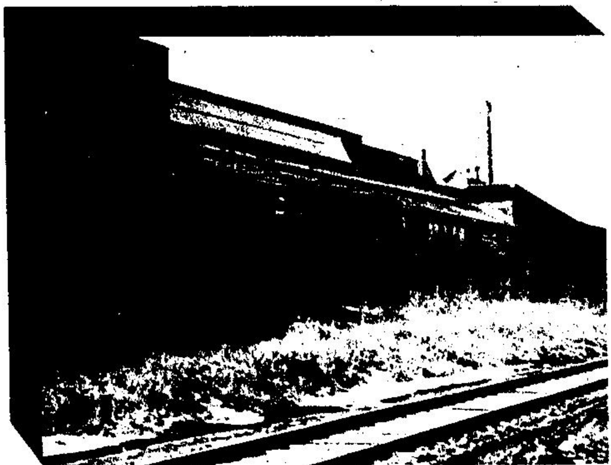
The walls of the Smith and Stone Manufacturing plant in Georgetown show signs of age.