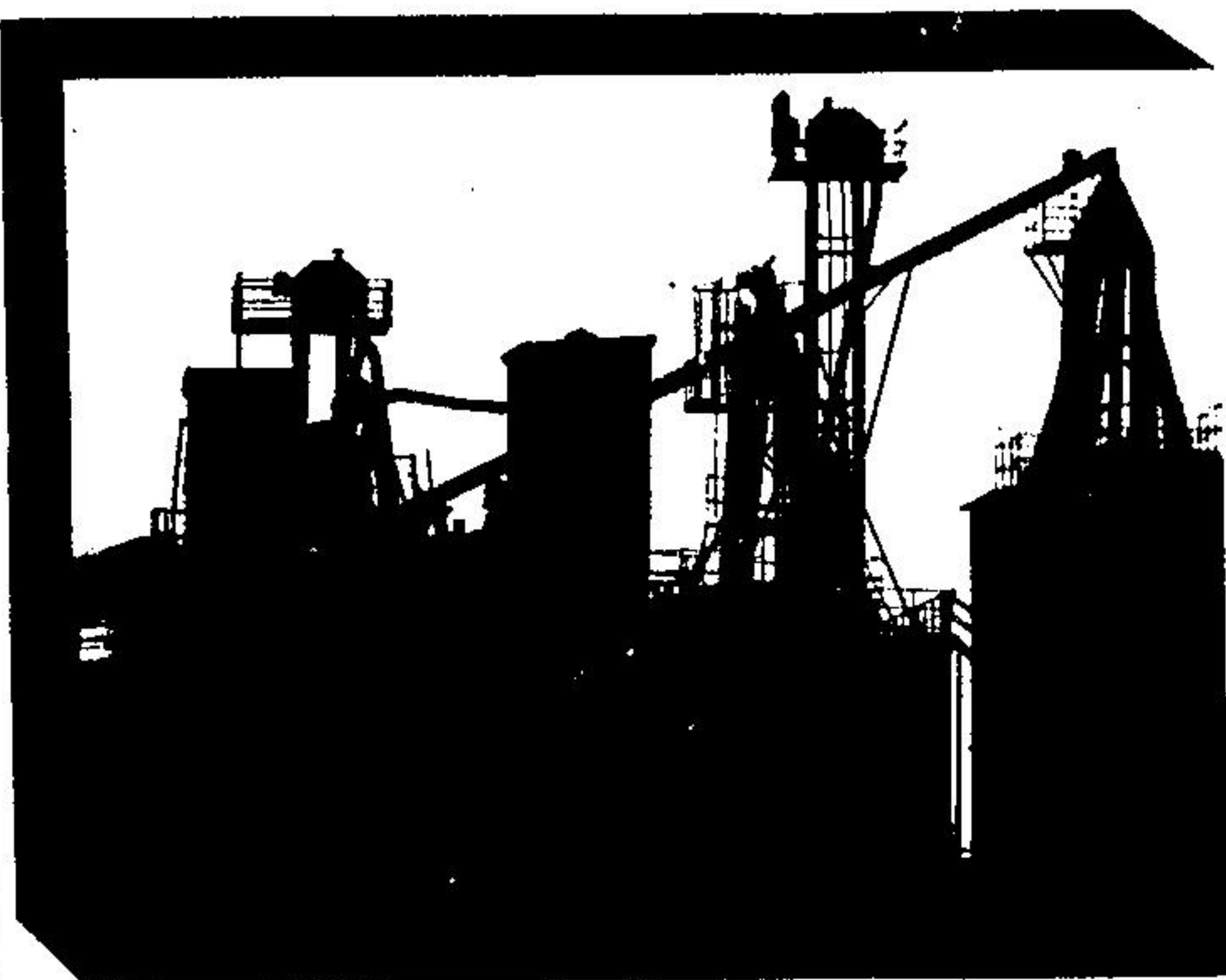
The Robin Hood Multifoods mill stands against the evening sky in Milton.