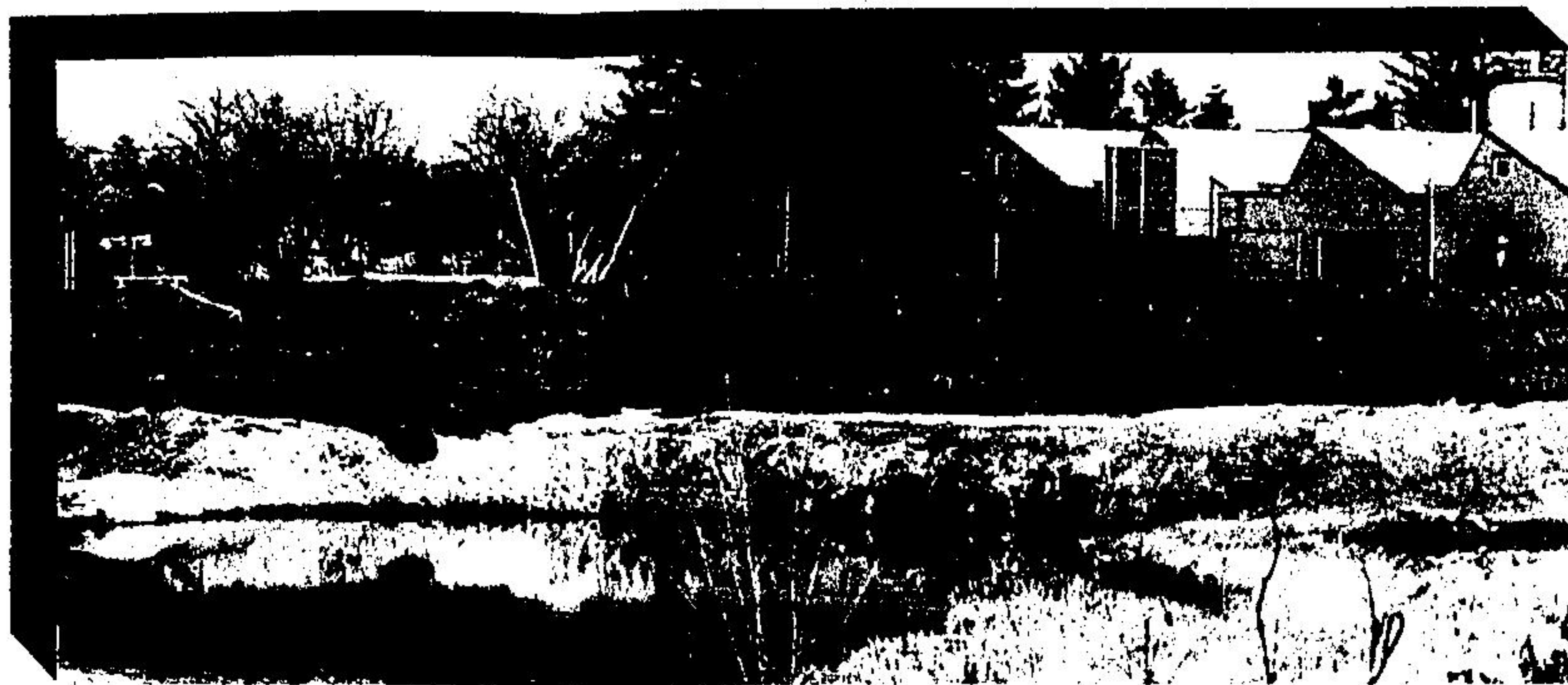
Coils of unprocessed steel cake with rust outside the P. L. Robertson Manufacturing plant in Milton.