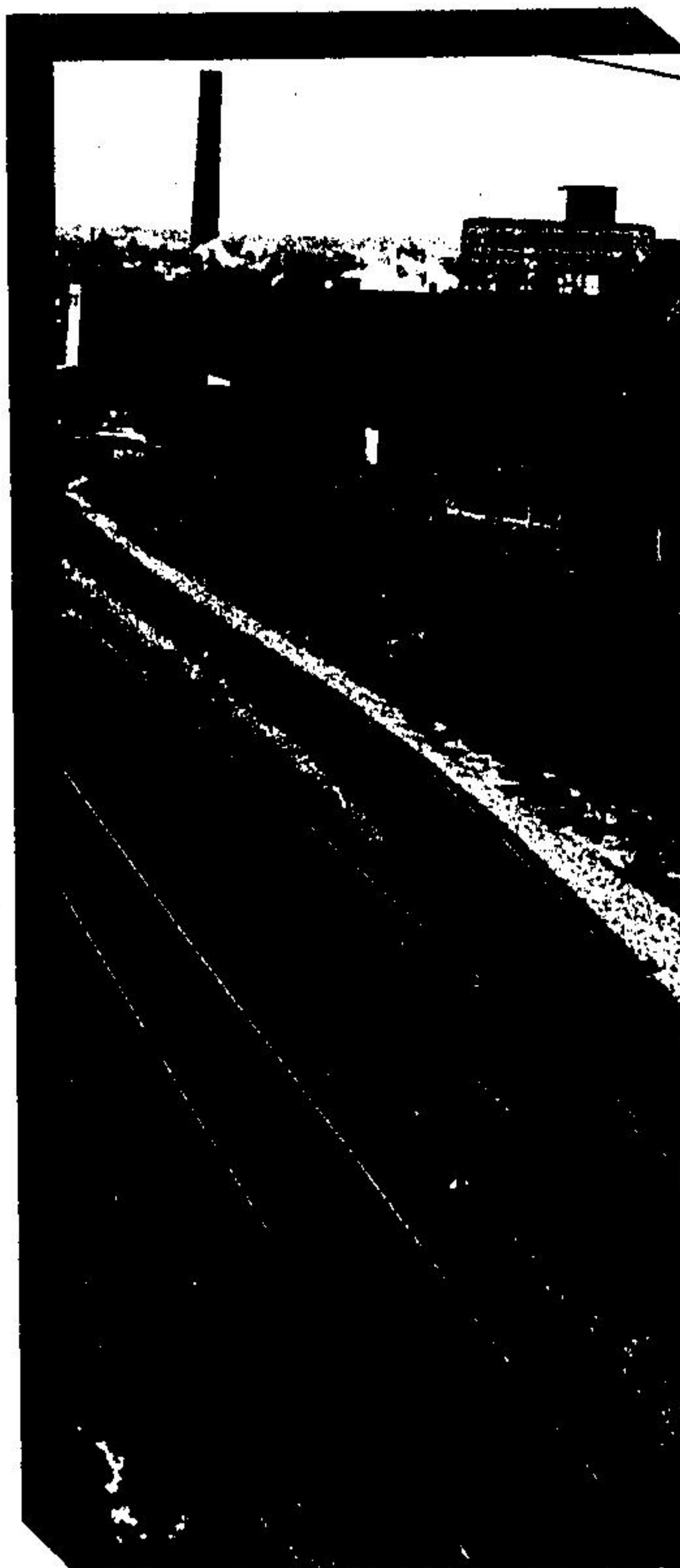
Steam and smoke rises above the factory at the Domtar paper mill in Georgetown.