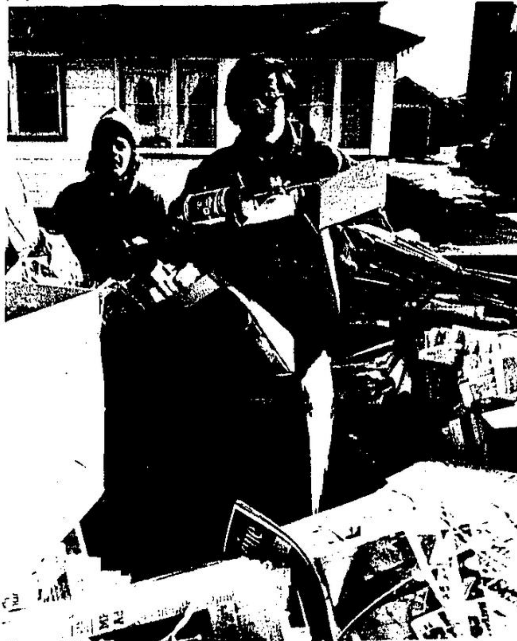
PILES OF PAPERS and bottles filled the back of a pickup Acton High School Band was using to collect. The early Saturday morning pickup is run monthly by members of the band.

ment had there was no reason for other departments to do their work for them. "These people have to learn there is more to running recreation in this town than going to meetings and sitting around working out ball schedules."