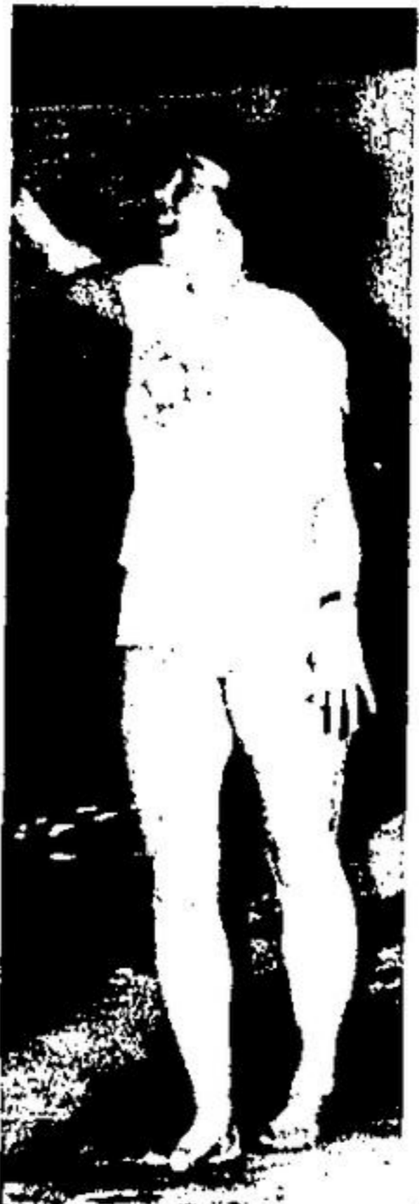
JUDI Patterson shows her synchronized swimmers one of the strokes to use for their routines.