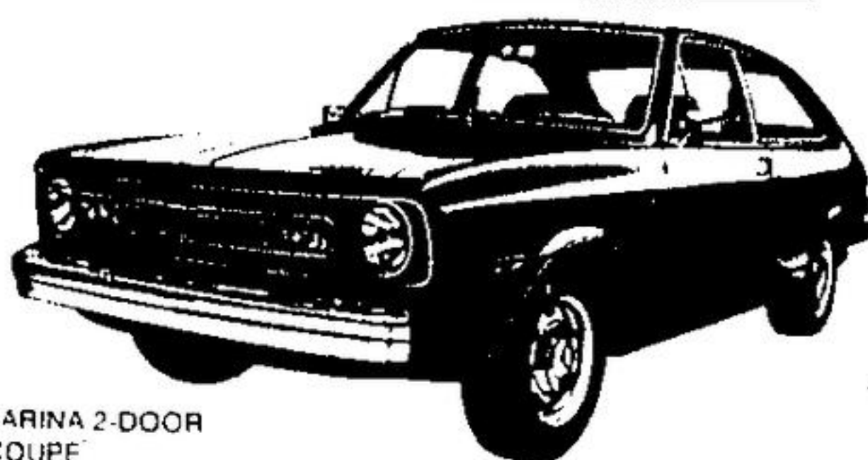
AUSTIN MARINA 2-DOOR DELUXE COUPE