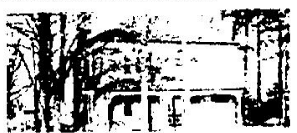
TWO IN ONE—Income property, separate entrances, near downtown location. Asking $63,900.