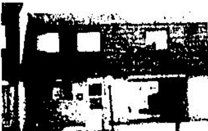
STILL UNDER WARRANTY—For only $42,500 a fantastic 4 bedroom townhouse.