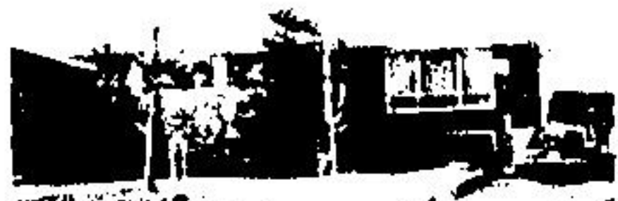
A VERY POPULAR MODEL—Raised bungalow with fabulous recreation area. $56,900.