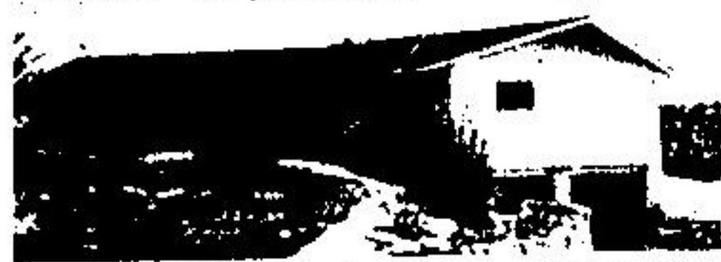
LIKE LIVING ON A CLOUD—Breathtaking scenery and a "one of a kind" home. $126,000.

BE A COUNTRY SQUIRE —Extras include 2 baths, family room with custom built fireplace, custom built kitchen with built-in oven, 2 car garage, large 27x38x12 high work shop, 1 1/4 treed acres located south of Georgetown. Trade in the "rat race" for just $89,900.