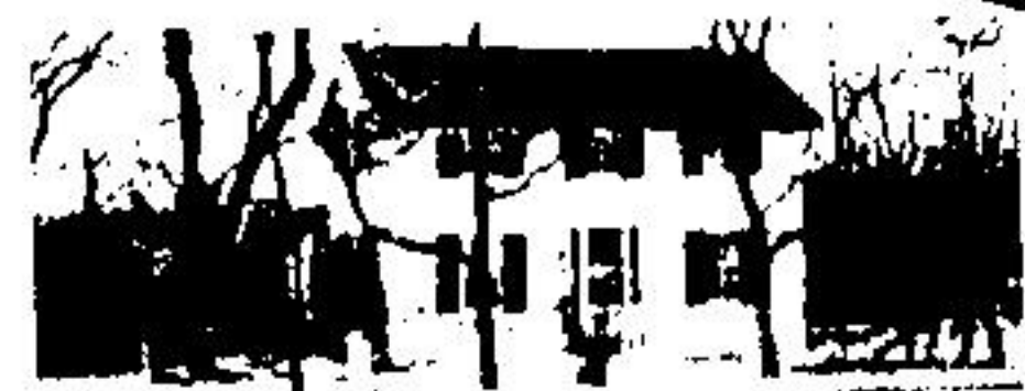
GRACIOUS WHITE BRICK CENTURY HOME—Detached garage on 1 1/4 acres. $95,000.

CLEAN, COMFORTABLE, QUIET CRES-CENT —You can believe it! 3 bedrooms and a dining room plus a beautifully finished rec room on a neat as a pin lot. Try this one for a good buy $54,000.