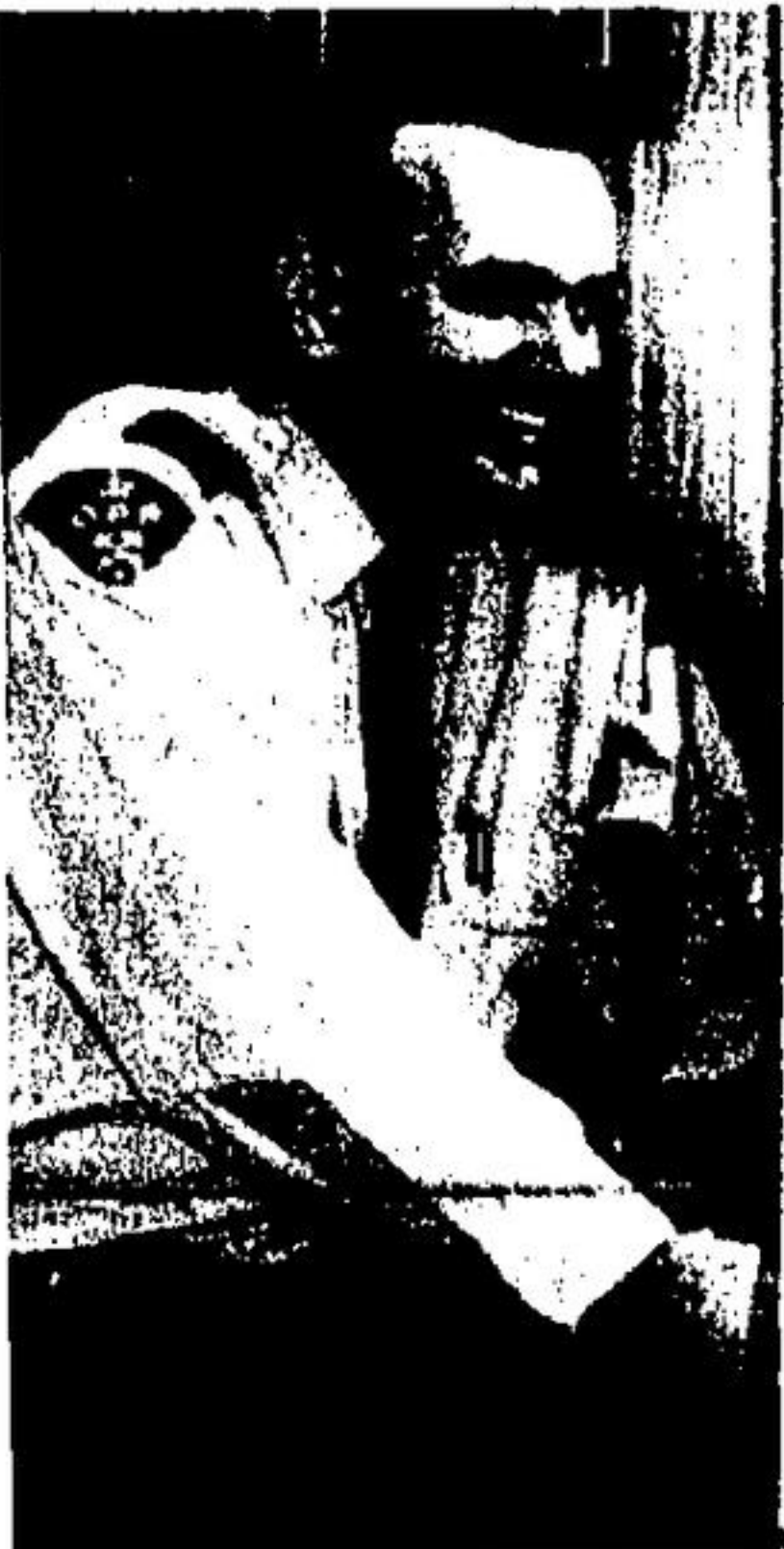
ACTON ONTARIO Provincial Policed Citizens of the Year at a Chamber of Commerce meeting on Monday evening