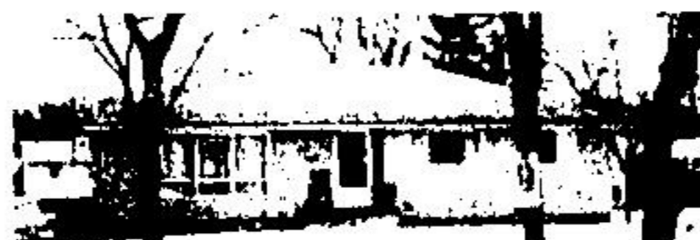
Listed and Sold in one day. How's that for team work? Call the Go Team for your listing.