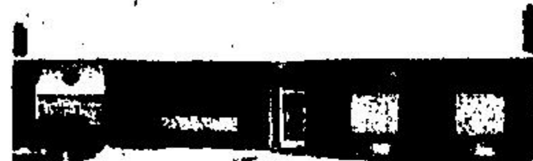
In Erin Village, 2000 sq. ft. raised bungalow, backing onto conservation area. Asking $67,900.

COMPLETELY FURNISHED —Spacious 3 bedroom bungalow, 2 washrooms, finished rec room bar, double paved drive, for just $59,900.