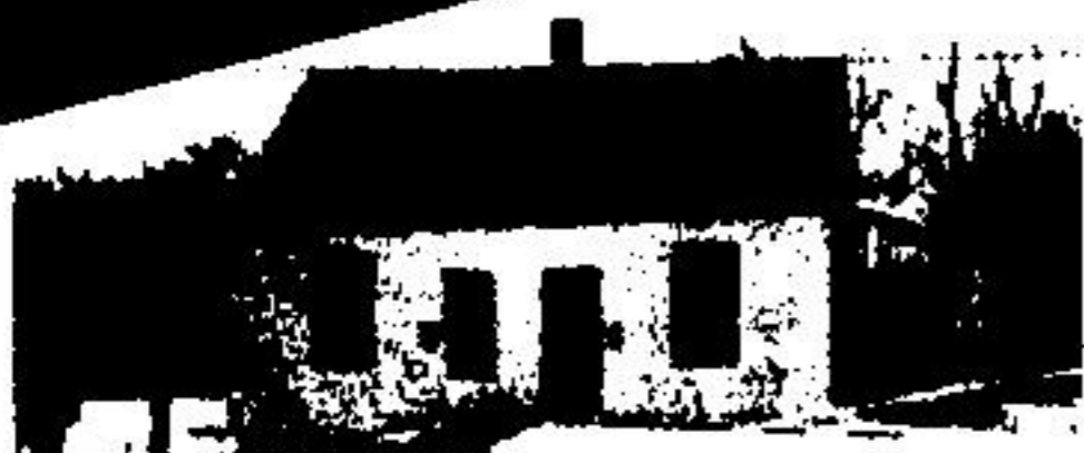
Semi detached, neat and cute, full basement and lots of storage area. $24,500.

EXCELLENT MORTGAGE —Elegantly designed 4 bedroom split level home features main floor family room with sliding glass doors to large lot, formal living and dining areas and a 9-7/8 per cent mortgage. $61,900.