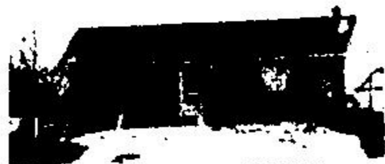
Terrific location, close to plaza and only $48,900.