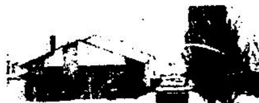
By gosh the price is right, 4 bedroom backsplit immaculate condition $56,500.