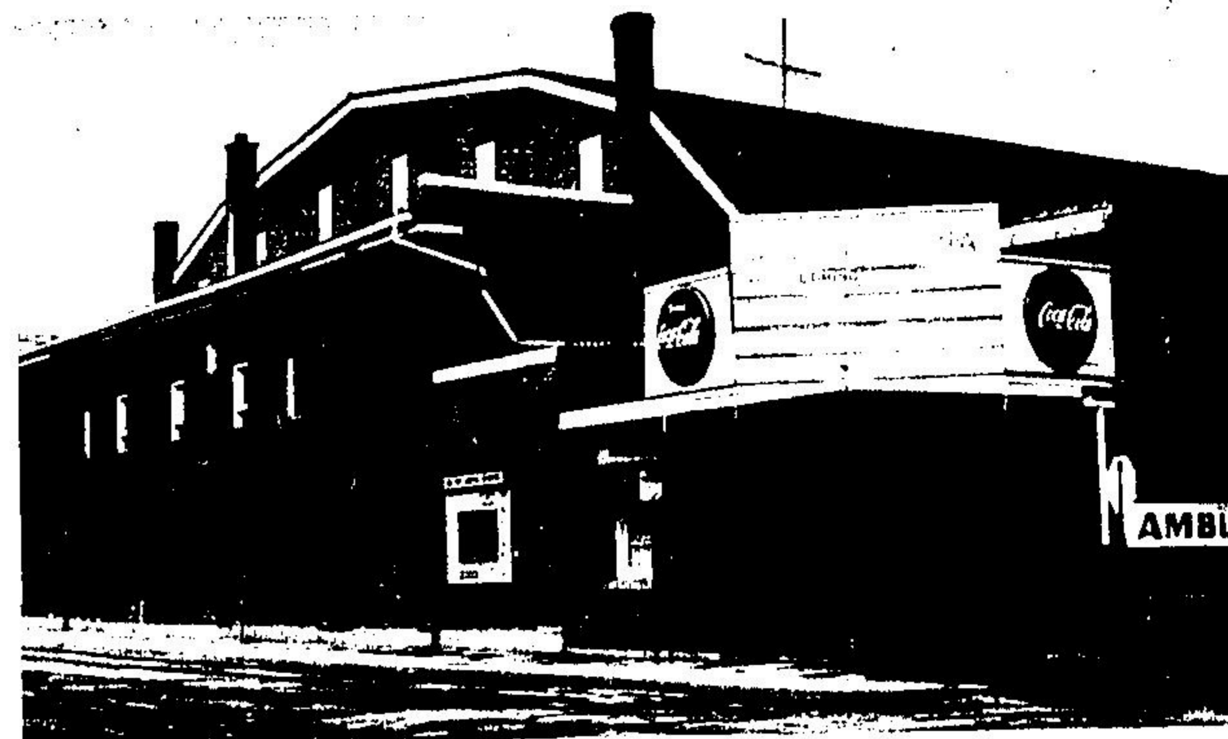
MILTON HOCKEY fans get a birdseye view of activities in the old Fred Armstrong Arena on Brown St. from the glassed-in coffee shop high above the ice surface.