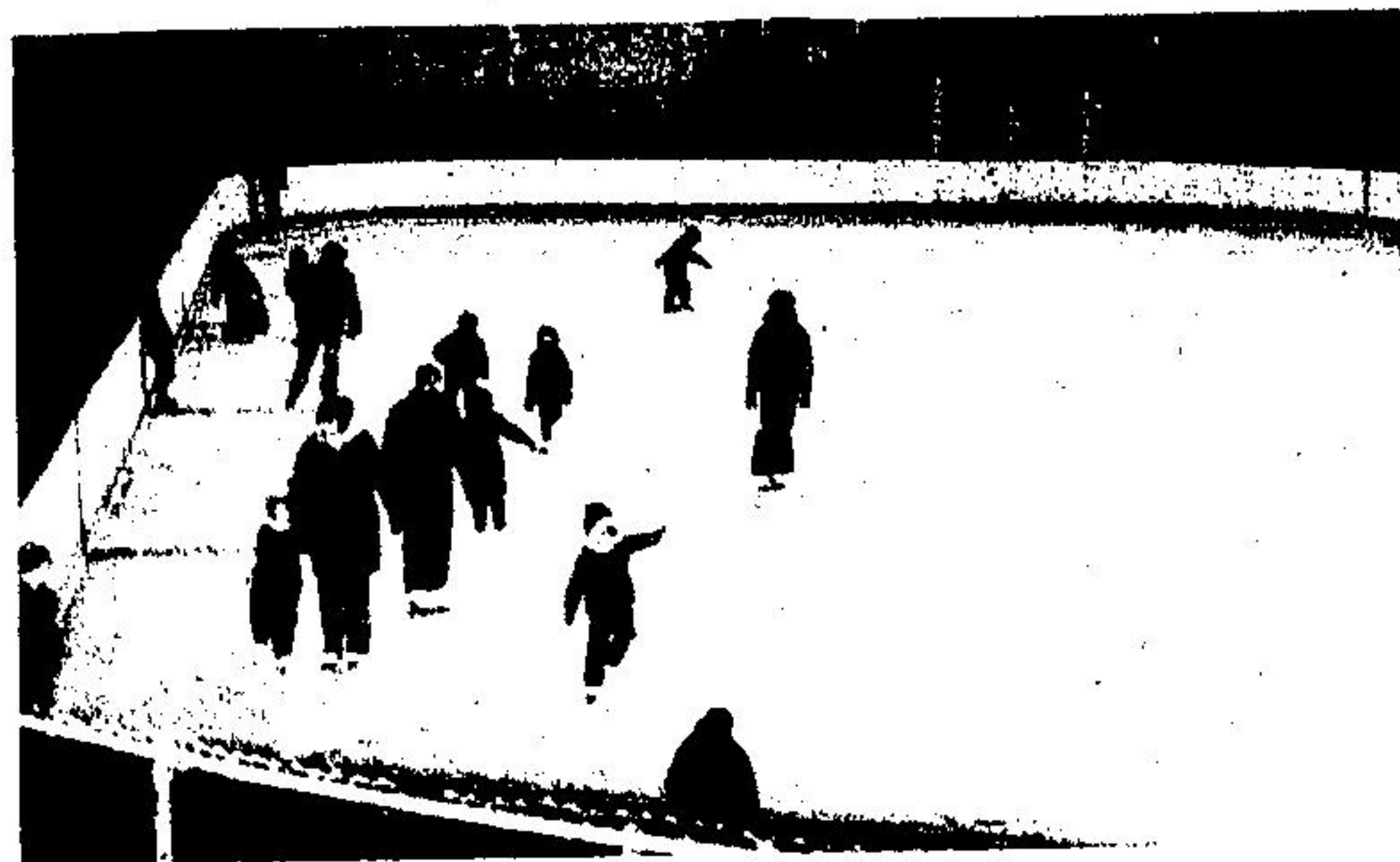
WELL-KNOWN in North Halton as "the band-box", because of its diminutive 175'x70' ice surface, Georgetown Memorial Arena has nevertheless helped develop many professional players and still serves the community well for recreational activities like mother and tots skating

Gordon Alcott Memorial Arena — Built in 1975, expected to be open in spring of same year. Ice surface dimensions 185' x 85'. Seating capacity 1000.