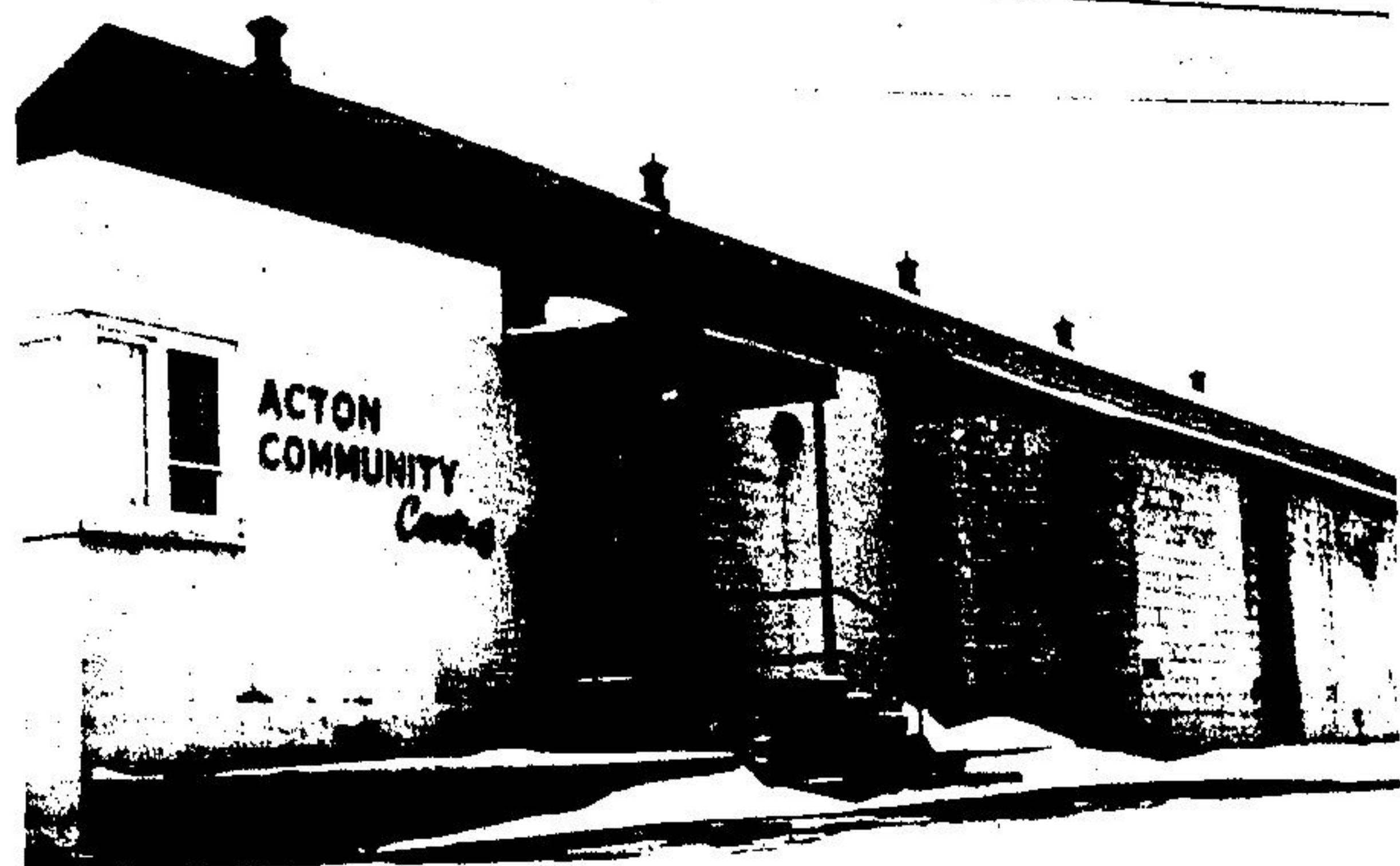
AN AUDITORIUM was added to the front of the Acton Community Centre in 1960 and during the last five years the home of Acton hockey teams has been undergoing a reconstruction program, which has improved its appearance.