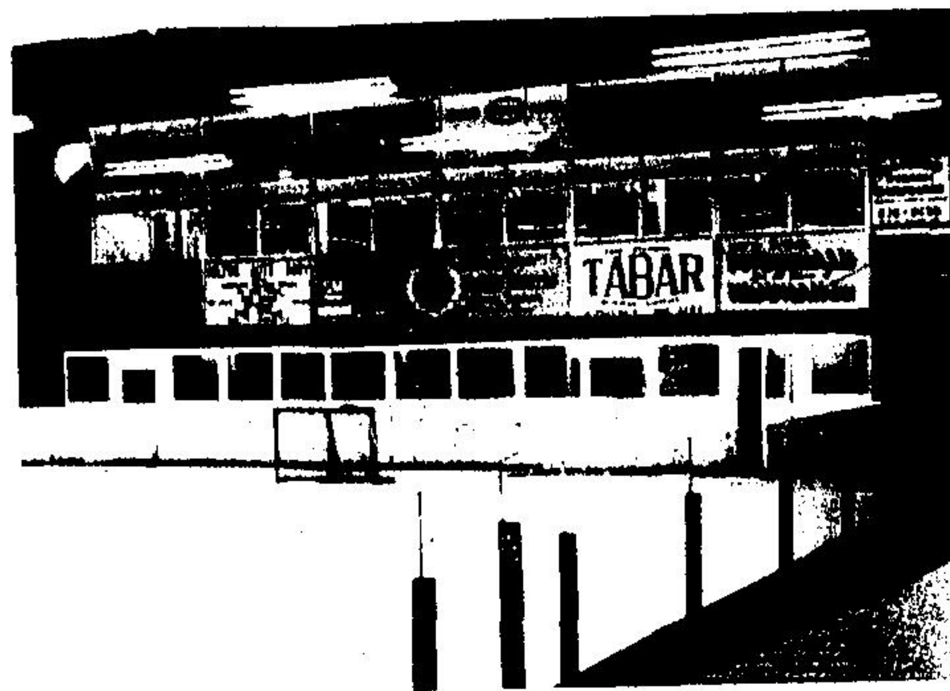
MILTON HOCKEY fans get a birdseye view of activities in the old Fred Armstrong Arena on Brown St. from the glassed-in coffee shop high above the ice surface.