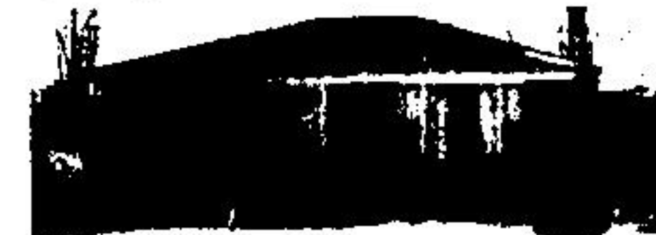
No. 5151—Completely modernized, big kitchen, wood floor in rec room. $48,900.

SUPER LIVING —This gorgeous 2,800 sq. ft. split level home on 2½ acres on edge of town has 4 bedrooms, 2 baths, fireplace in family room, games room, broadloom, plus a 20'x40' heated pool. Many custom features and oodles of extras. You'll fall in love when you see it. $139,000.