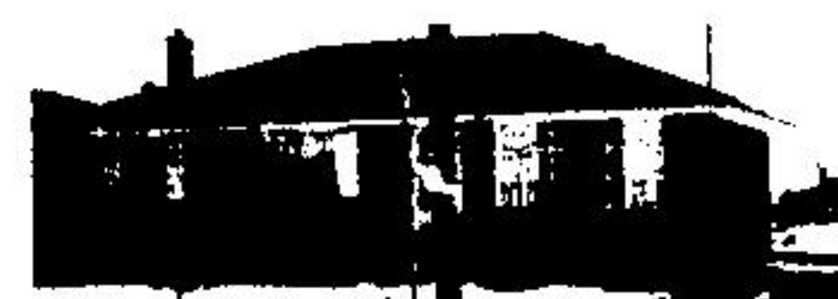
No. 5148—Big covered patio, wet bar in rec room, pool table included. $49,900.