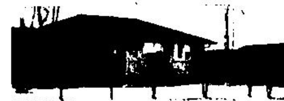
No. 5150—Split level entrance, detached garage, very nicely maintained. $52,900.