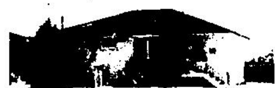
No. 5147—For the gardener a large lot plus a home beautifully decorated. $52,900.