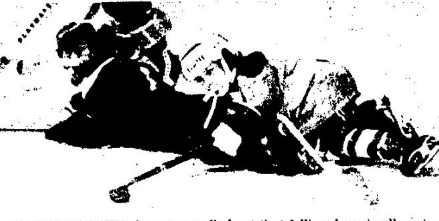
YOUNG HOCKEY players soon find out that falling down is all part of the game. These boys are members of the Legion Minor Hockey group who use the Arena facilities on Saturdays, Mondays and Wednesdays.