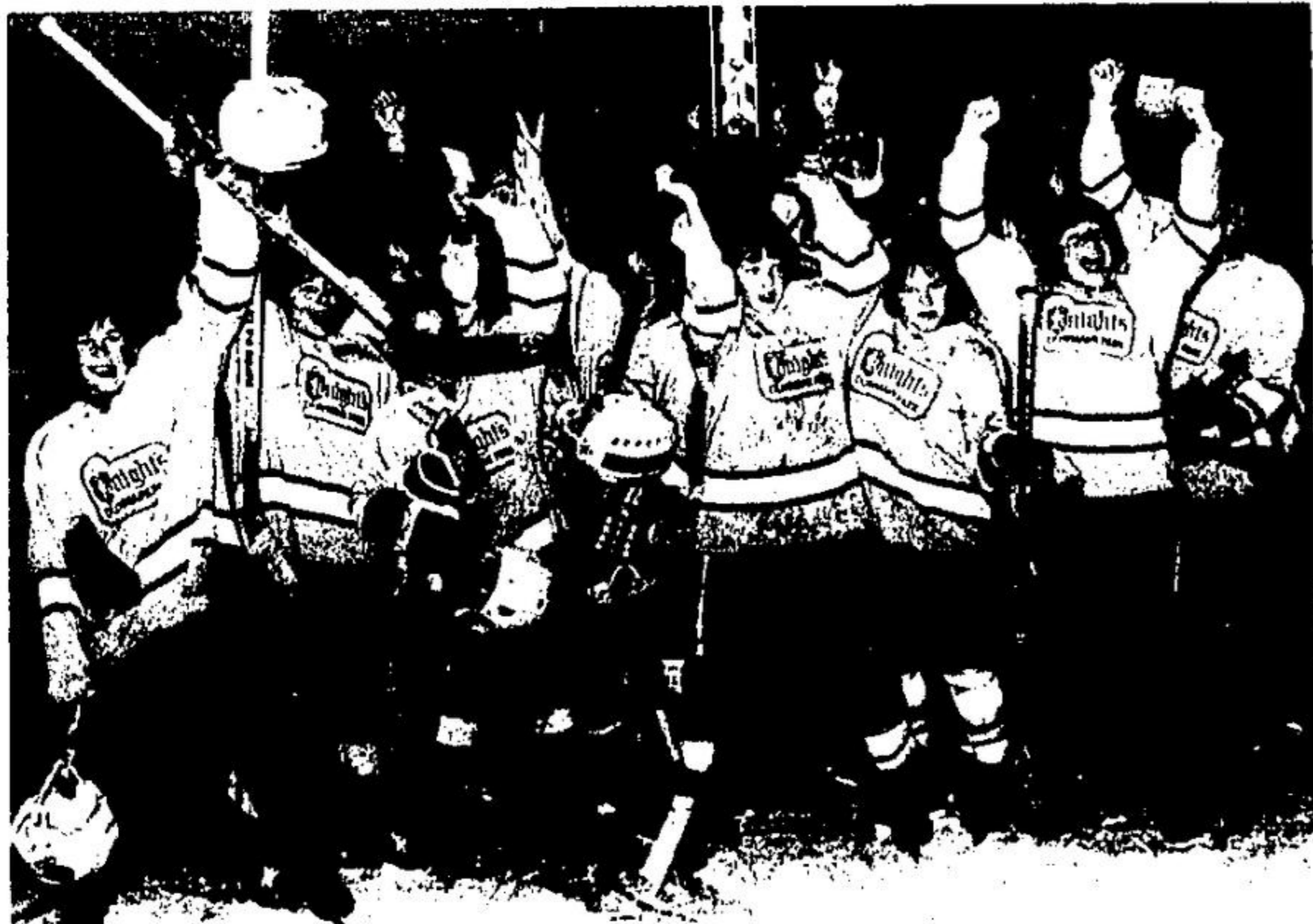
HAPPY Ancaster players whoop it up with their championship trophy.

The peewee house leaguers from Ancaster upset the apparent when they followed their "B" division championship win in last weekend's 6th annual Acton Legion Minor Hockey peewee house league tournament by knocking off the "A" champs Streetsville 5-2 in the grand championship game.