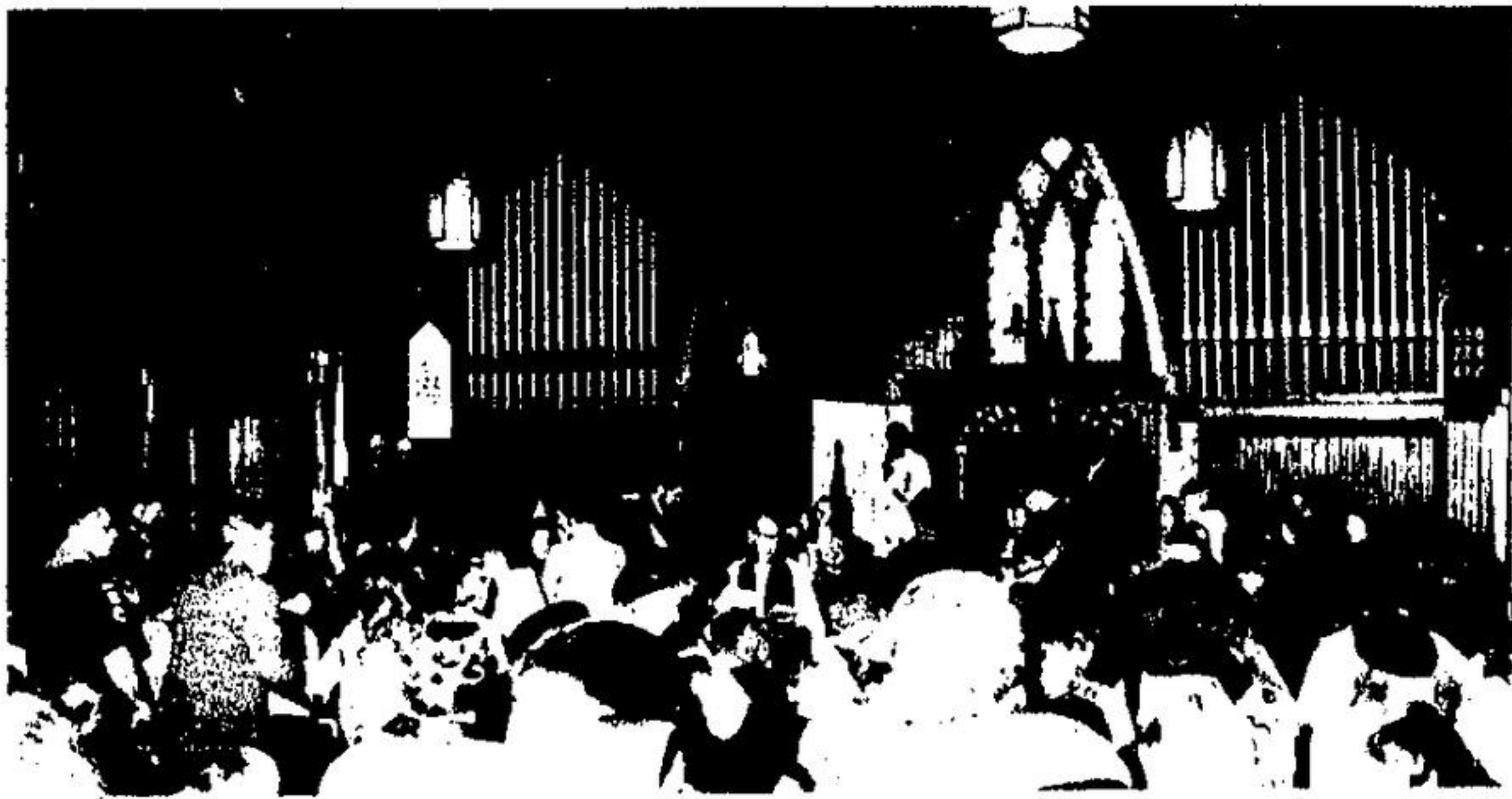
ST. ALBAN'S church was filled Sunday afternoon for a special church service for scouts, cubs, guides and brownies. Clergymen of all

churches participated. It's hoped to make this an annual event at the time of Scout and Guide week.