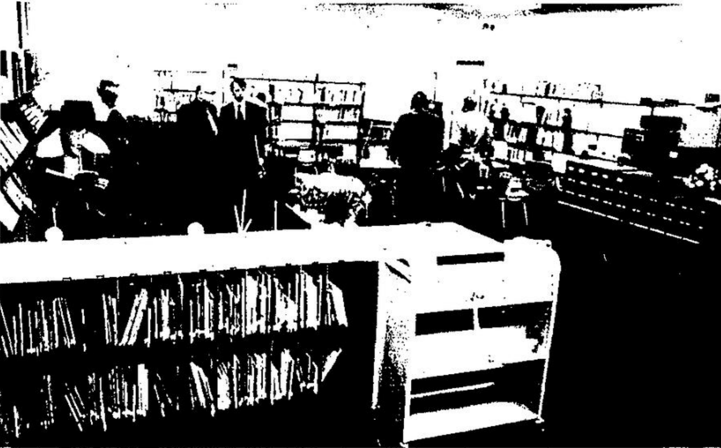
PROSPECTIVE ADULT members of Limehouse community branch library toured the room Saturday morning before the official opening.