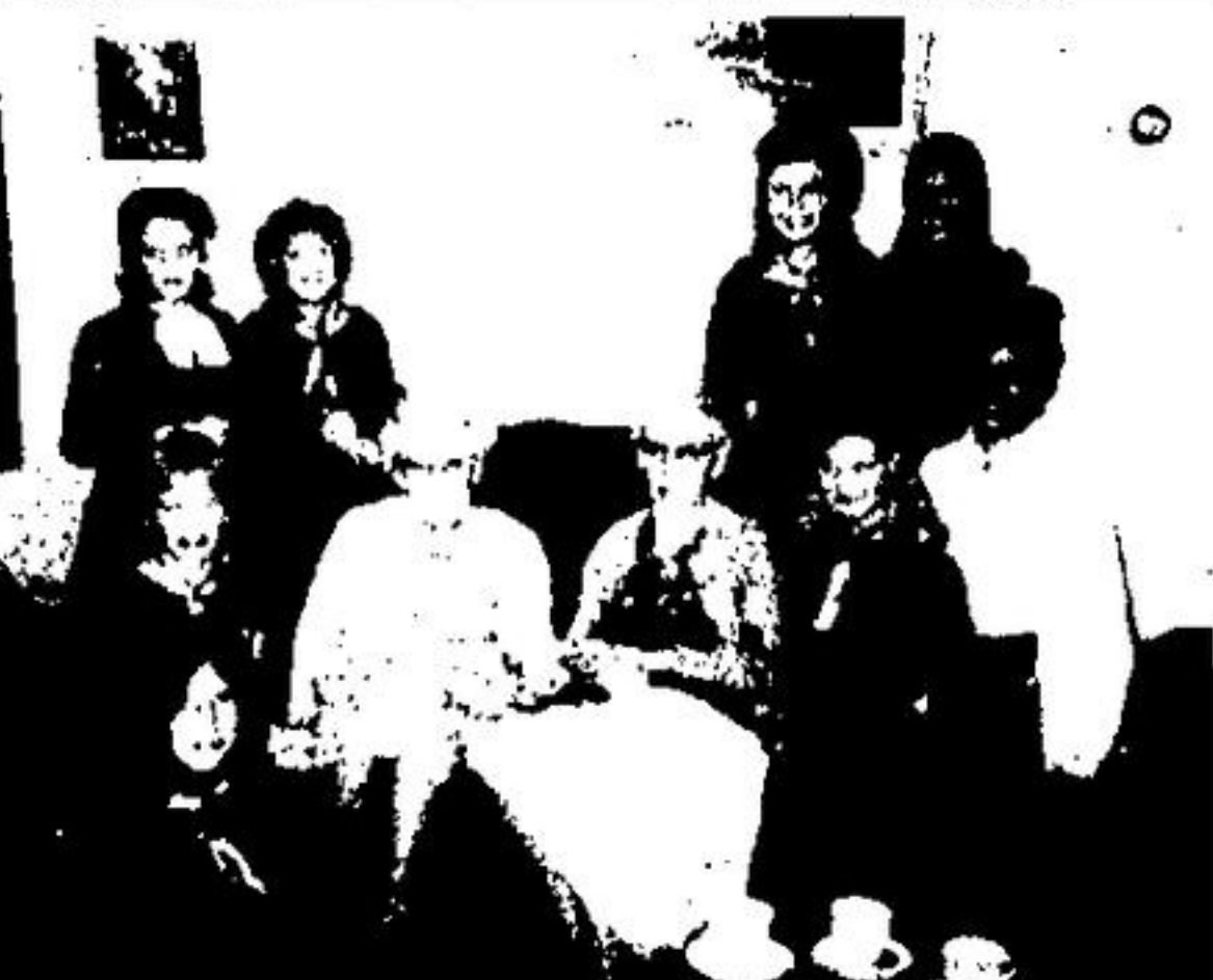
FIRST ACTON GUIDE pack are busy around the community. The girls enjoyed themselves as they sang carols at a nearby nursing home in the Christmas season.