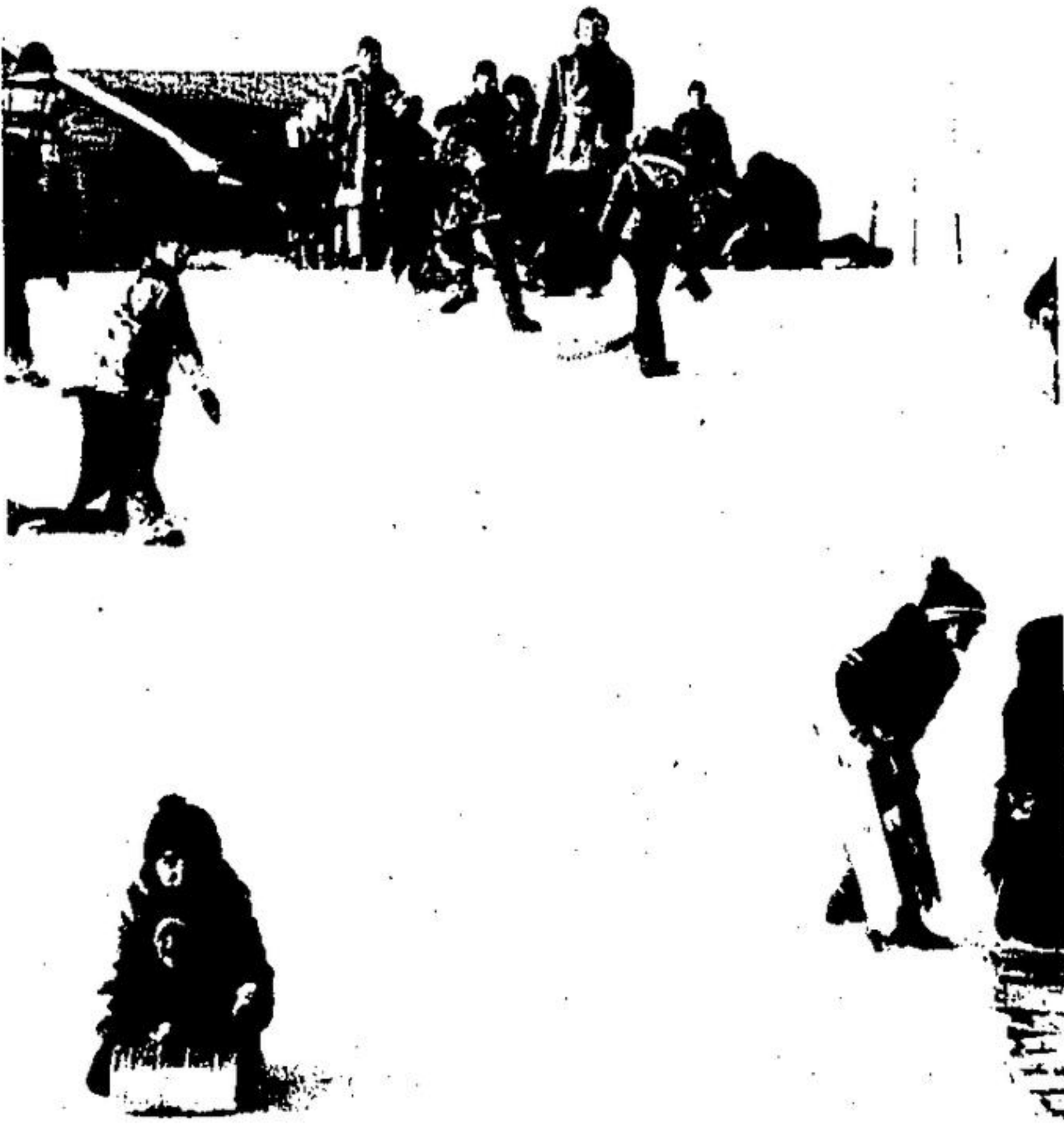
CLEAR THE TRACK! Sunday neighbors gathered on snowy hills to prove that winter isn't all bad. Snowmobilers were out in force at the Ponderosa trails and the three outdoor skating rinks were enjoyed, too. Photographer Peter McCusker dodged flying saucers to get this picture.