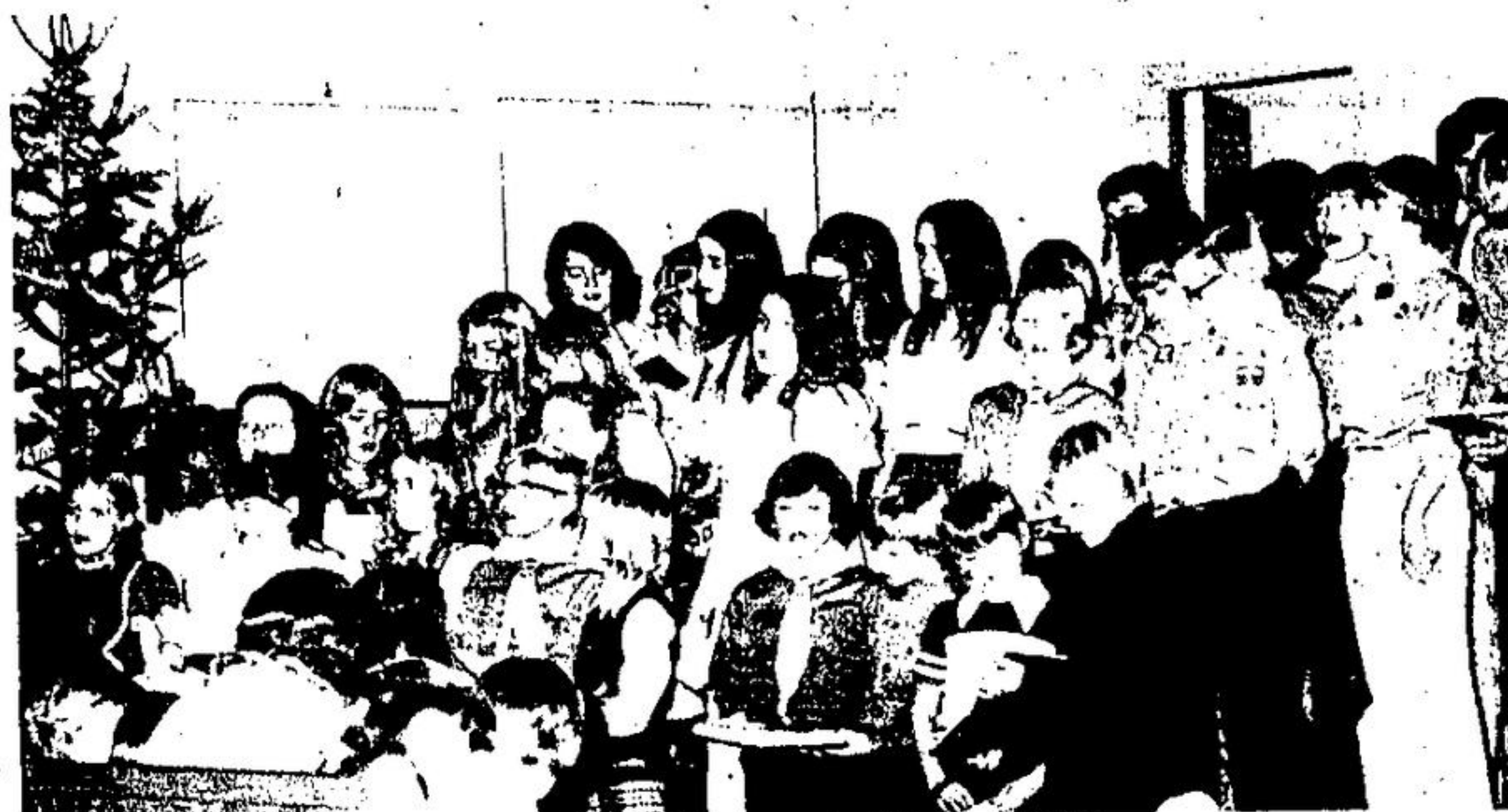
CHRISTMAS CONCERT at the Christian Reformed Church on Highway 7 featured Calvinettes and Cadets in a combined choir. The evening concluded with a gathering of the congregation downstairs. It was one of many holiday programs in town.

Weather has been unusually mild. However, snowmobilers have been out on the lake and skiers found places to go during the holiday weeks.