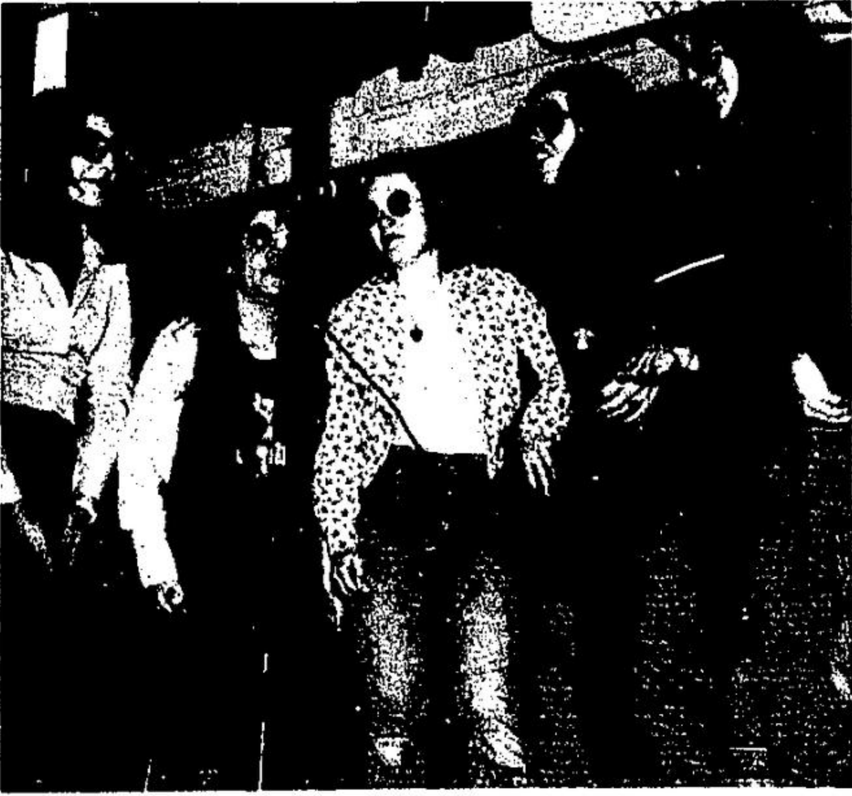
IS IT THE Dave Clark Five? No, not quite. These girls sang quite a few numbers at the high school assembly on December 20, bringing teachers into the act with one number and students into the act with others.