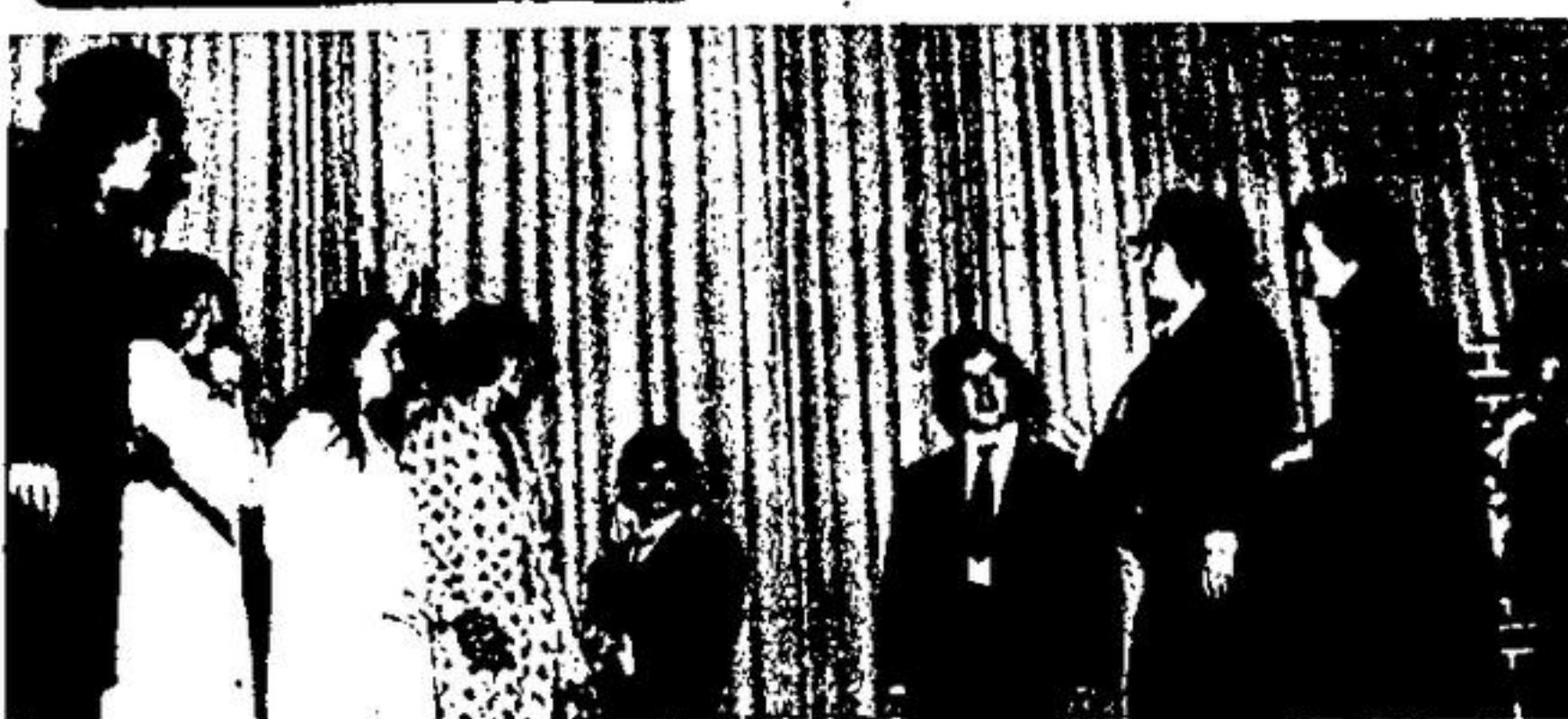
GODFATHER PART 10 was enjoyed by all at the annual Christmas assembly at the high school on December 20. The Godfather and his gang decided to raid an innocent home on Christmas eve and kidnapped one of the children. Tones of Patty Hearst came into being when the girl becomes "one of them."