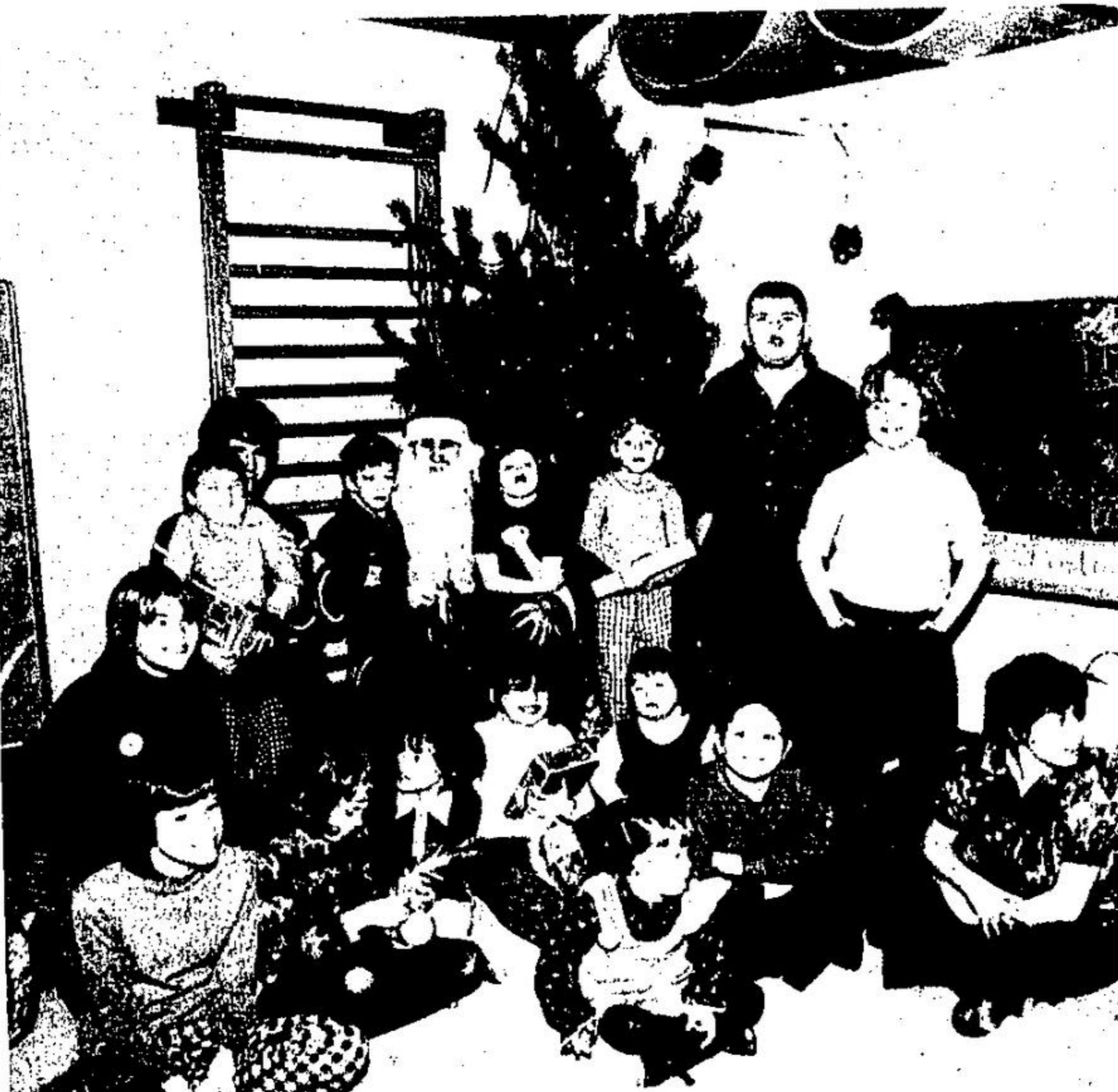
EVERYONE'S HAPPY when Santa Claus pays a visit and the children at the Sunshine School for his gifts of toys and candies by presenting him with a program of music and Christmas plays.

Some feel that under the proposed system the region will determine which areas will be developed. Local councils will have very little say about which areas should be developed.