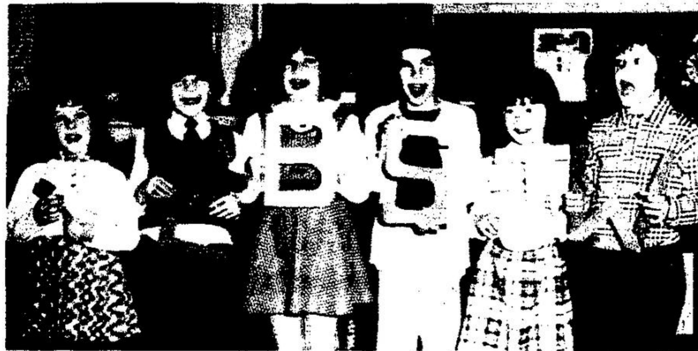
ABC CHRISTMAS was the theme of a junior class skit at Ebenezer United Sunday School concert Friday night, Dec. 13. The hall was crowded as people congregated to enjoy the pot-luck supper followed by the presentation of skits, solos and recitations. The junior group lined up