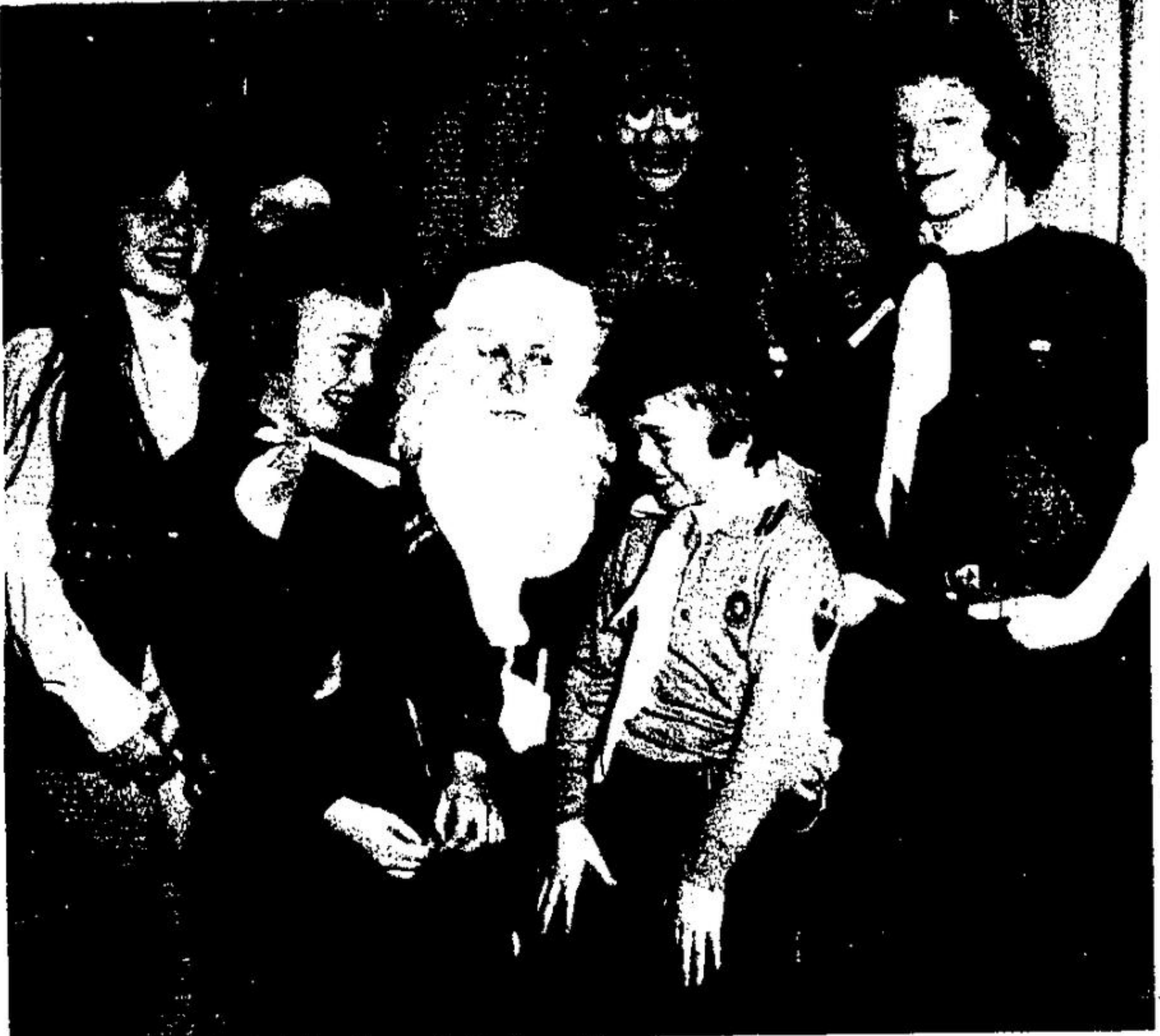
CUBS, SCOUTS, BROWNIES and Guides had a big celebration last Wednesday night when they gathered at the Rockwood Centennial school for a combined Christmas party. Games and a delicious supper organized by the Group Committee was part of the exciting evening topped off by the arrival of Santa Claus and his helpers seen here with children of the community.