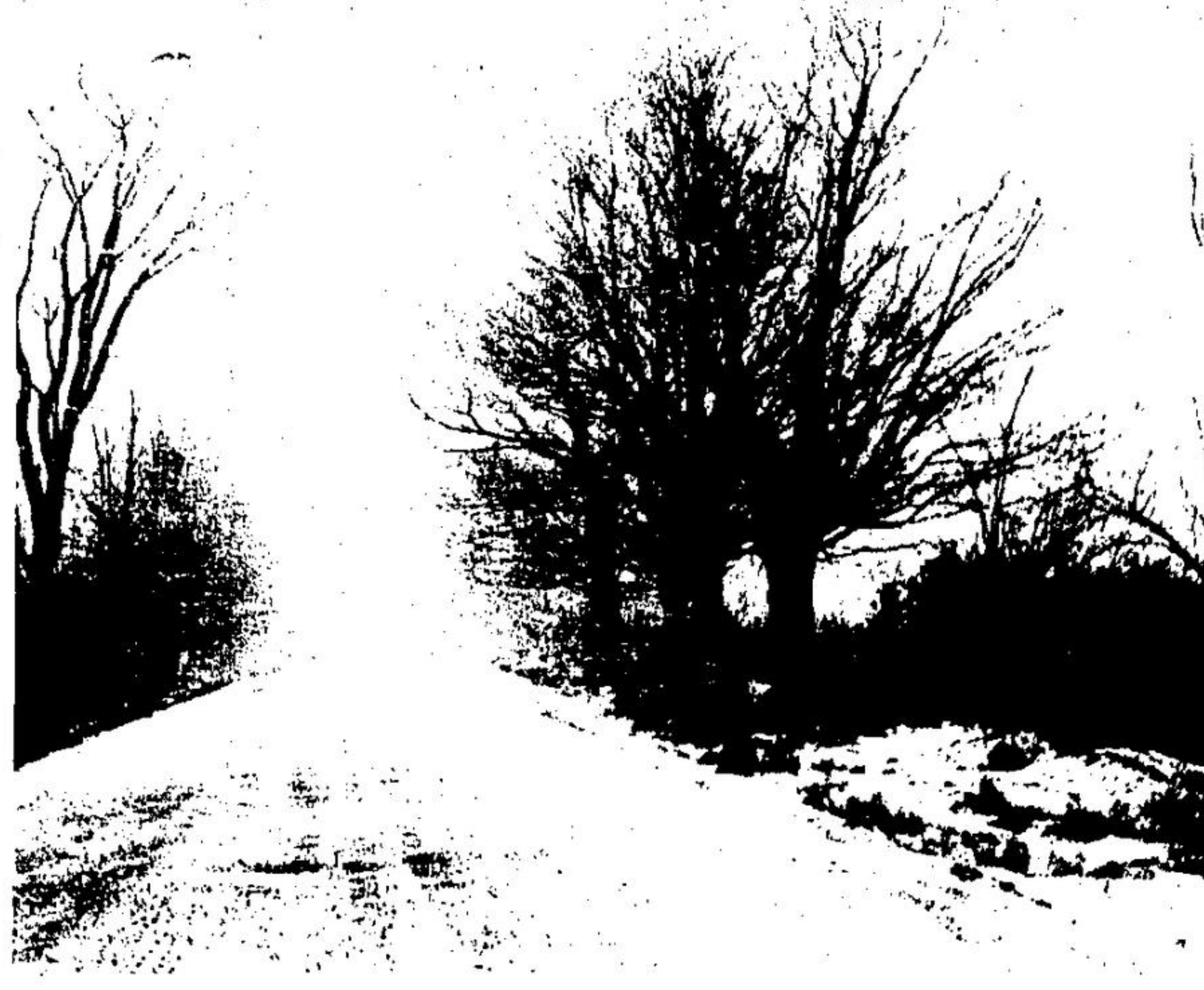
SNOW BLOWS across the Esquesing-Nassagaweya town line during the first wild snowstorm of the season Monday. Bad weather was blamed for keeping out many voters in Eramosa and Erin.